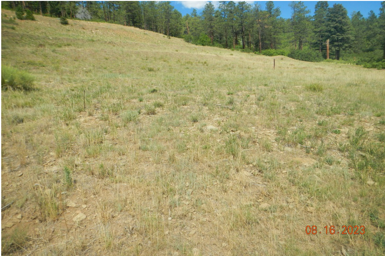
Photo 9. Facing northwest toward the reclaimed the location. The location is recontoured and vegetation is progressing well.