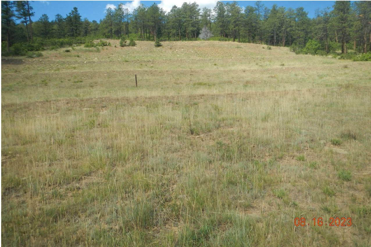
Photo 7. Facing west toward the reclaimed the location. The location is recontoured and vegetation is progressing well.