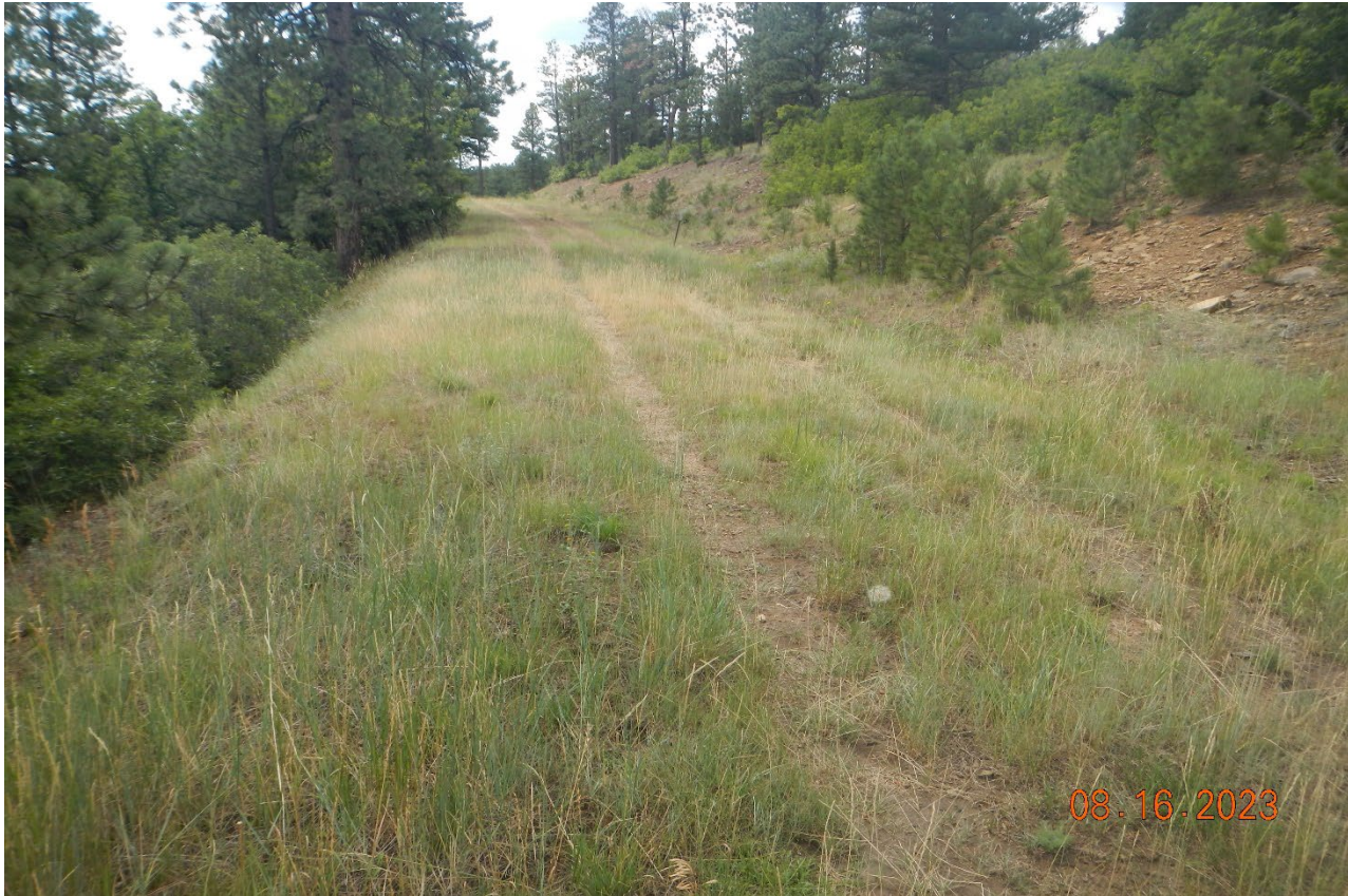
Photo 3. Facing southeast along the access road which remains per approved variance.