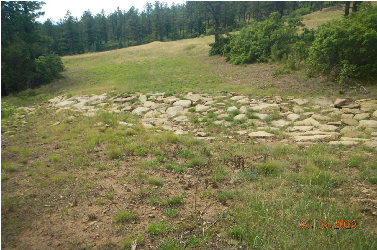
Photo 4. Facing southeast along the portion of the road that was fully reclaimed.