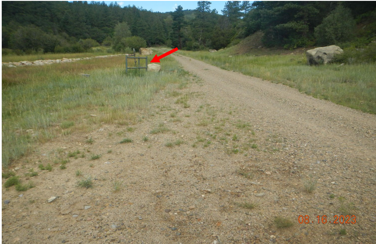
Photo 1. Facing northwest along the main access road. There is an abandoned pipe riser that still remains. No active well sites exist in this area and the riser needs to be removed.