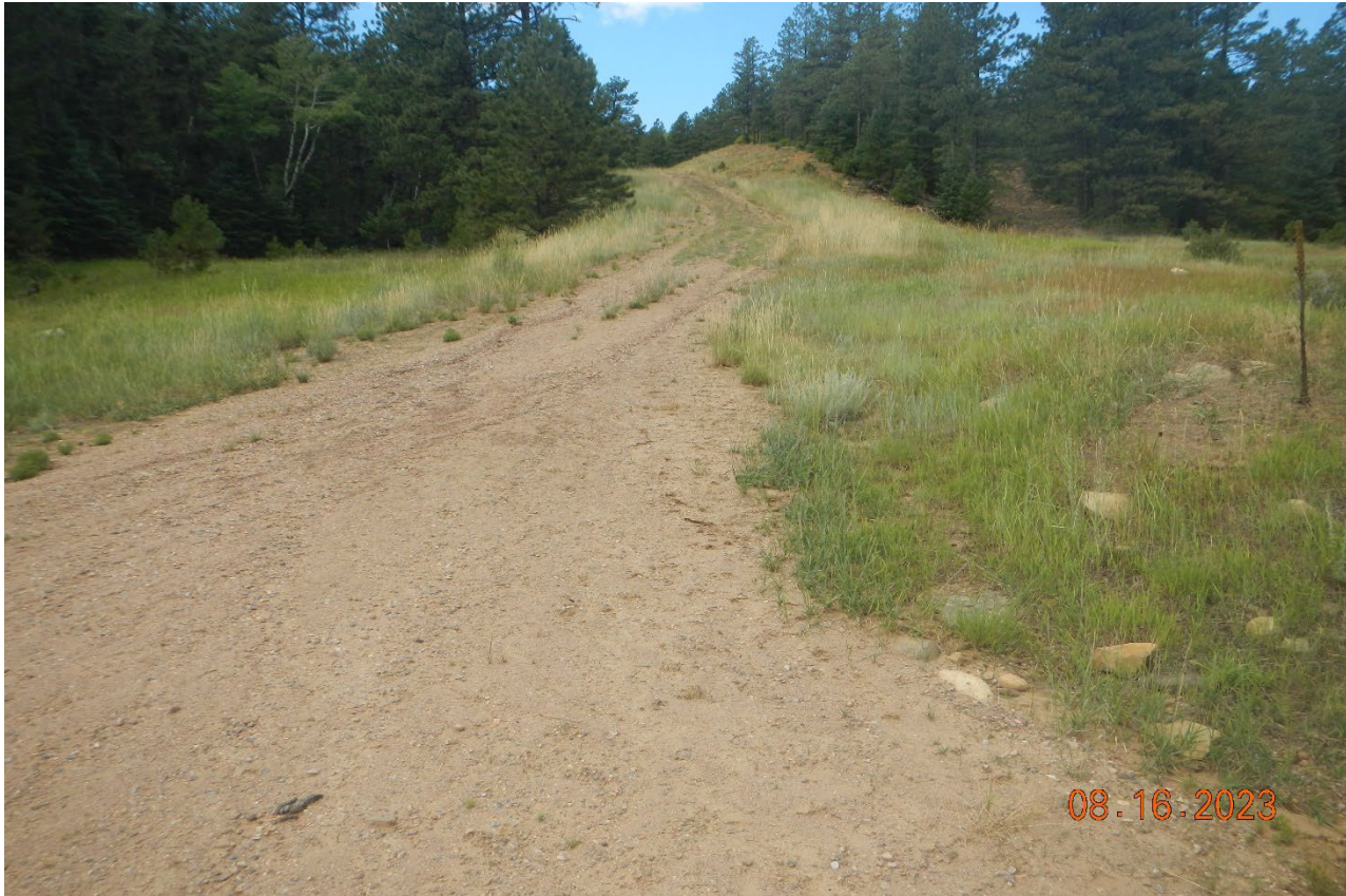
Photo 2. Facing west toward the access road which remains per approved variance.