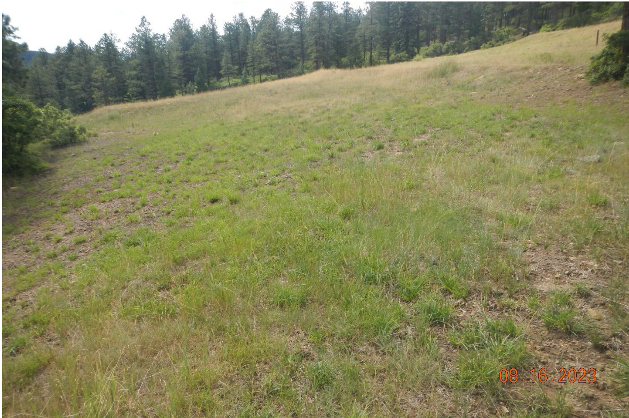
Photo 6. Facing southeast toward the bottom portion of the location. The location is recontoured and vegetation is progressing well..