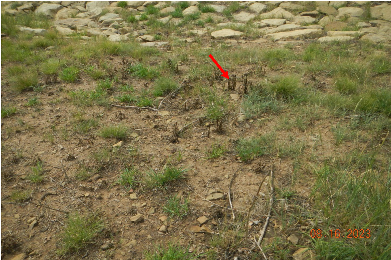
Photo 5. There are noxious weeds at red arrow (Canada thistle) which are wilted from recent weed control.