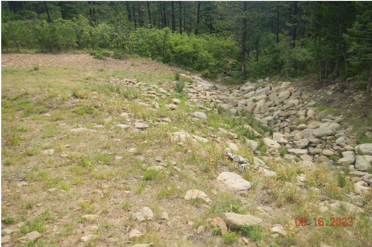
Photo 8. Facing southwest at the location. There are numerous noxious weeds in this area. Some are wilted and controlled but some are not. Follow up weed control will need to be performed.