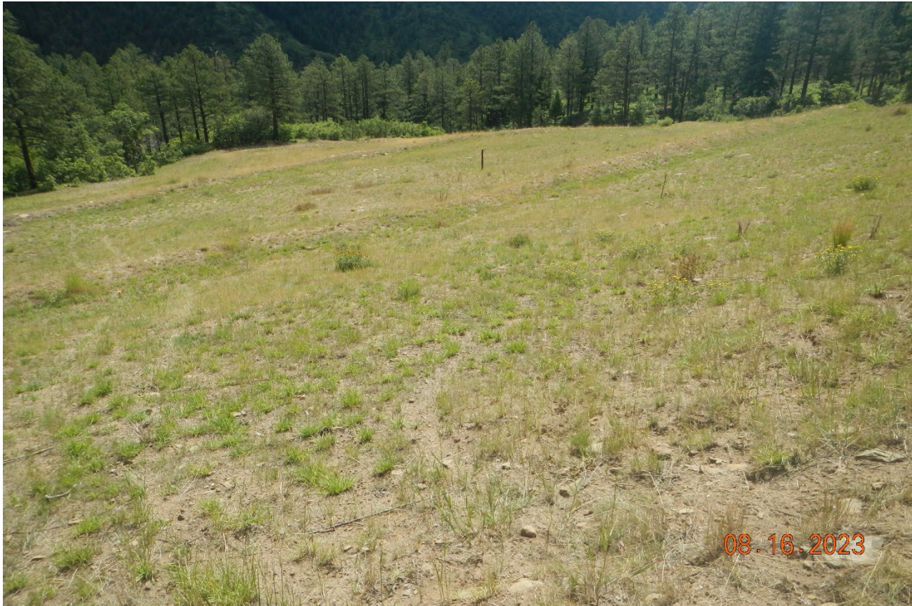
Photo 10. Facing southeast toward the reclaimed the location. The location is recontoured and vegetation is progressing well.