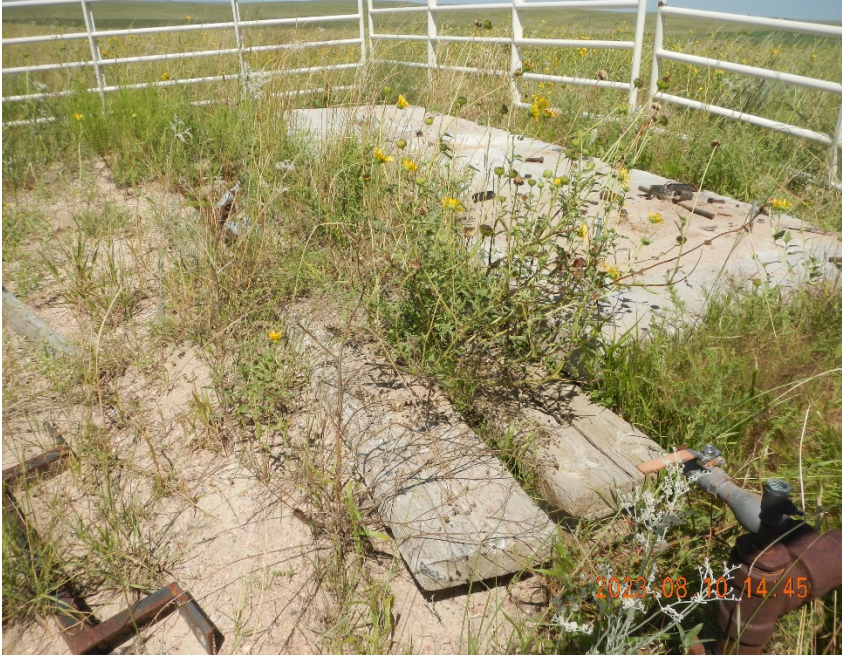
7. Additional view of production related debris left at well site. Note vegetation.