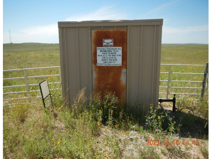
4. Meter Shed. Note vegetation.