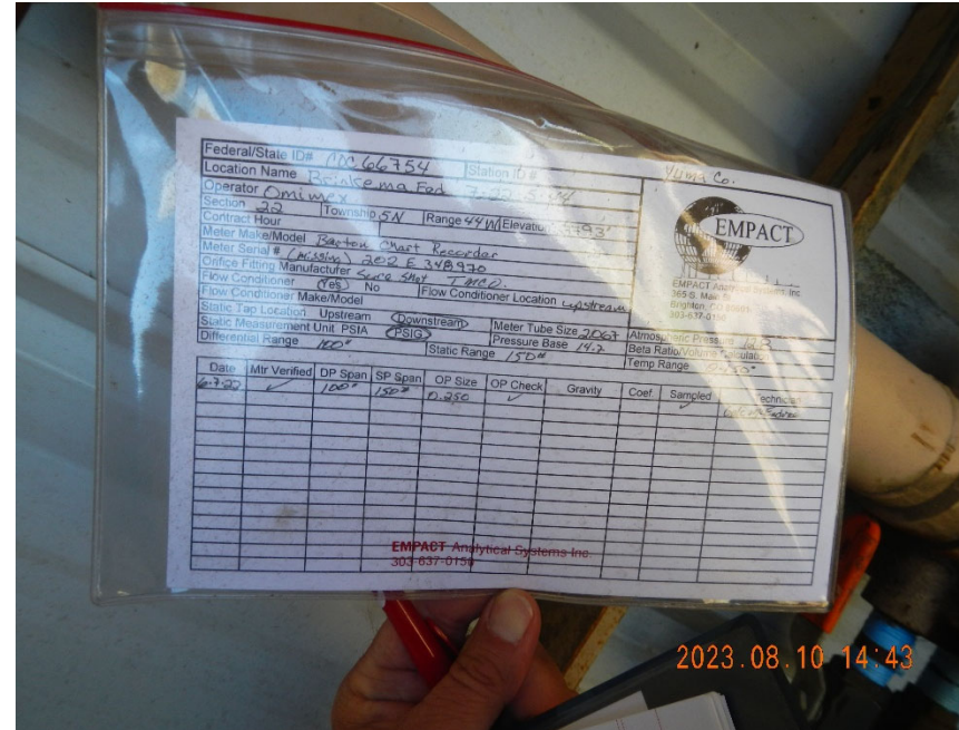
6. Meter Calibration/Test Log inside Meter Shed at time of inspection.