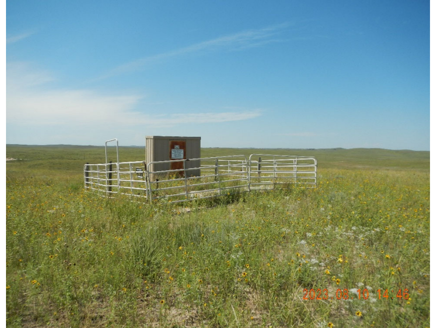
8. Well location overview.