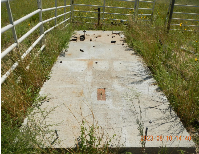
3. Cement pad left in place after Pump Jack was removed. Note vegetation.