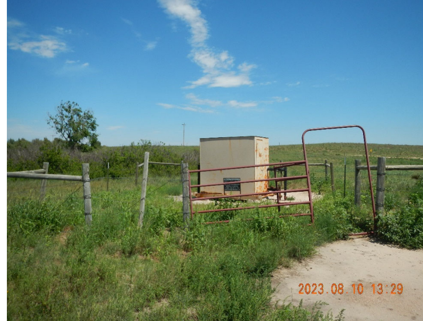
8. Remote Gas Meter Run overview. Note vegetation.