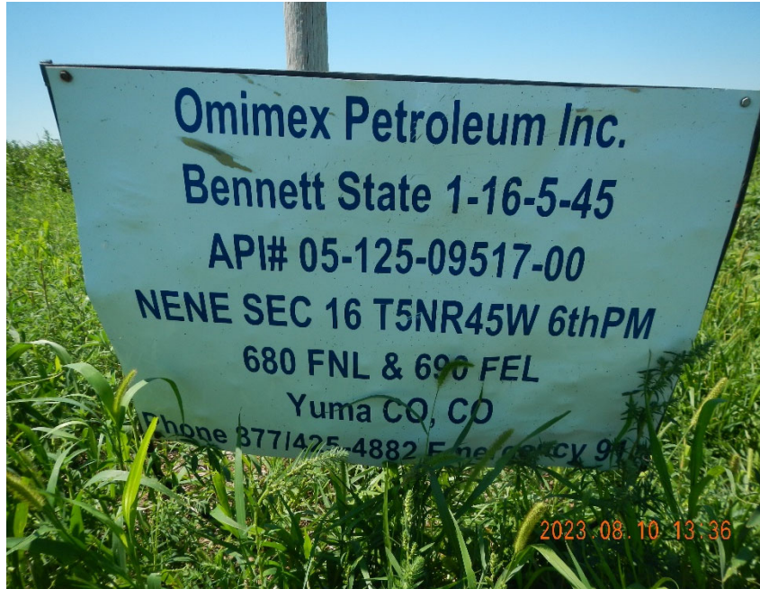
1. Well sign at well location. Note vegetation.