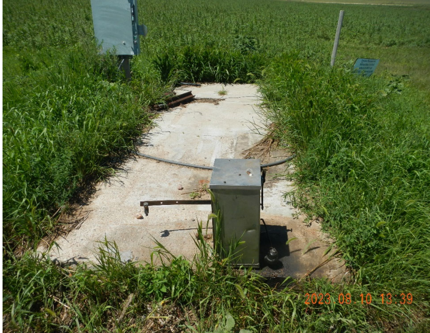
3. Cement pad left at well site after Pump Jack removal.