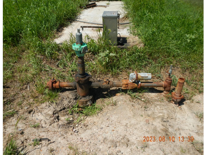
2. Wellhead. Note vegetation and production related debris in background.