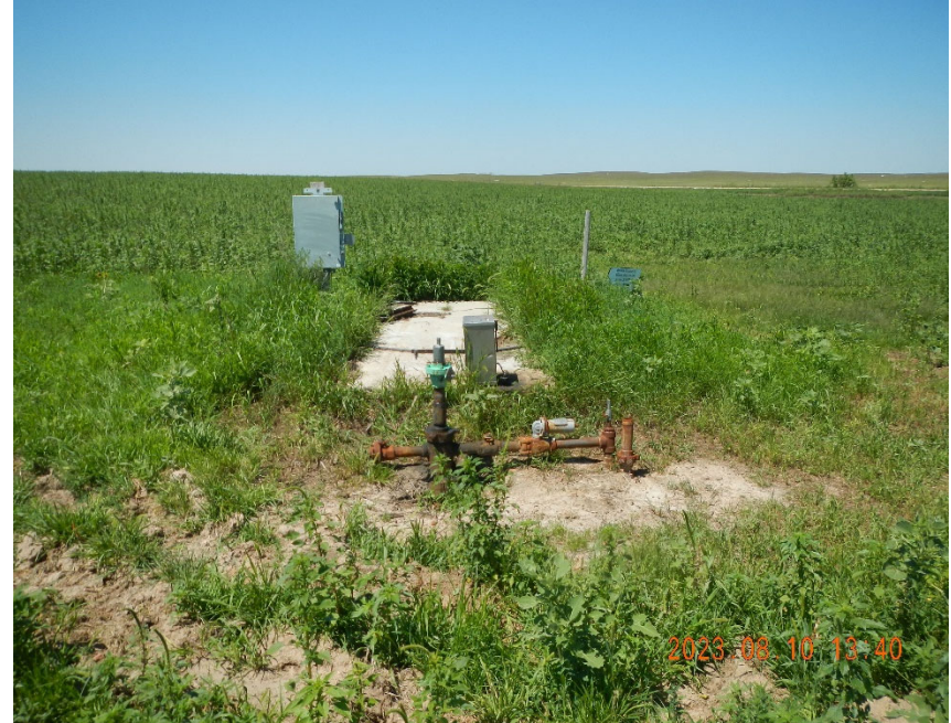
4. Well location overview. Note vegetation.