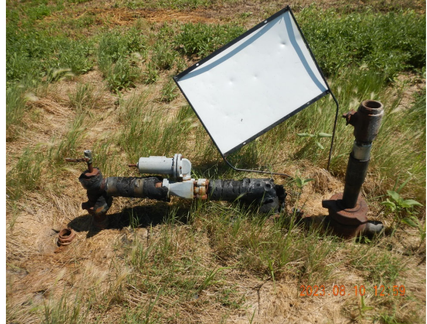
2. View of Wellhead. Note Vegetation.