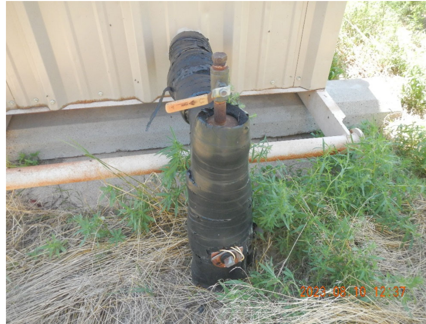
10. View of well inlet valve into remote meter shed.