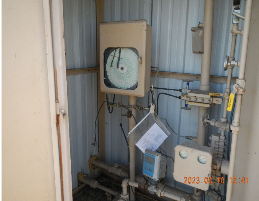
7. View of gas meter run inside meter shed.