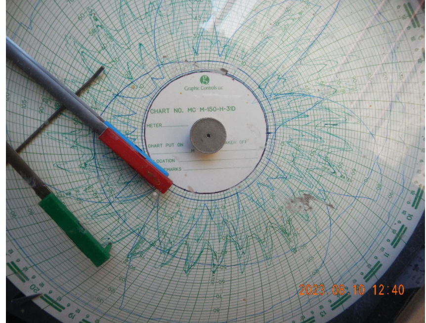
8. Undated Chart in Meter Box at time of inspection.