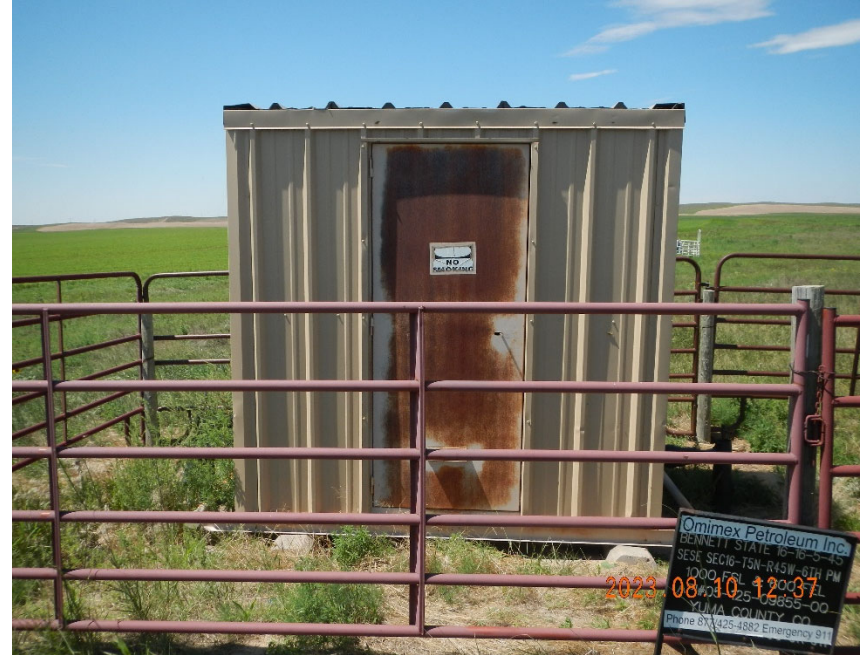
6. View of remote meter shed. Note vegetation.