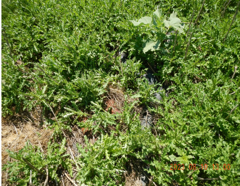
3. Production related debris under noted vegetation at well site.