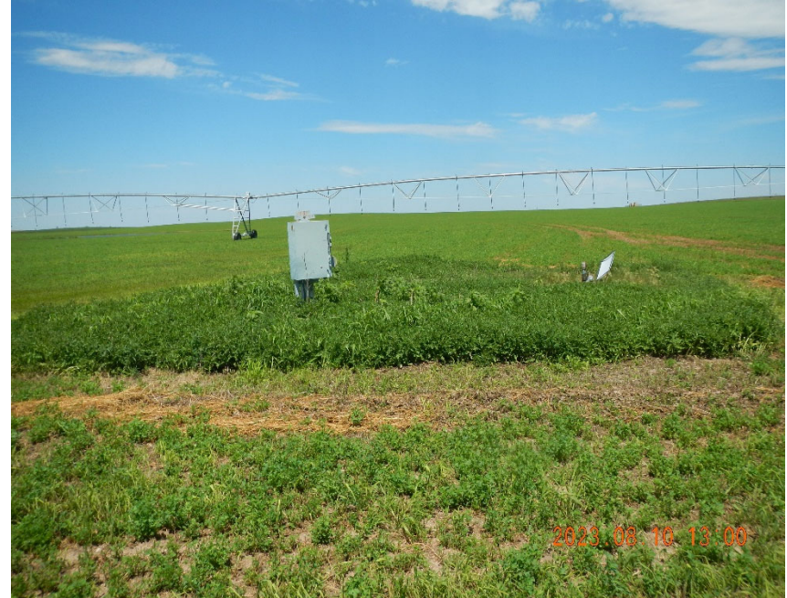
4. Well location overview. Note vegetation.