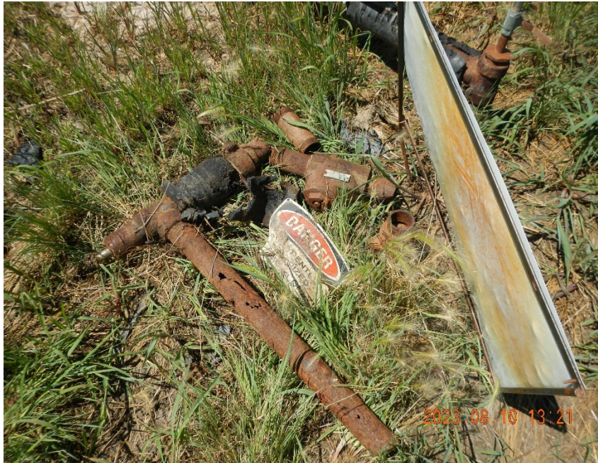
3. Production related debris at well site. Note vegetation.