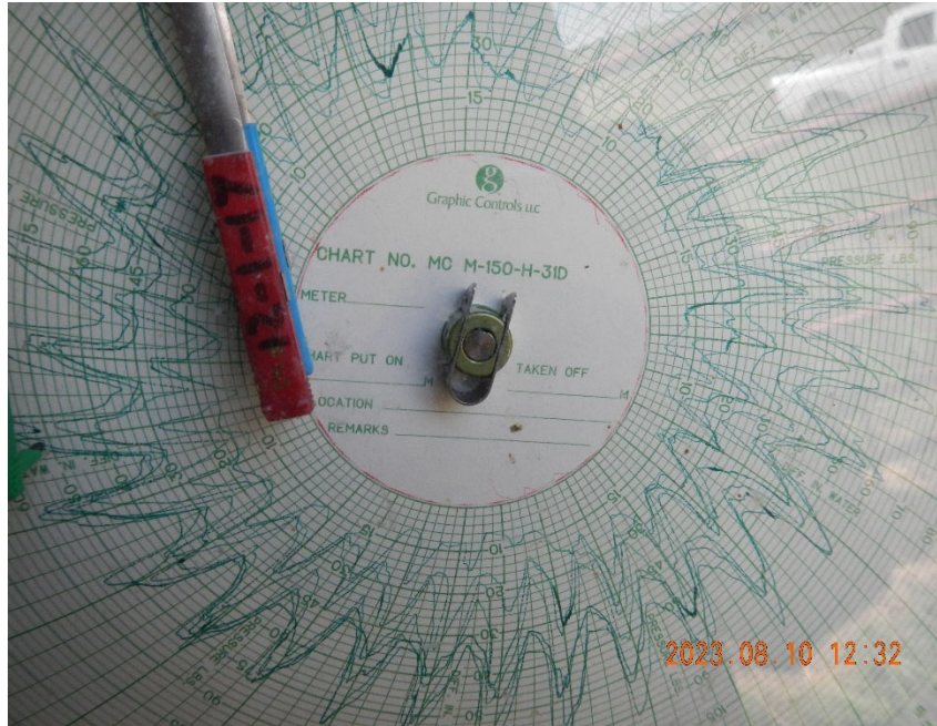
7. Undated Chart in Meter Box at time of inspection.