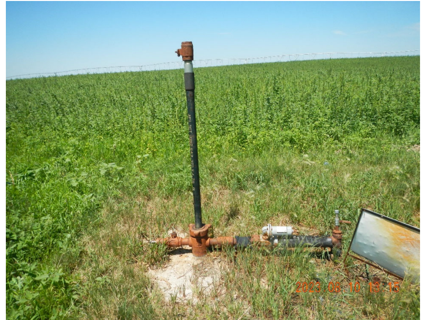
2. View of Wellhead. Note vegetation.