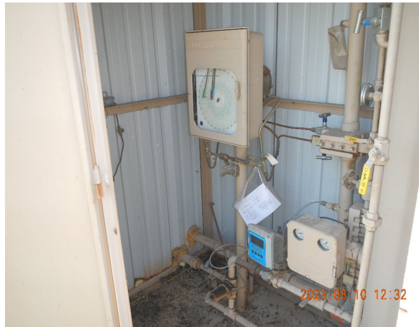
6. Gas Meter Run inside Meter Shed.