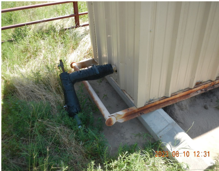
5. View of Meter Shed nearly off concrete supports.