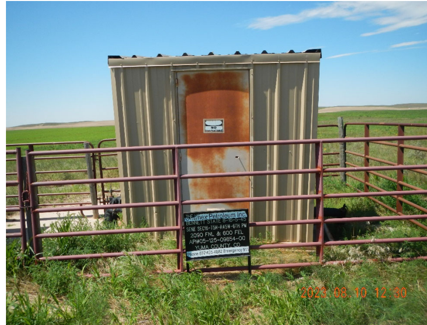
4. Remote Gas Meter Run site. Note vegetation.