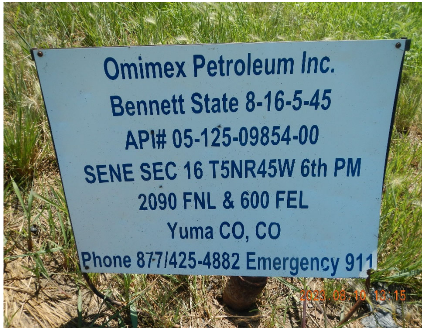
1. Well sign at well location.