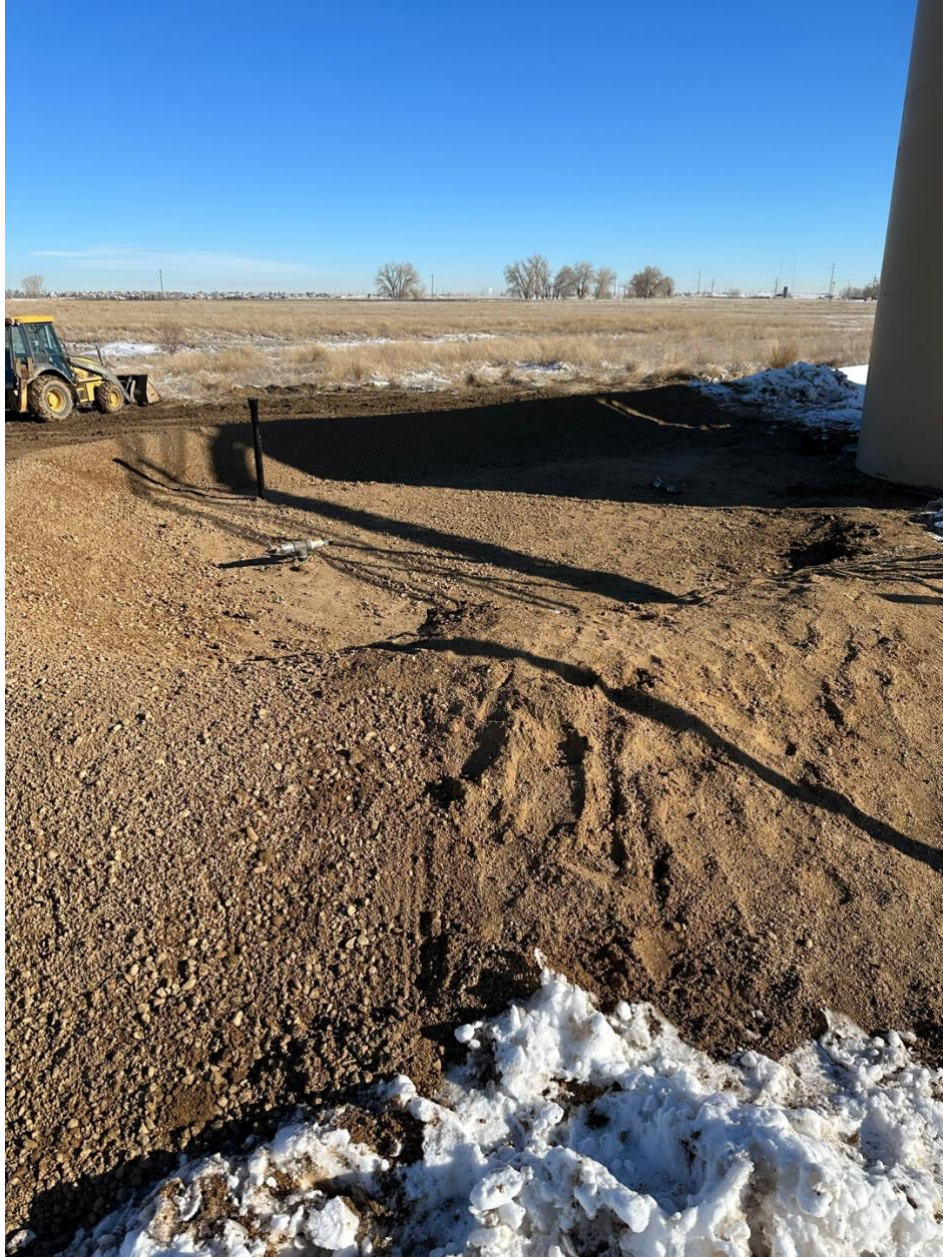
Pad after Gypsum Application, and Backfill, Prepared for new Tank