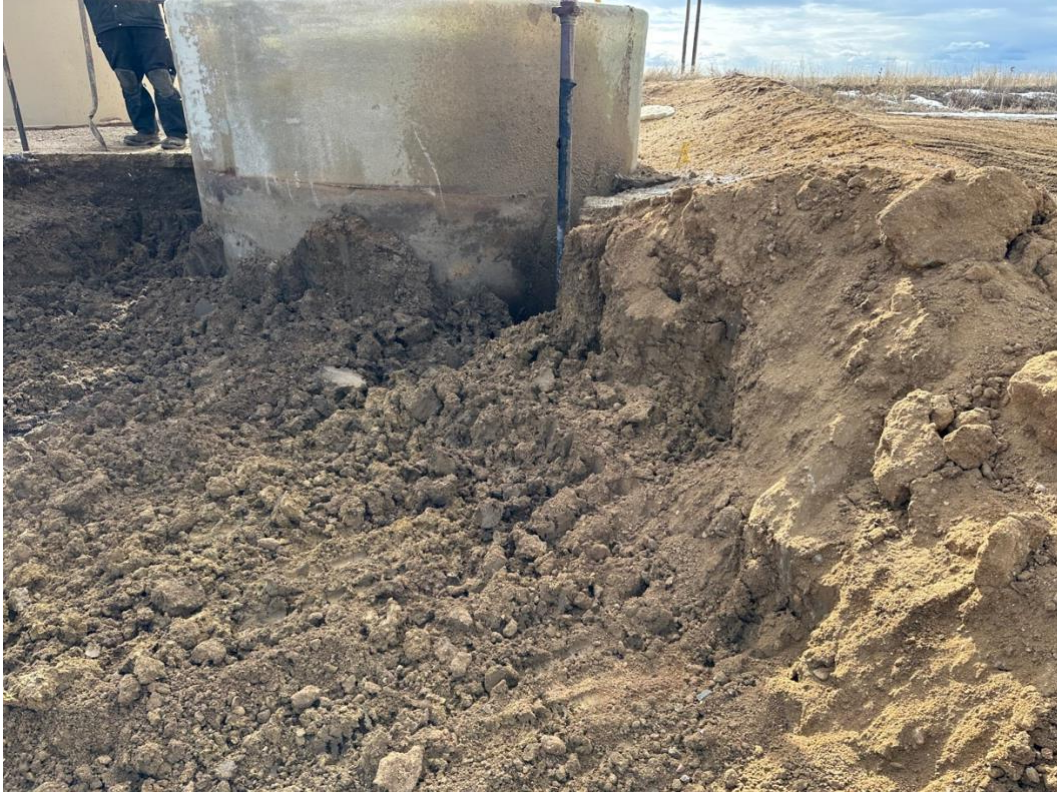
Pre-Removal During Initial Excavation and Hydrovac