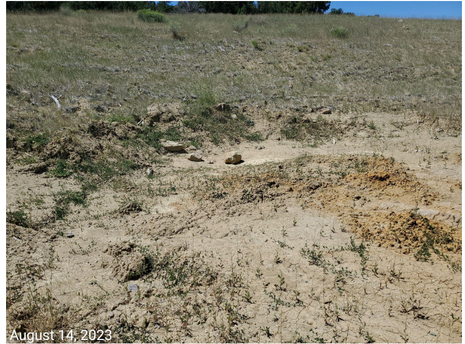
Photo 10: Photo left example showing marked anchors on the NW/NE/SE corners of the working pad surface. Photo right shows marker for the SW anchor is missing.