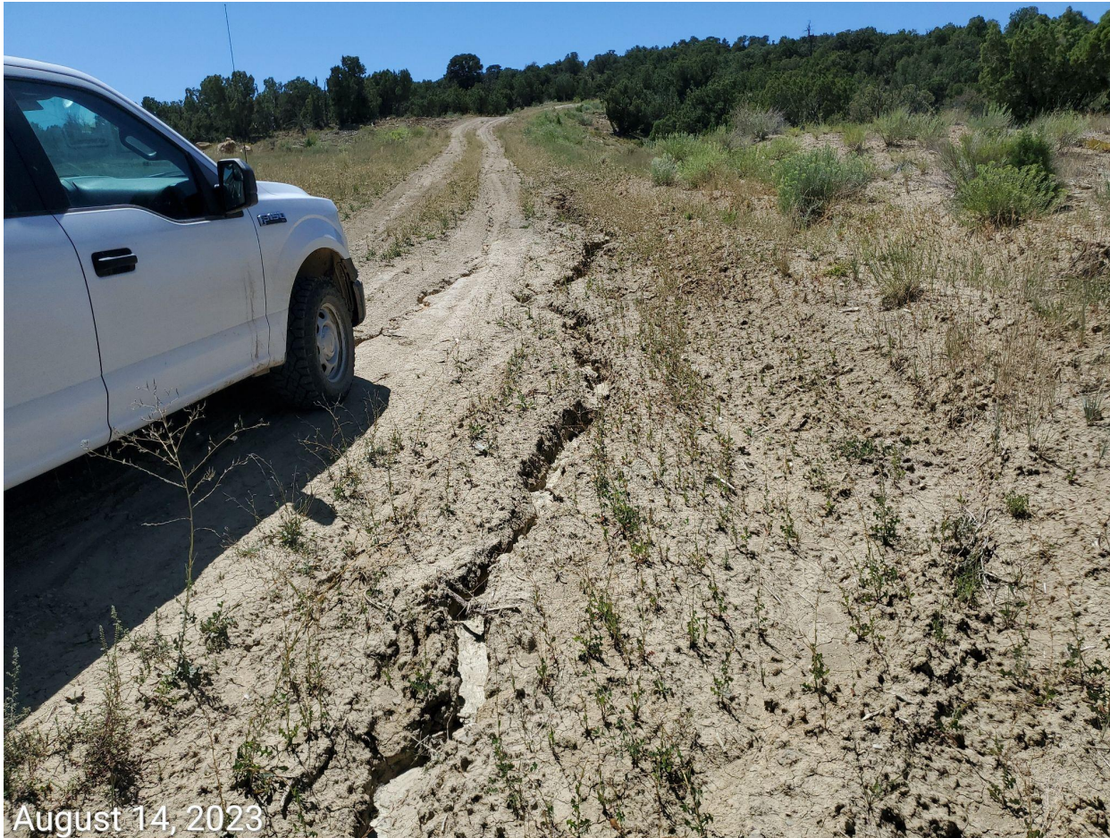
Photo 15: Photo shows erosion, degradation and sediment transport along the access road; stormwater and erosion control BMPs inadequate along access road.