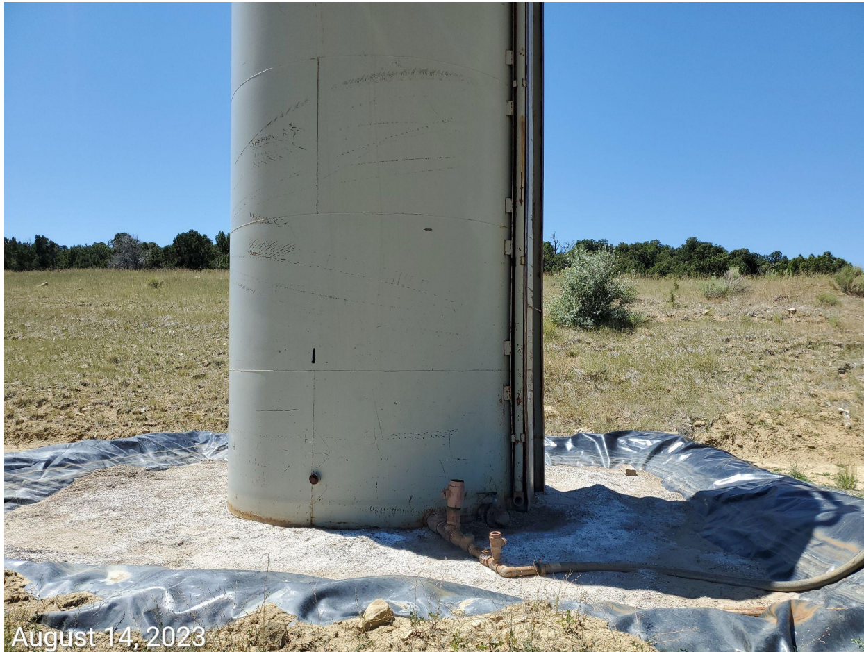
Photo 8: Photo shows signage at tank battery has not been posted in accordance with 605 Rules.