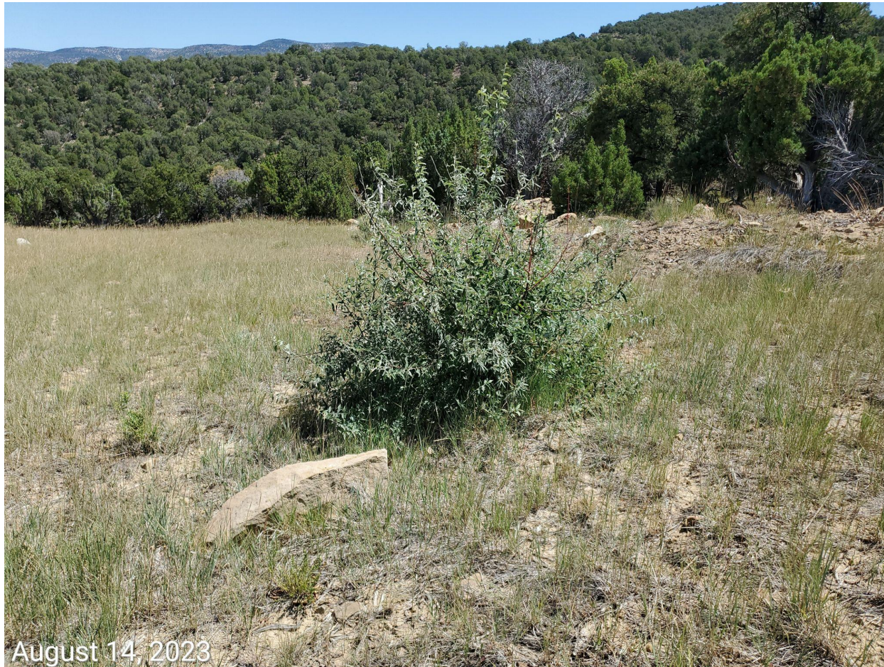
Photo 5: Photos show Undesirable and Noxious Plant Species (Russian Olive) established on the Location.