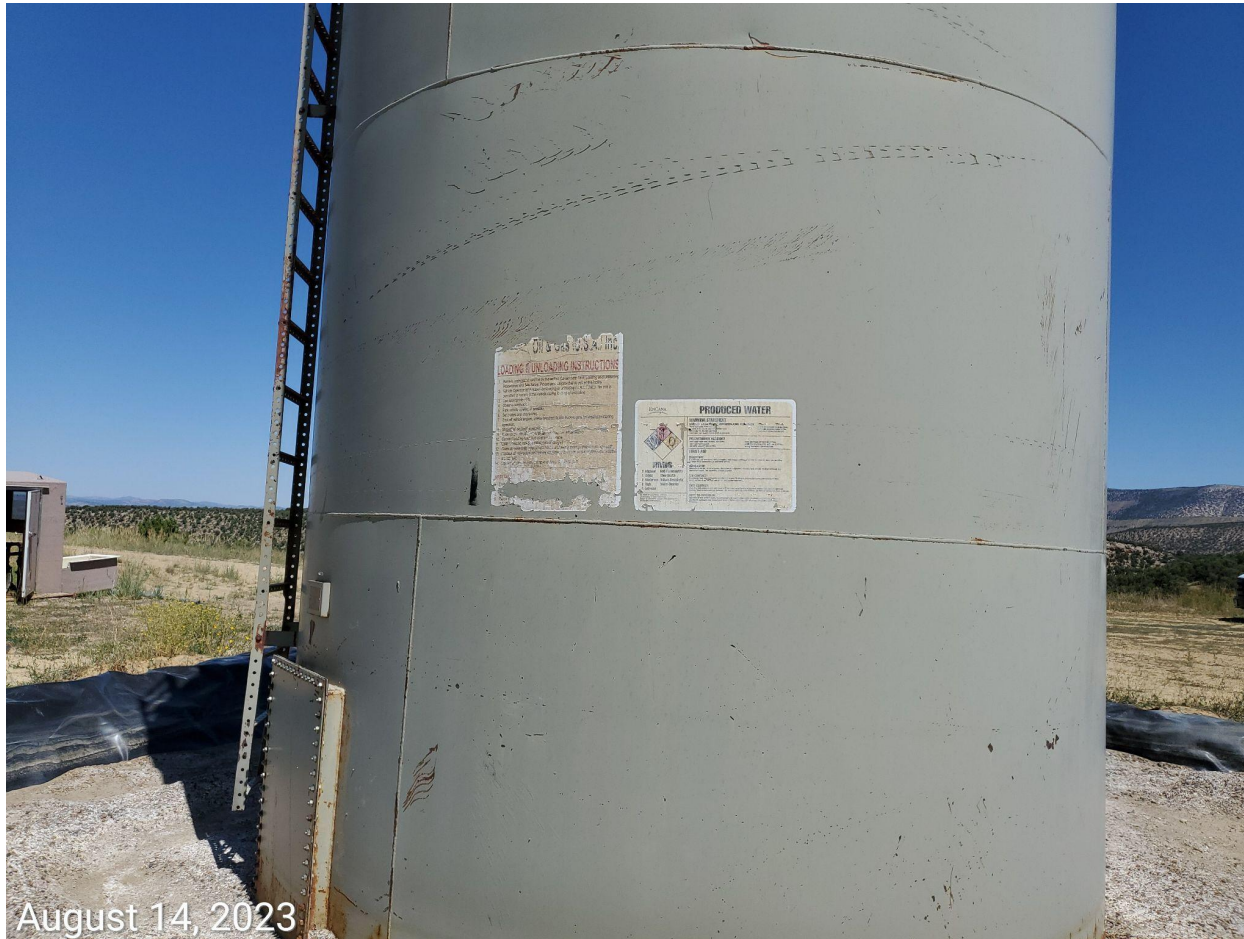
Photo 7: Photo shows Signage/Labels on tank does not comport with 605 Rules.