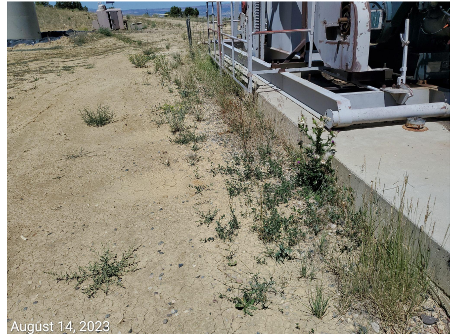
Photo 4: Photos show Undesirable and Noxious Plant Species (Russian thistle, Knotweed, Bull thistle) established on the Location, and around production equipment.