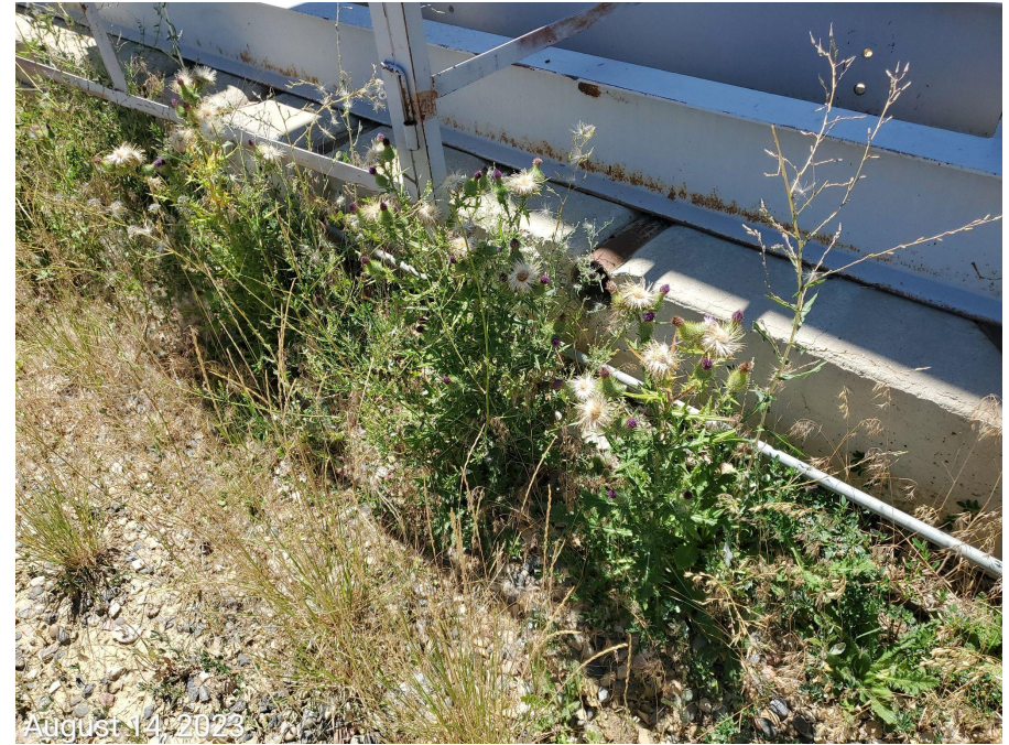
Photo 3: Photos show Undesirable and Noxious Plant Species (Knotweed, Bull thistle) established on the Location, and around production equipment.