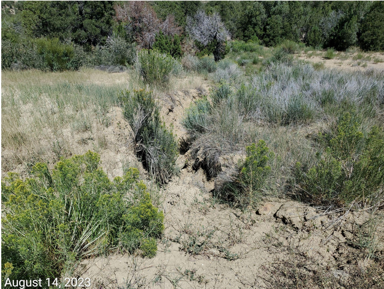
Photo 12: Photo shows erosion degradation on the northern interim areas of the Location, due to inadequate control measures to allow for proper stormwater discharge from the access road and location.