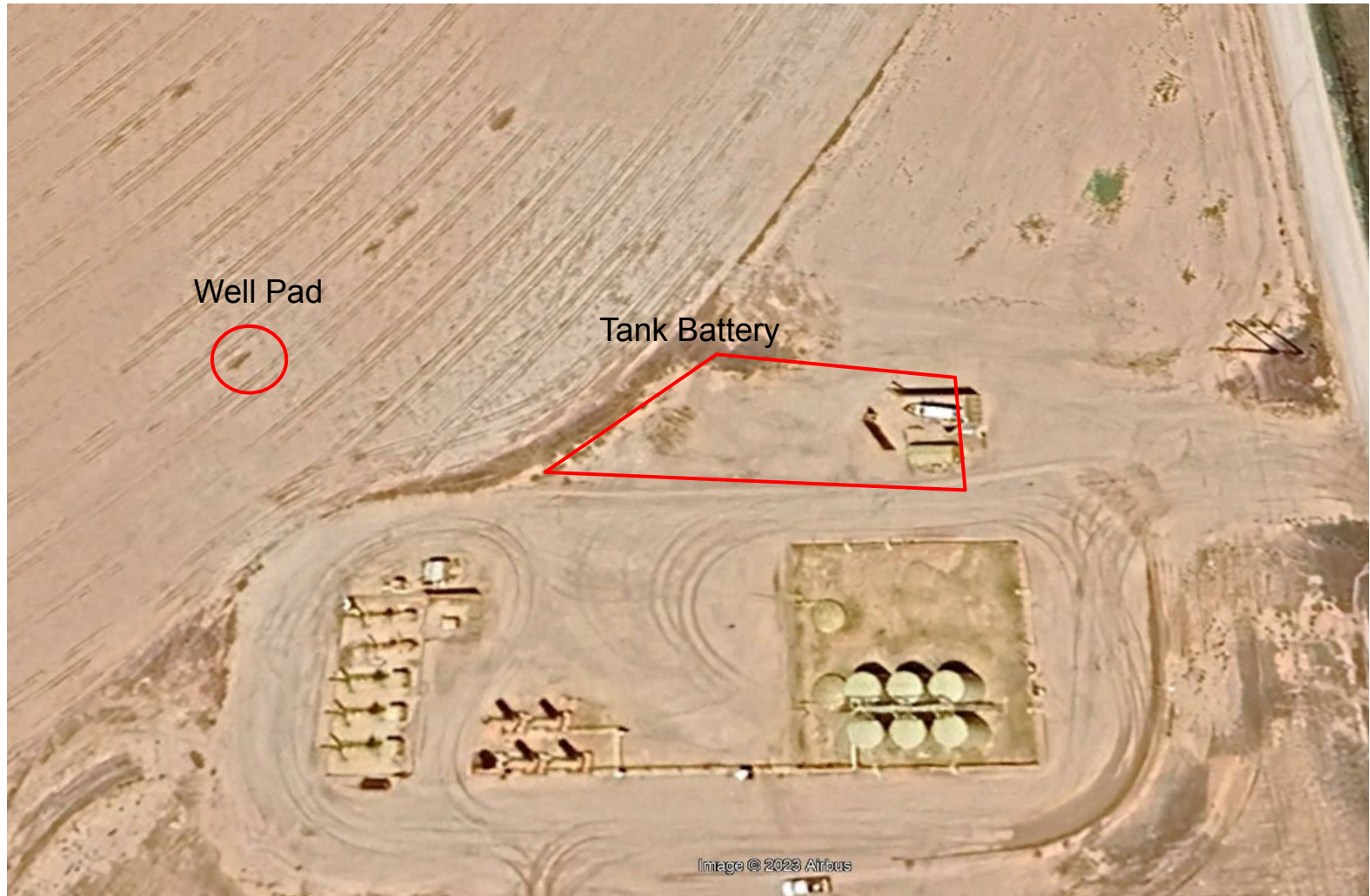
Photo 1. 2023 aerial imagery of the well pad and tank battery (north is up). Note: tank battery falls on the active Hunt Federal production facility, location ID 442636.