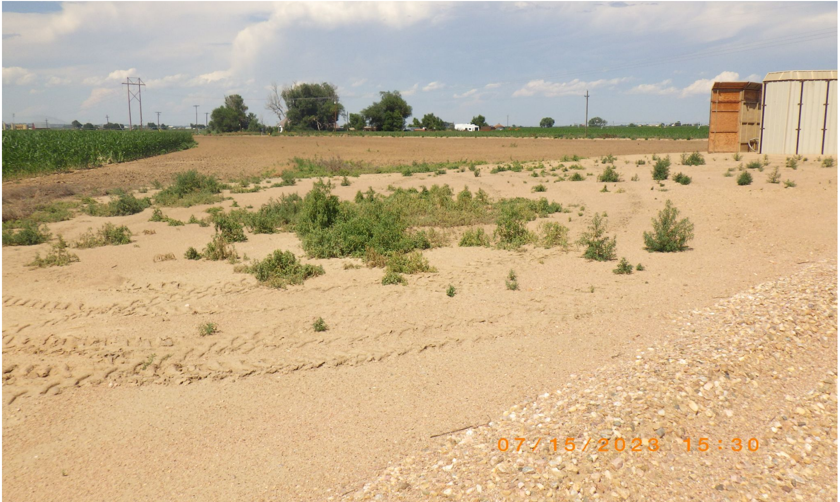
Photo 3. Overview photo of the tank battery taken at ground level from the southern edge facing north east.