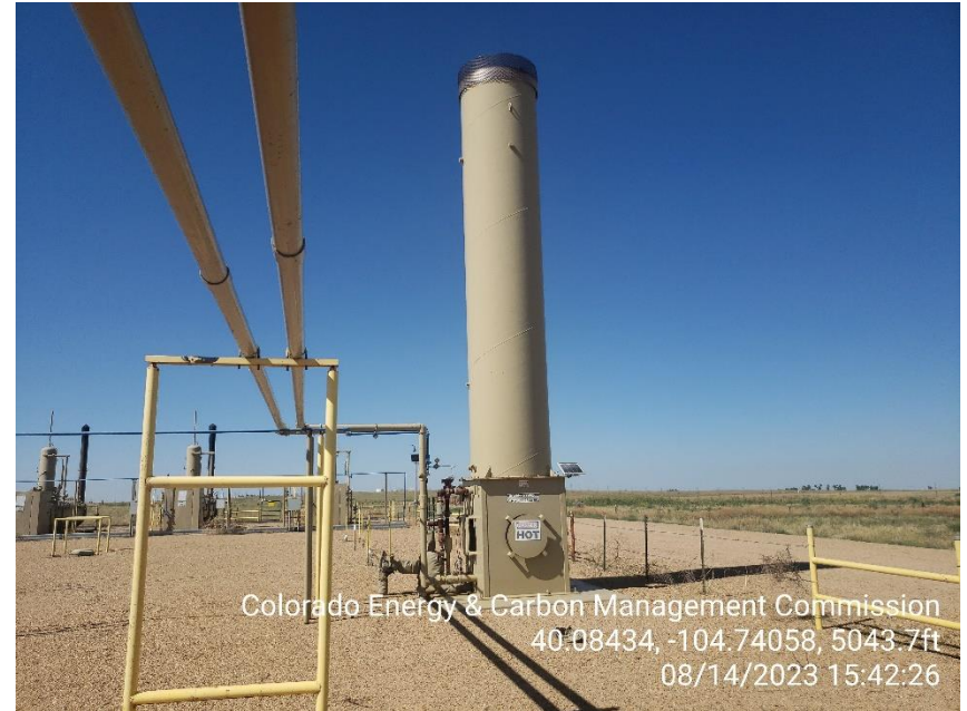
Photo 10 ECD.