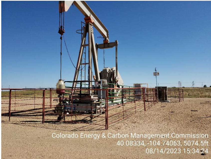
Photo 3 WH, sign and Pump Jack.