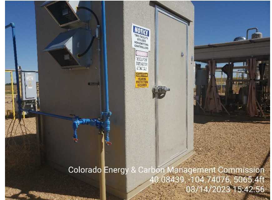
Photo 14 Compressor.