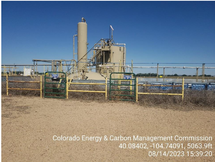
Photo 5 TB and signs covered in tumble weeds.