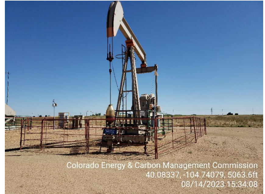
Photo 2 WH, sign and Pump Jack.