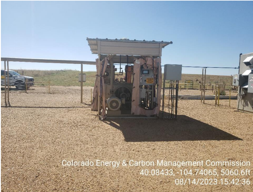
Photo 13 VRU.