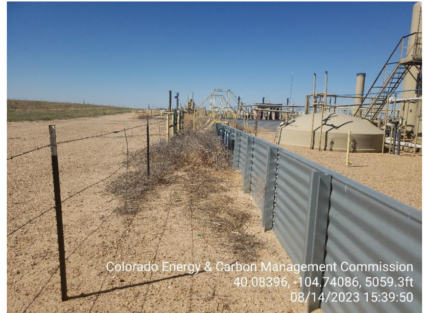
Photo 6 tumble weeds around TB berm.