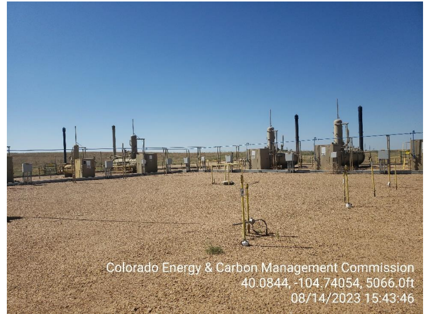
Photo 4 Horizontal heated Separators.