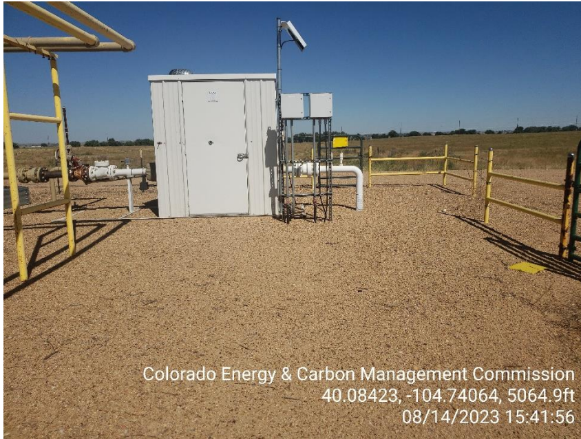
Photo 9 Gas Meter Run.