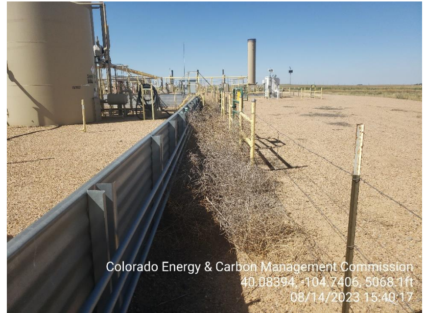
Photo 8 tumble weeds around TB berm.