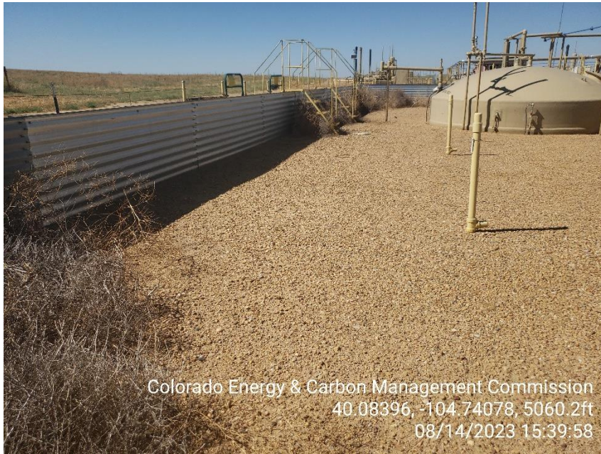
Photo 7 tumble weeds in TB berm.