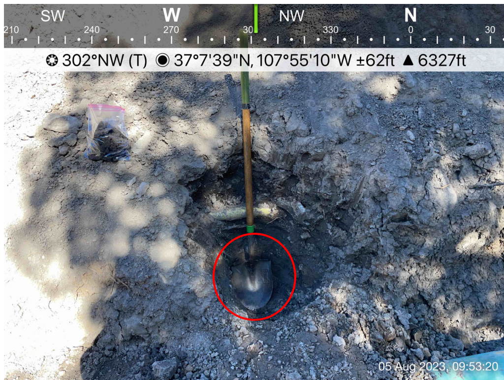
Photo 2: SS01 collected from wet area at point of release, 8/5/2023.