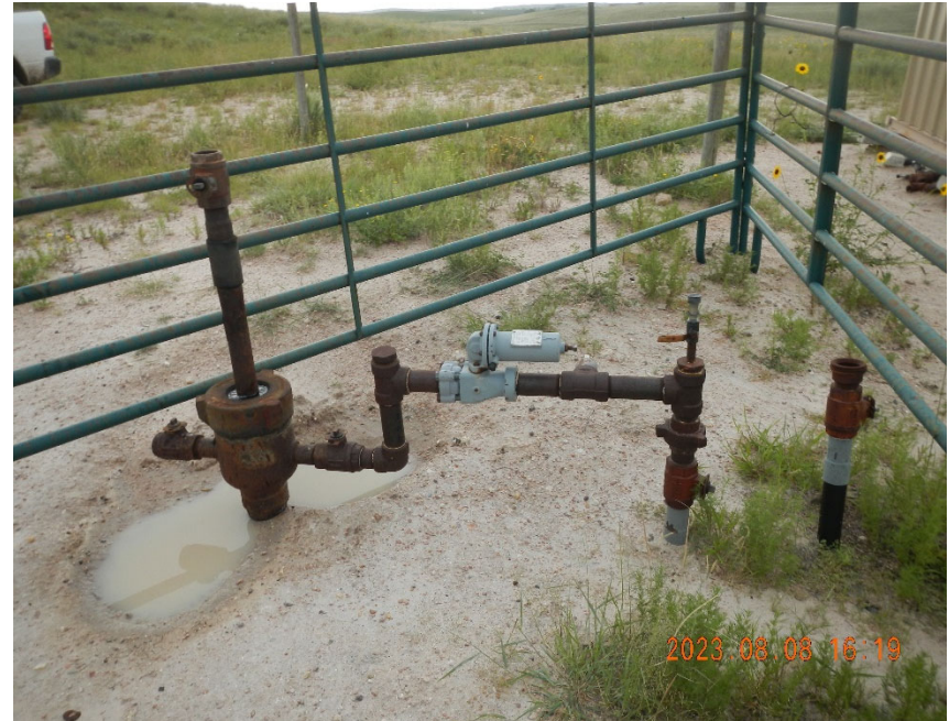
2. View of Wellhead. Note vegetation.