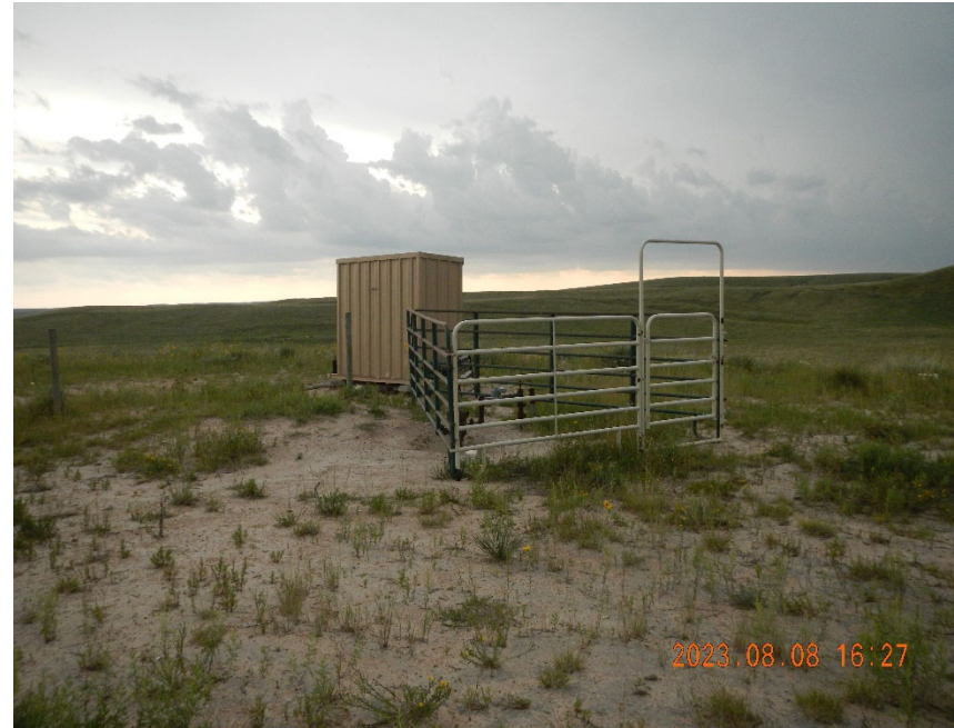
6. Location overview. Note vegetation.