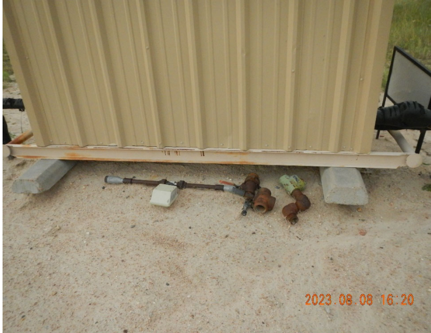
3. View of production related debris left at well site.