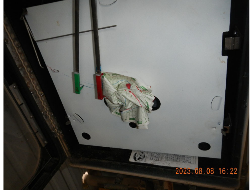
4. Twisted Chart found in Meter Box at time of inspection.