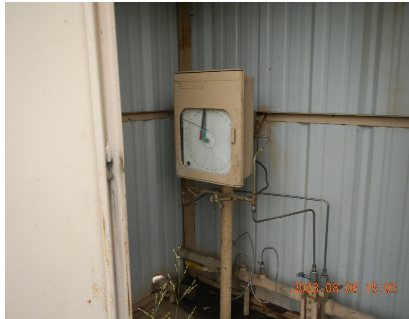
4. View of Gas Meter in Meter Shed.