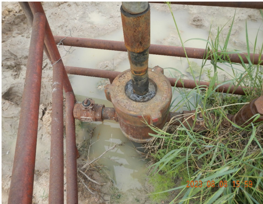
3. Additional view of Wellhead. Wellhead is leaking gas at cap and packing.