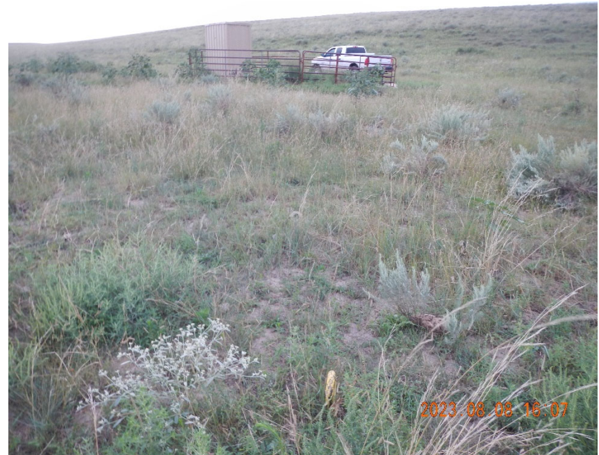
8. One of two unmarked Deadmen located by Inspector.