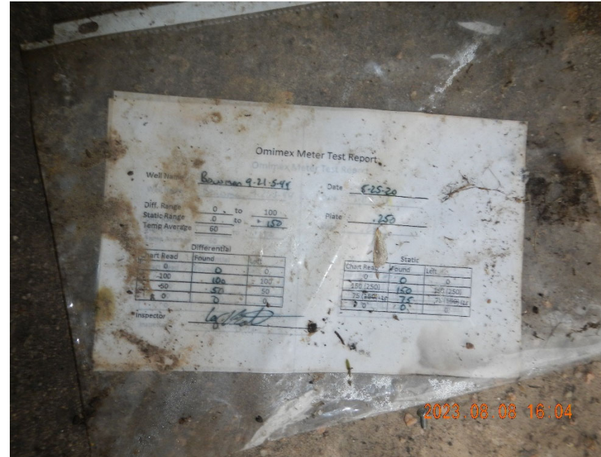
6. View of Meter Calibration/Test Log inside Meter Shed at time of inspection.