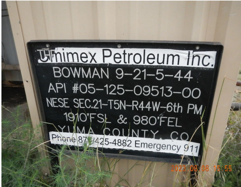
1. Well sign at well location.