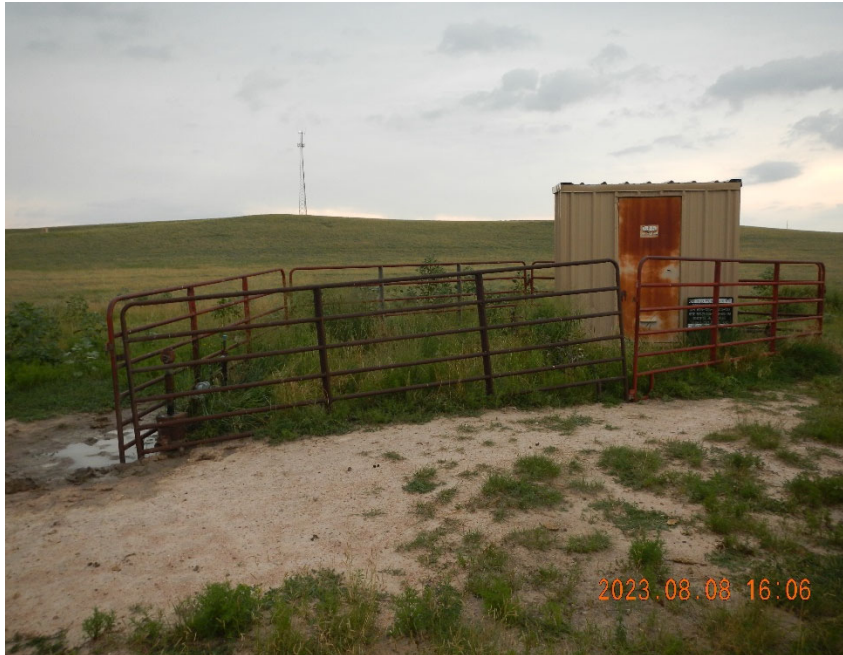
7. Location overview. Note vegetation.