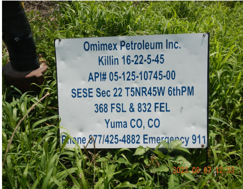
1. Well sign at well location.