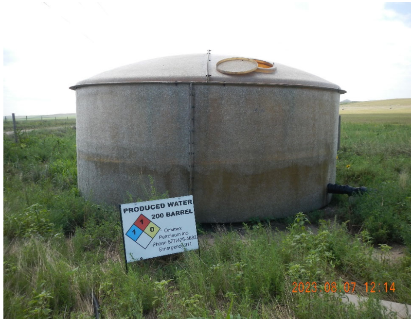
7. View of Produced Water Tank at remote Gas Meter Run. Note vegetation.