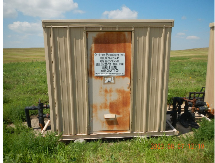
4. Remote Meter Shed. Note vegetation.