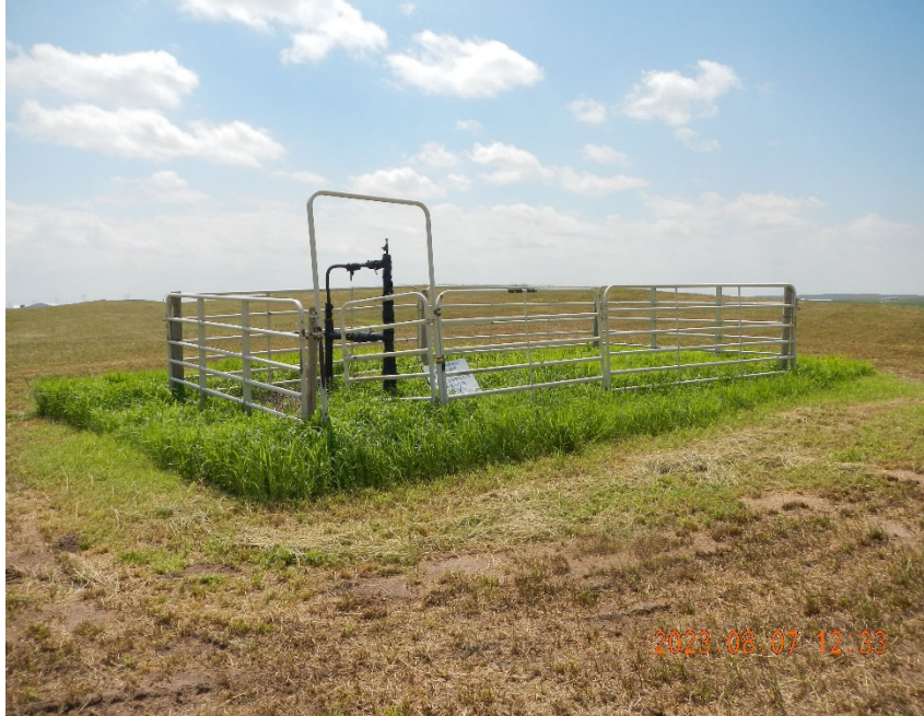
3. Well location overview. Note vegetation.