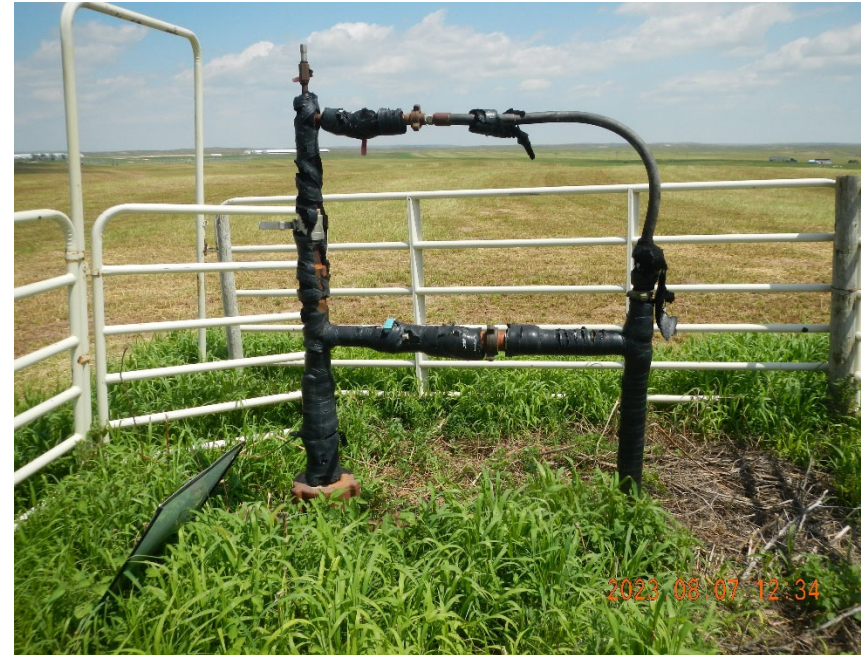
2. View of Wellhead. Note vegetation.