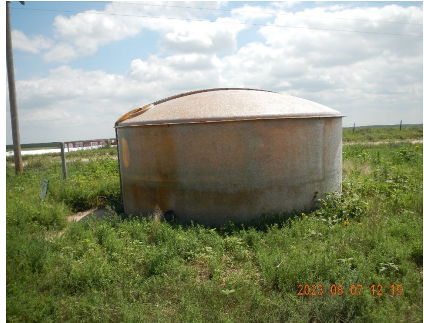
8. Additional view of Produced Water Tank. Note vegetation.