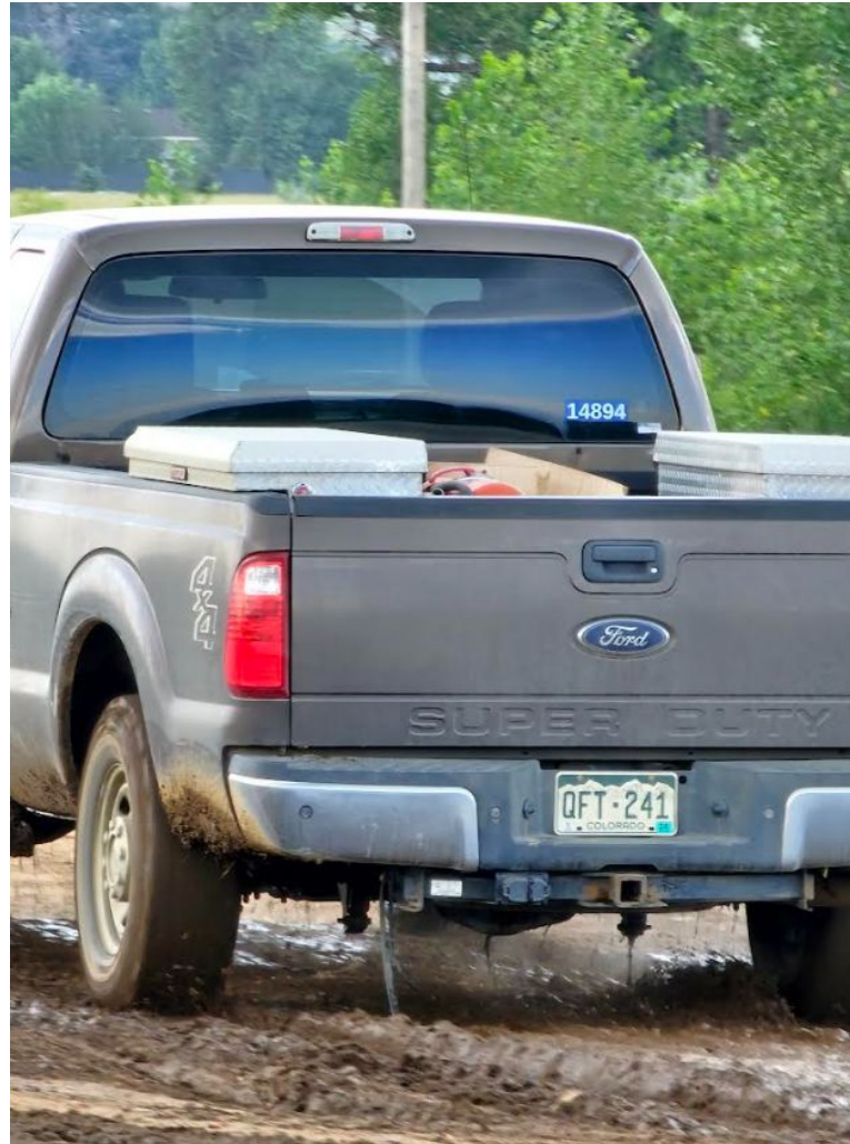
Photo 4. Photo taken on August 7, 2023 by the surface owner illustrating an Operator representative traveling on the private road along the western lake.