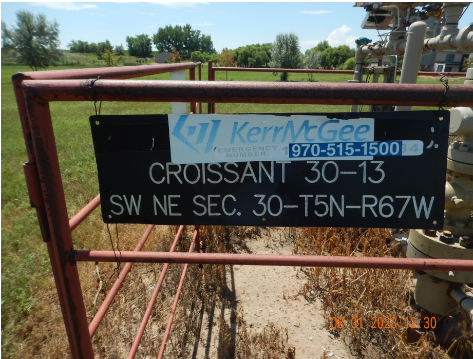
Photo 1. Photo taken from the wellhead, facing South. Photo illustrates Operator sign.