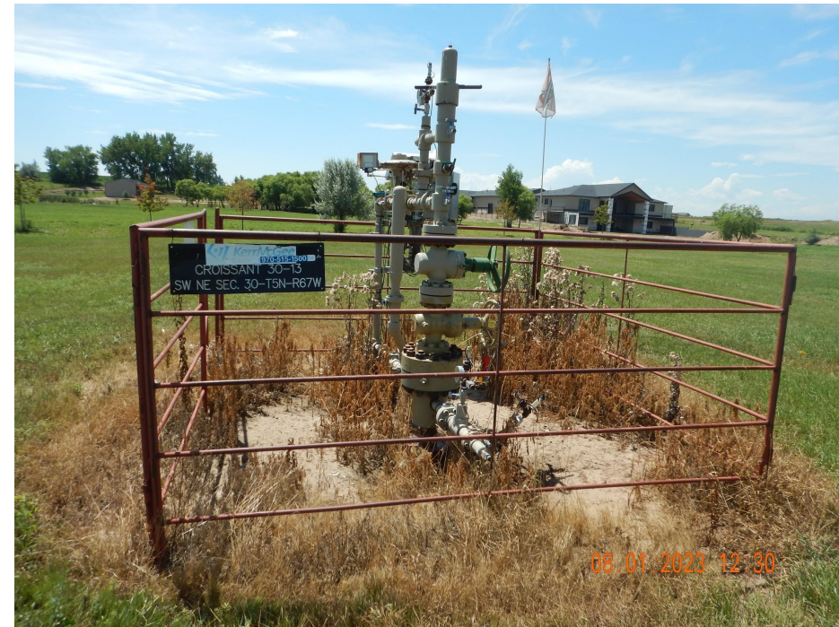
Photo 2. Photo illustrates unmanaged weeds, which include a List B Colorado Noxious weed, Canada thistle.