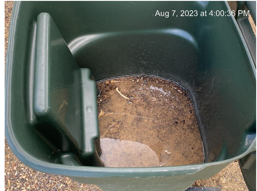
Open to wildlife