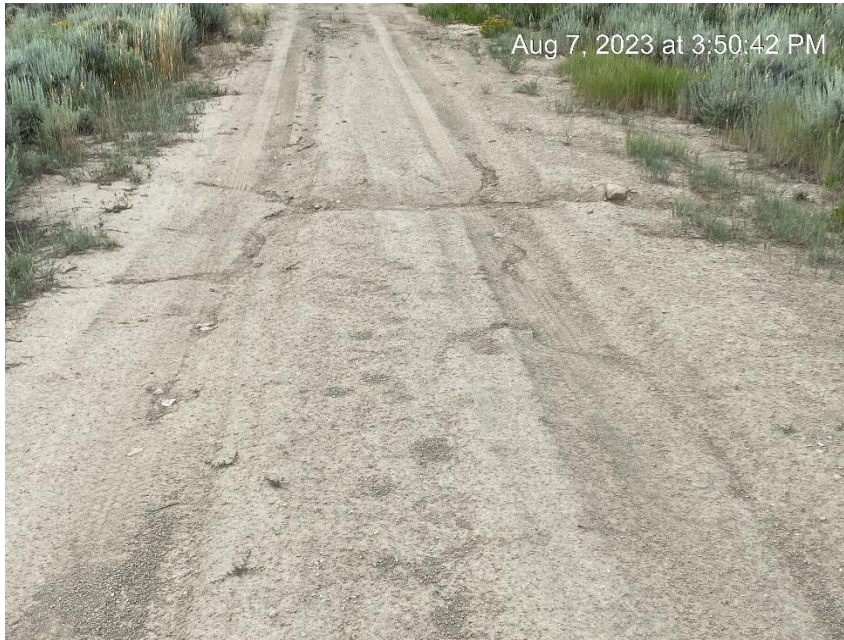
Access road to location