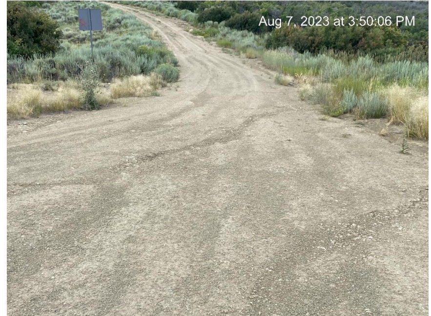
Access road in to location