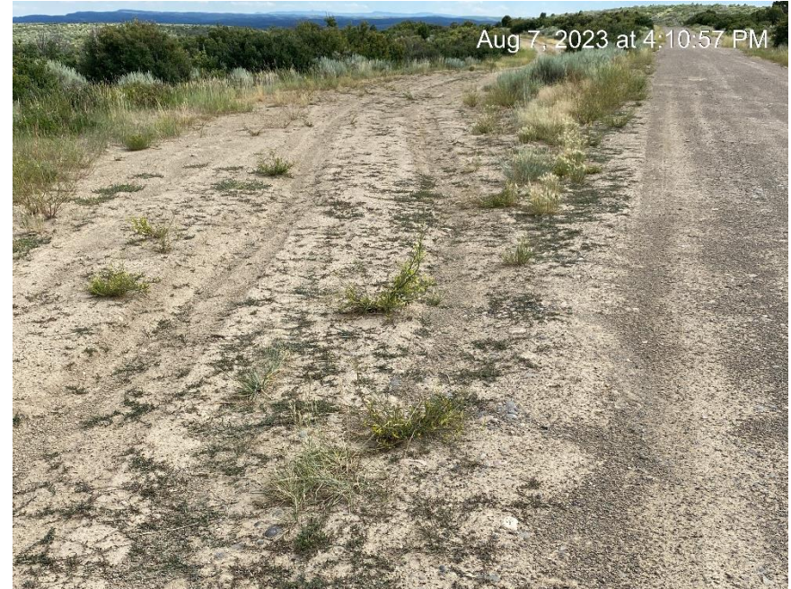
Access road off County Road 3