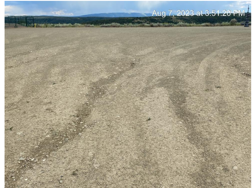
Entrance to location