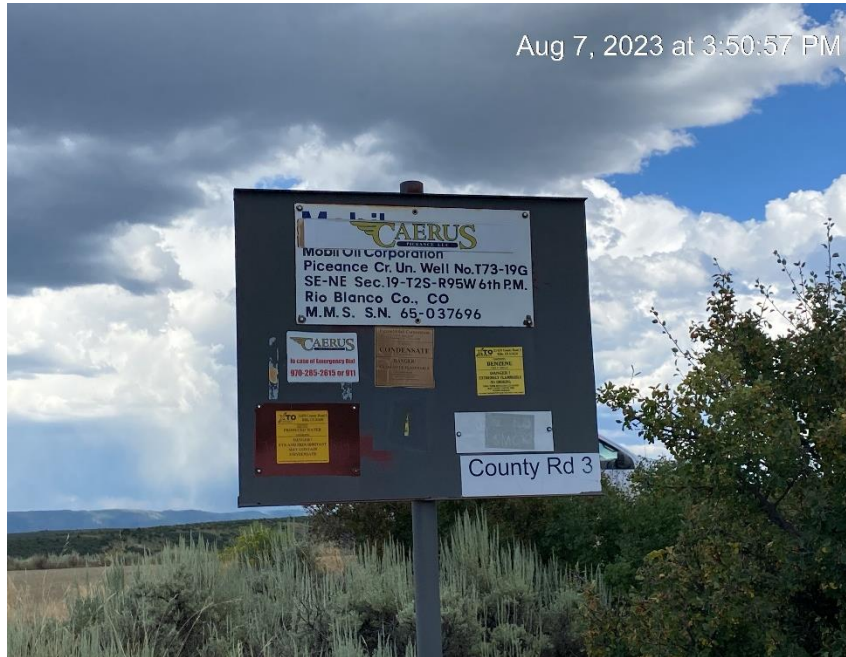
Additional information required on sign if replaced