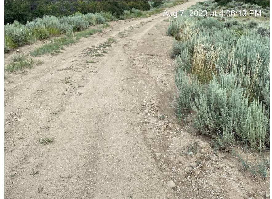
Access road to location