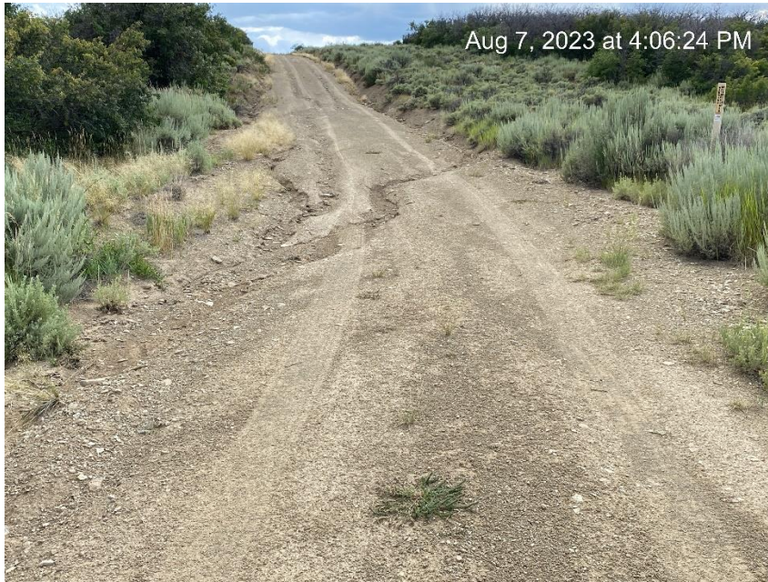
Access road to location