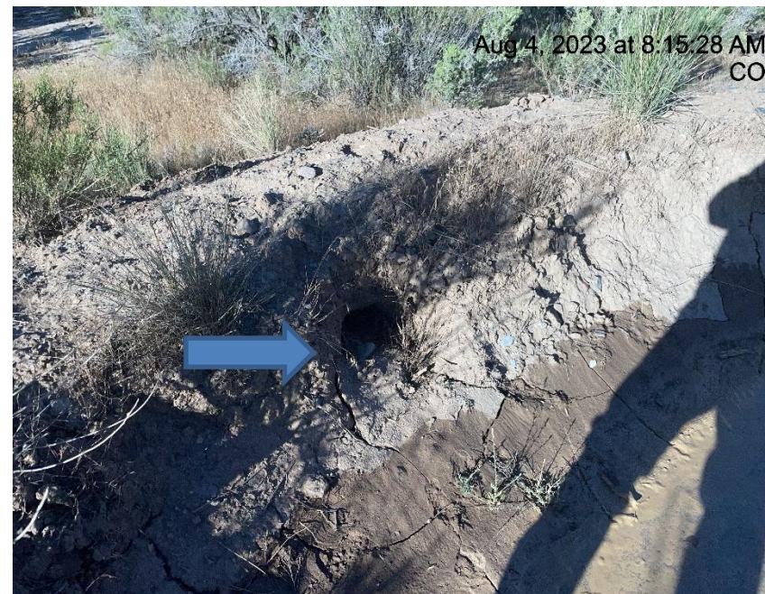
Photo # 4549 Sediment trap needs maintenance/tunnel erosion (S/SW area of location down from the check dams)