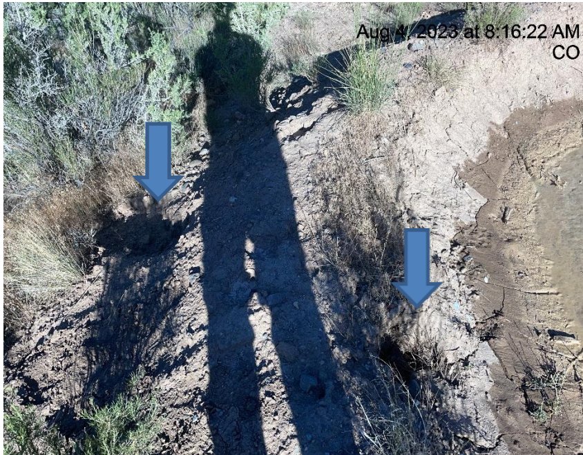
Photo # 4550 Sediment trap needs maintenance/tunnel erosion (S/SW area of location down from the check dams)