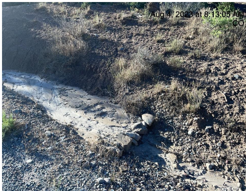
Photo # 4546 Check dam needs maintenance (S/SE area of location & road)