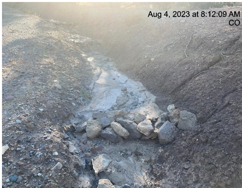
Photo # 4544 Check dam needs maintenance (S/SE area of location & road)