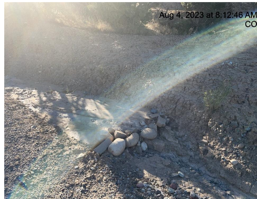
Photo # 4545 Check dam needs maintenance (S/SE area of location & road)