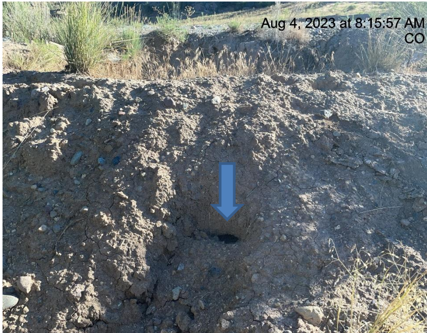
Photo # 4550 Sediment trap needs maintenance/tunnel erosion (S/SW area of location down from the check dams)