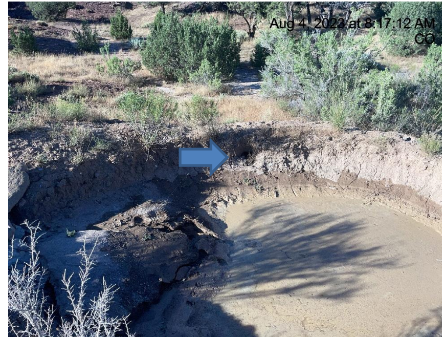
Photo # 4552 Sediment trap needs maintenance/tunnel erosion (S/SW area of location down from the check dams)