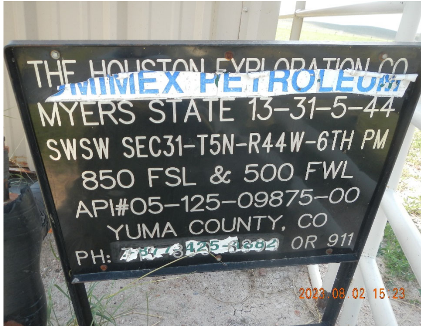
1. Well sign at well location.