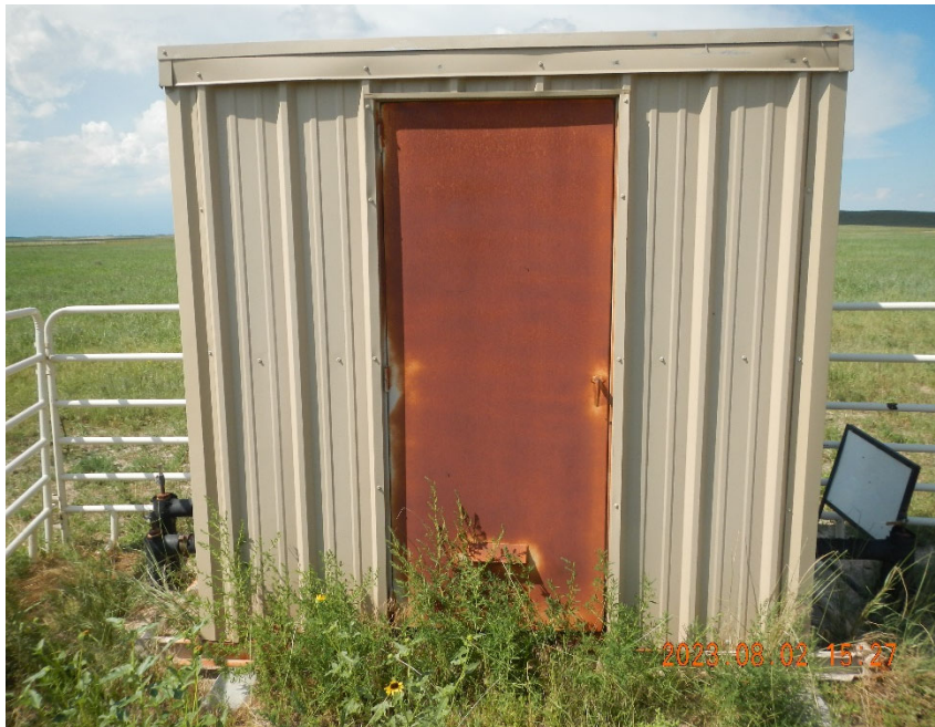
3. Gas Meter Shed. Note vegetation.