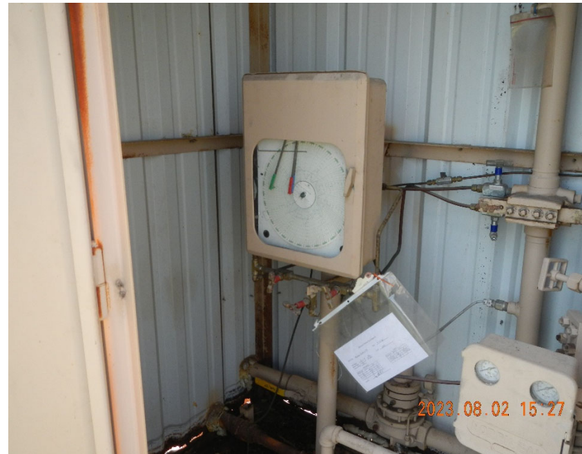
4. Gas Meter inside Meter Shed.