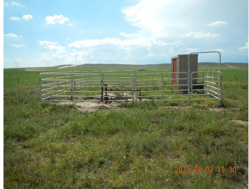
8. Location overview.