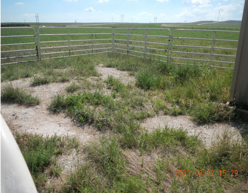
7. Vegetation growth inside well location fencing.