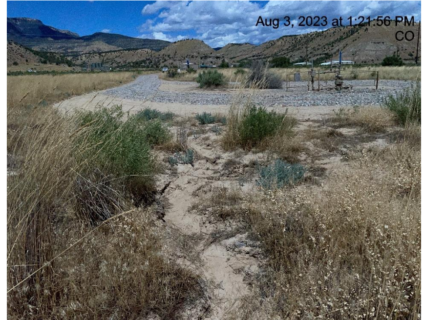
Photo # 4449 Erosion & transport of sediment off location & into a vegetated area (S/SW edge of pad near wellhead)