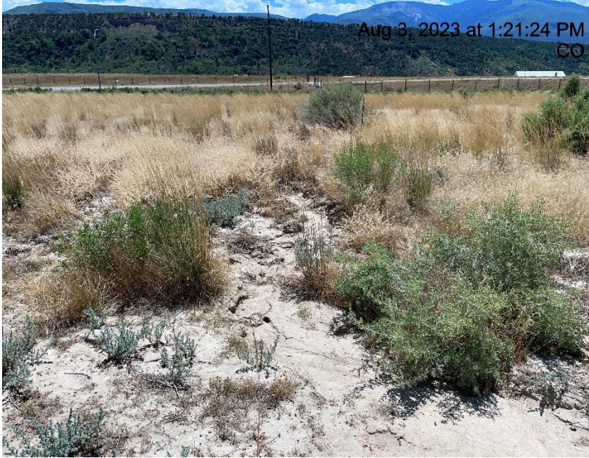
Photo # 4446 Erosion & transport of sediment off location & into a vegetated area (S/SW edge of pad near wellhead)