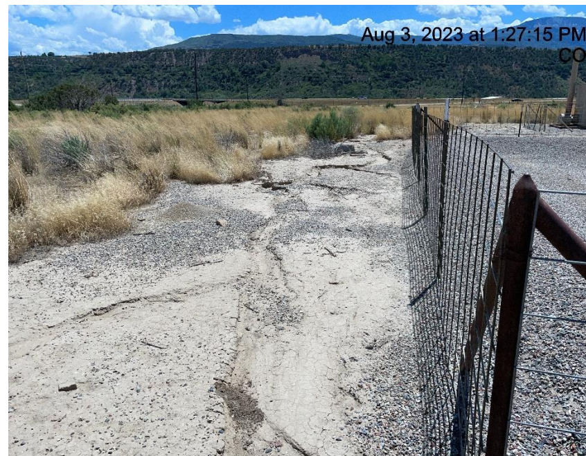
Photo # 4464 Erosion & transport of sediment off location & into a vegetated area (E/NE area of pad behind tank battery containment)