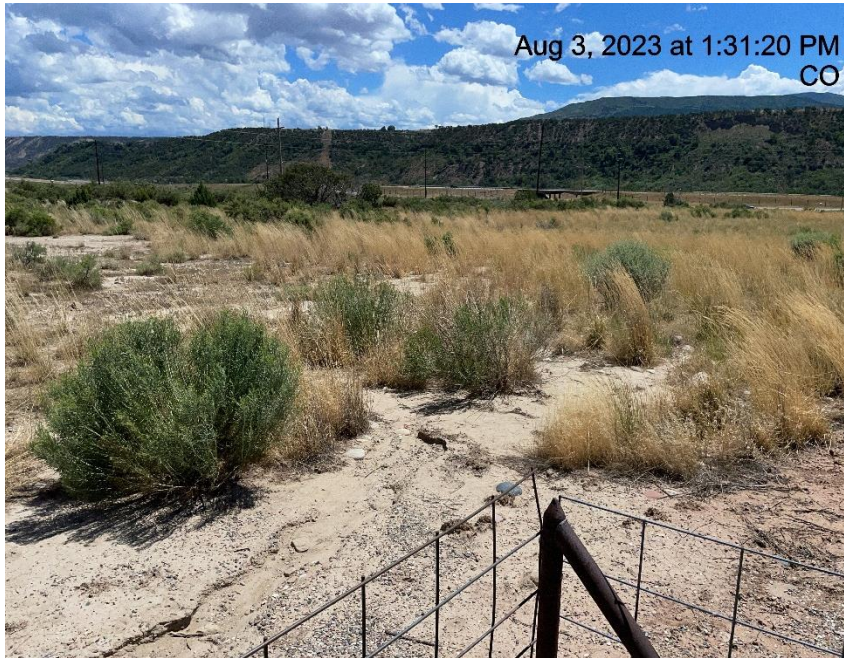
Photo # 4480 Erosion & transport of sediment off location & into a vegetated area (E/NE area of pad behind tank battery containment)