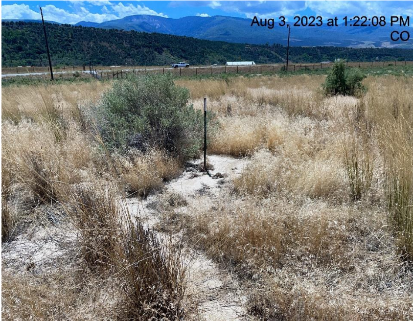
Photo # 4448 Erosion & transport of sediment off location & into a vegetated area (S/SW edge of pad near wellhead)