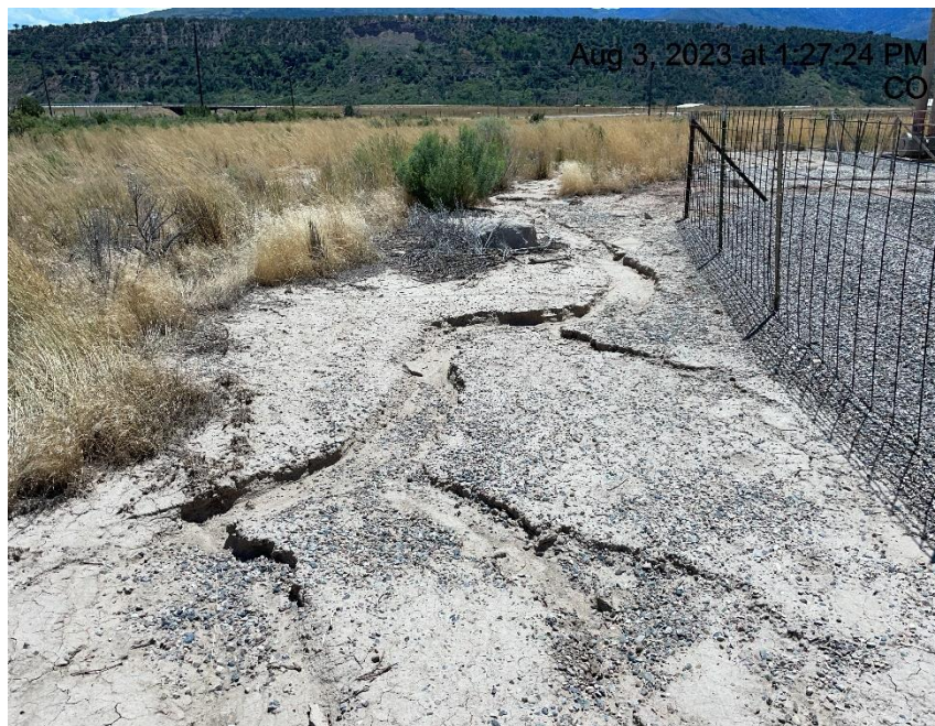
Photo # 4465 Erosion & transport of sediment off location & into a vegetated area (E/NE area of pad behind tank battery containment)