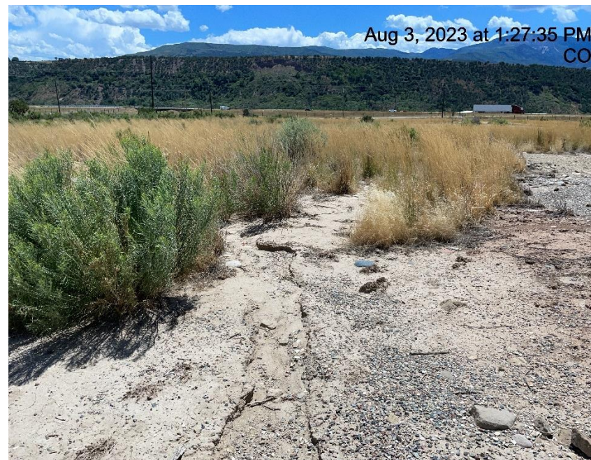
Photo # 4466 Erosion & transport of sediment off location & into a vegetated area (E/NE area of pad behind tank battery containment)