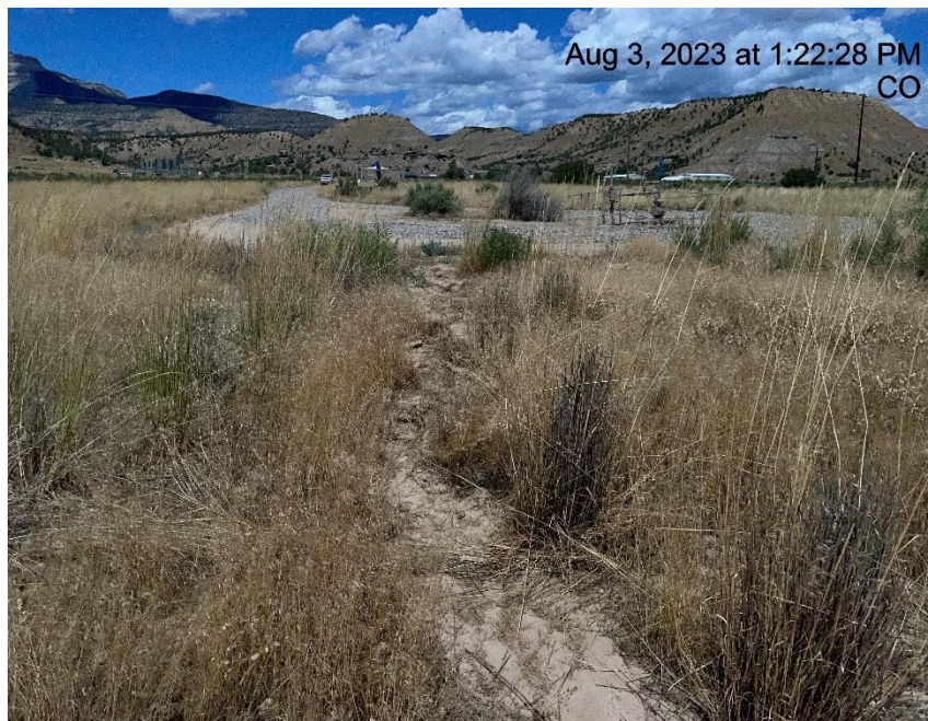
Photo # 4450 Erosion & transport of sediment off location & into a vegetated area (S/SW edge of pad near wellhead)