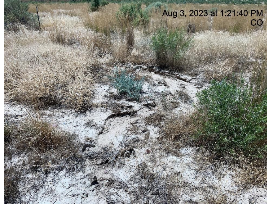
Photo # 4447 Erosion & transport of sediment off location & into a vegetated area (S/SW edge of pad near wellhead)