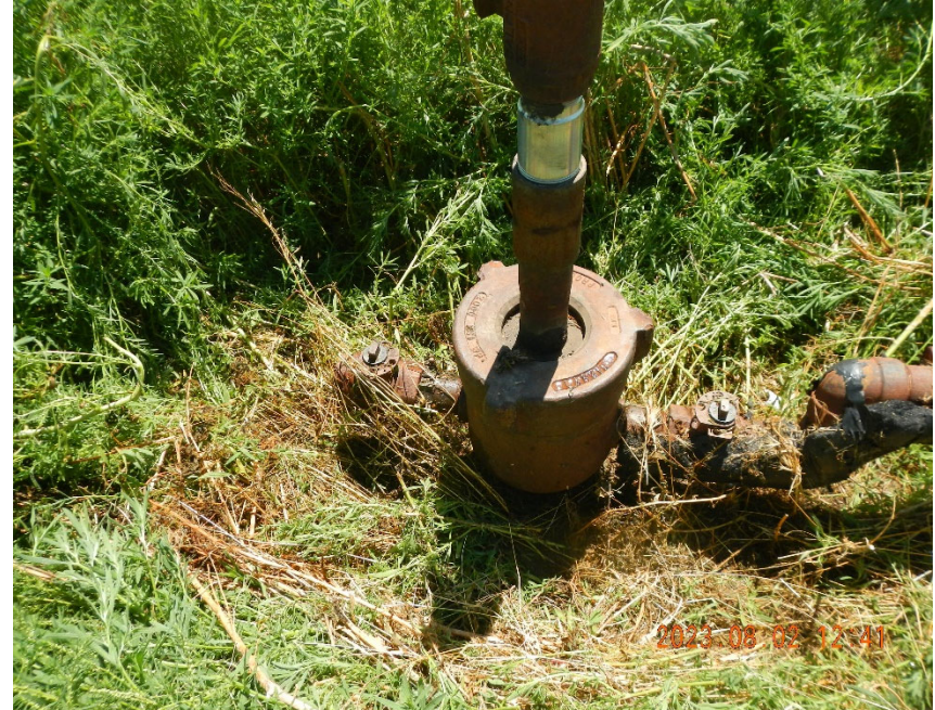
2. View of wellhead.