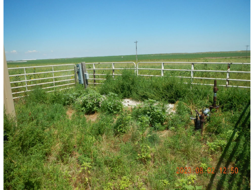
8. Vegetation growing inside the stock panel fencing.