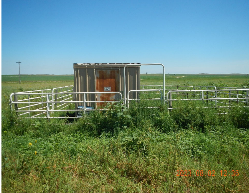
7. Location overview.