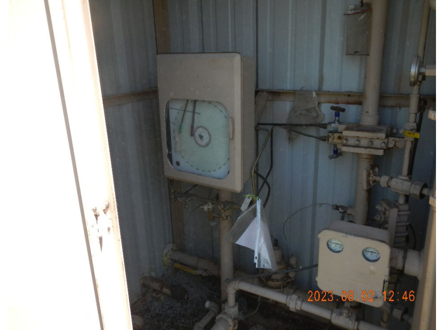
4. View of Gas Meter inside Meter Shed.