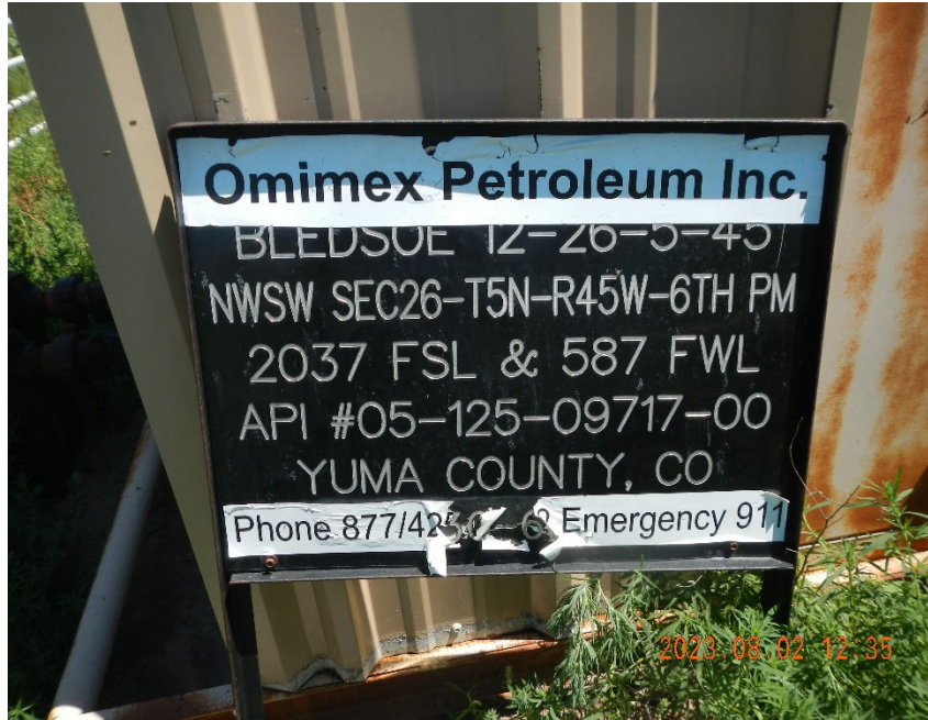
1. Sign at well location.