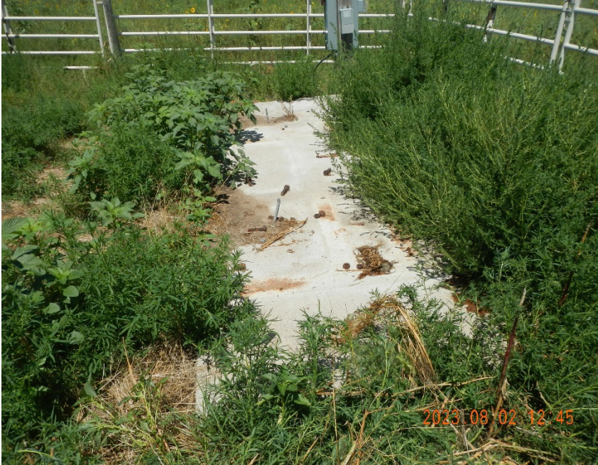
3. Concrete Pad and production related debris. Note vegetation growth.