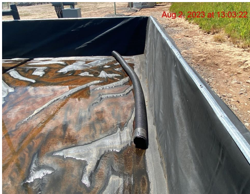
Stored Equipment/Supplies – Photo #05404