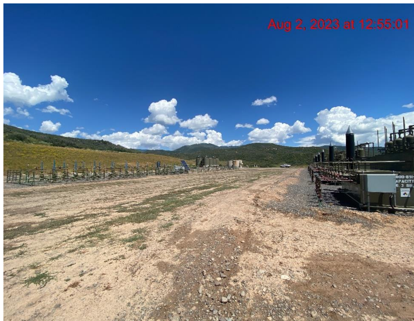
SW Corner of Location – Photo #05393