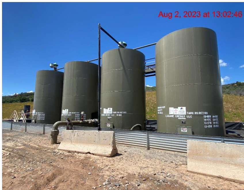
Tank Battery – Photo #05403