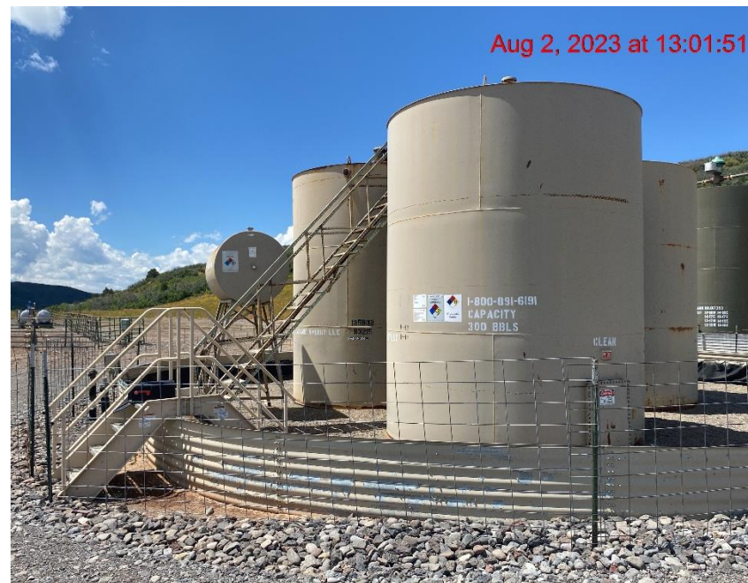
Tank Battery – Photo #05402