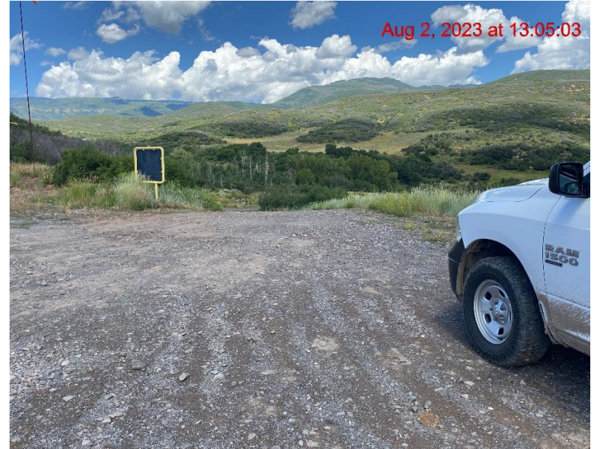
Insufficient Vehicle Tracking BMPs at Location Entrance/Exit – Photo #05408