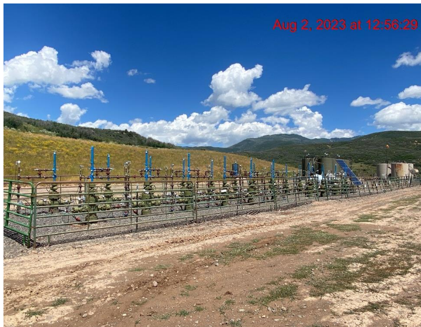
Wellheads – Photo #05396