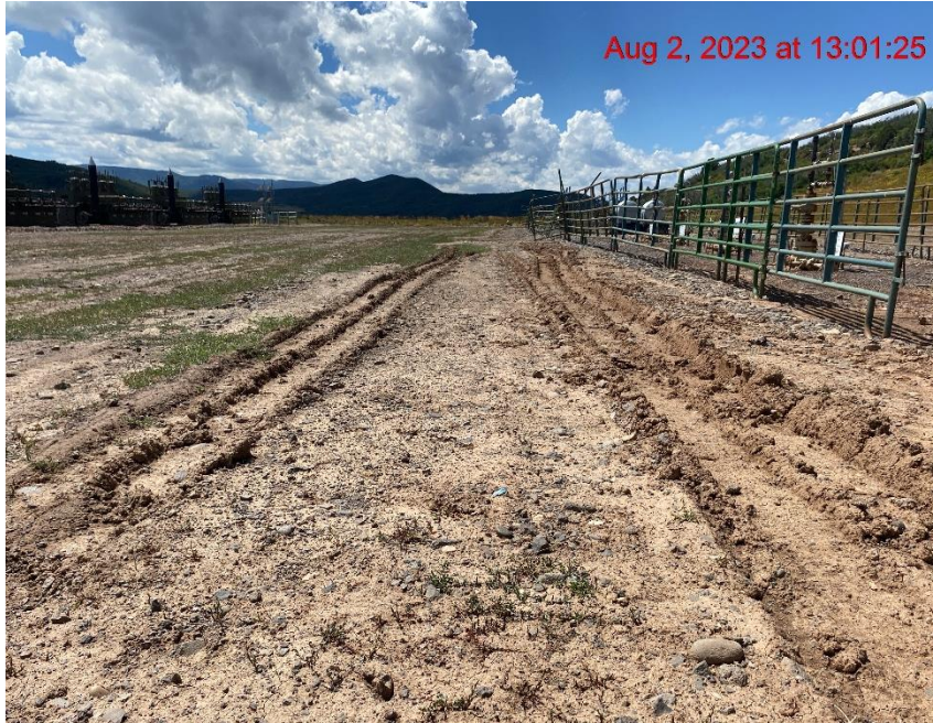
Location Lacks Stabilization – Photo #05401