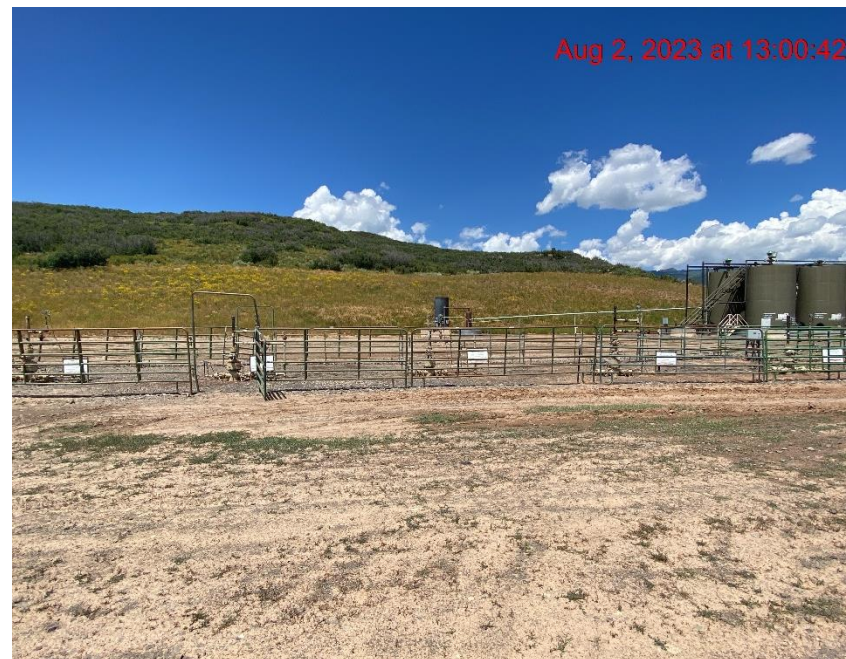
Wellheads – Photo #05399