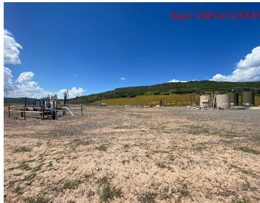
SE Corner of Location – Photo #05392