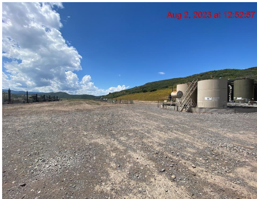
NE Corner of Location – Photo #05390