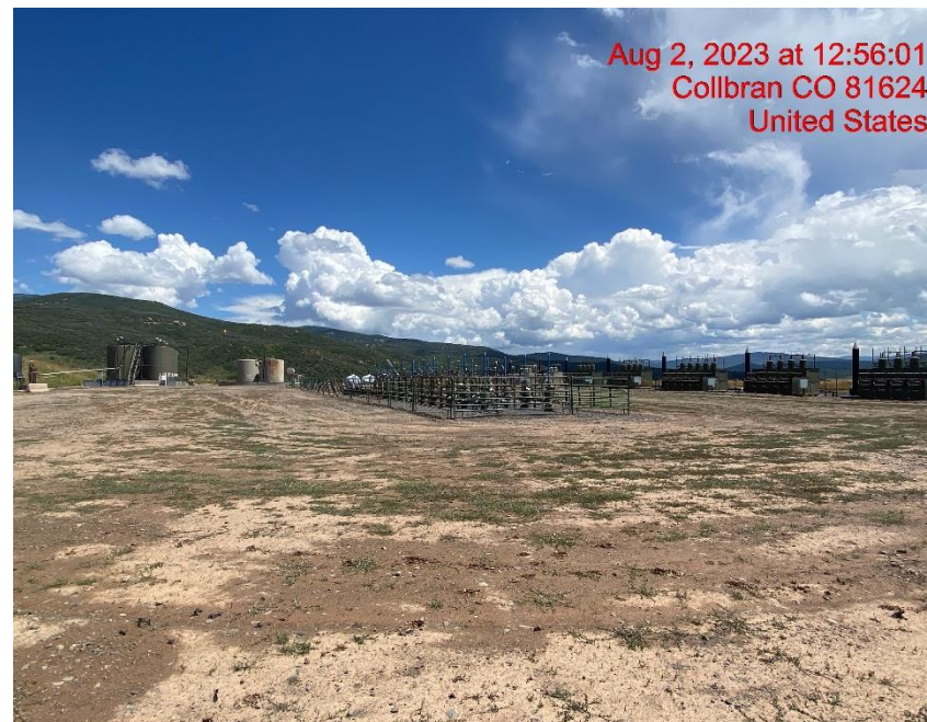
NW Corner of Location – Photo #05395