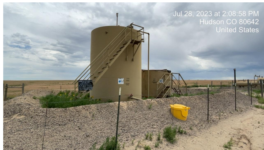
Photo 2. Photo of tank battery