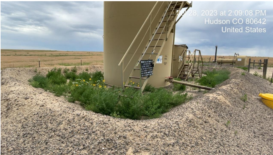
Photo 3. Photo taken of weeds on site