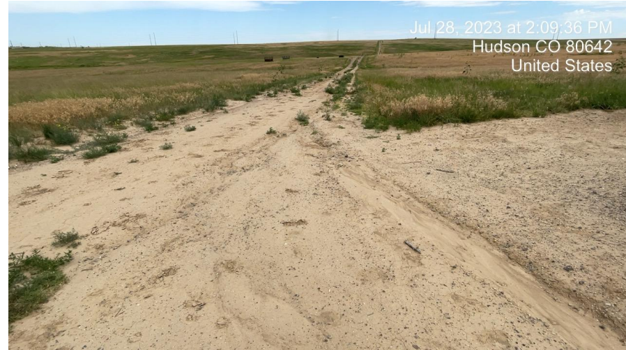
Photo 4. Photo of stormwater erosion on site