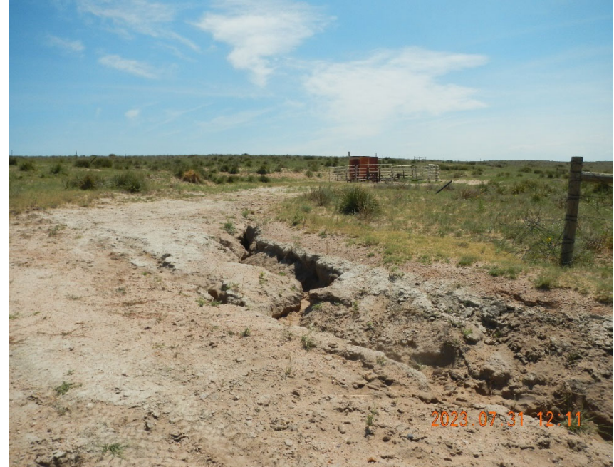
10. Access road erosion gully.