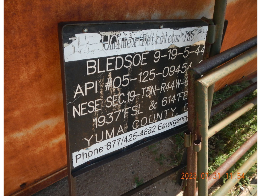
2. Well sign.