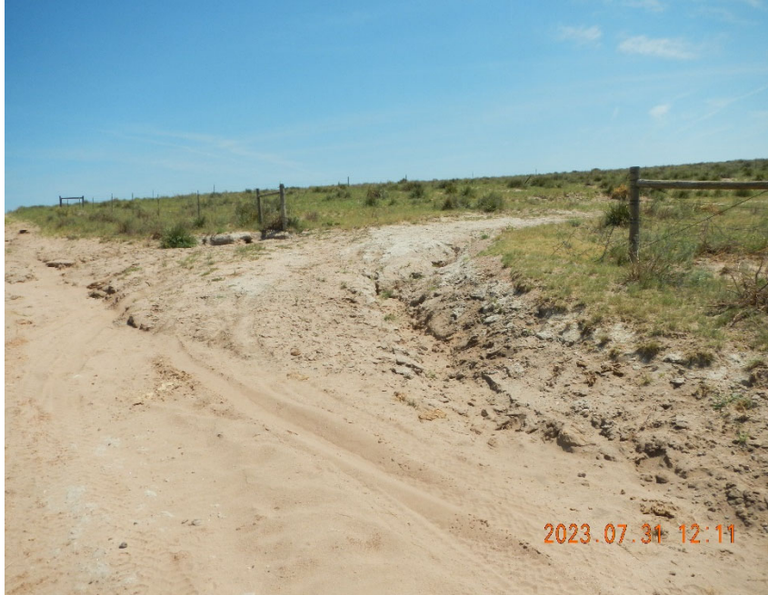
9. Access road at entrance to location.