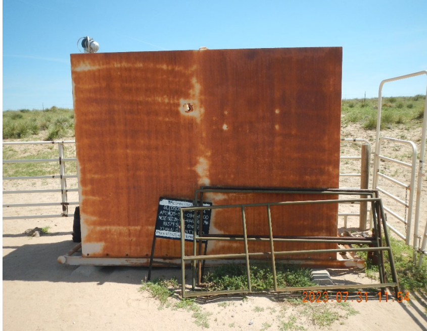
1. Well sign leaned against meter shed.