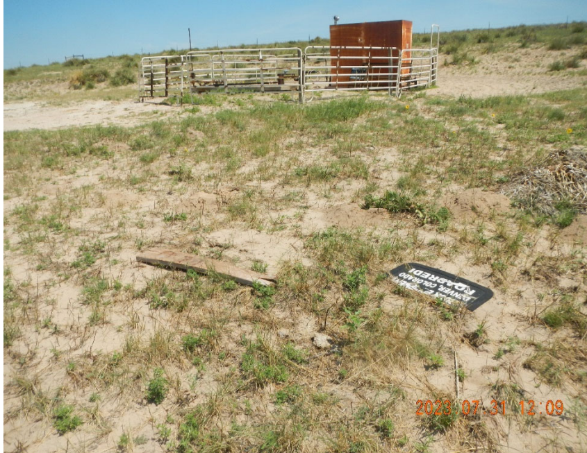
7. Location overview. Note debris onsite.