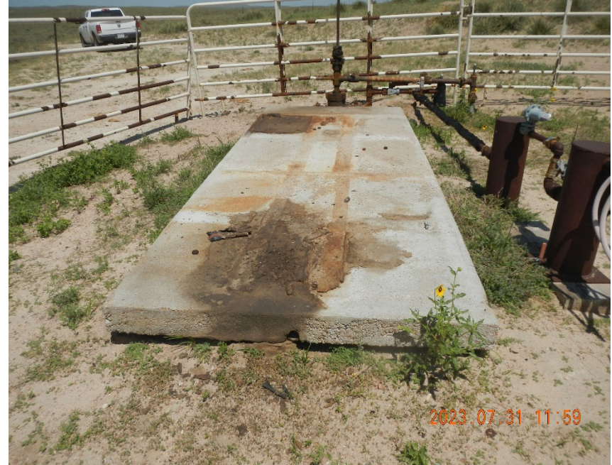
4. Concrete pad with accumulated lube oil on pad and surrounding soils.