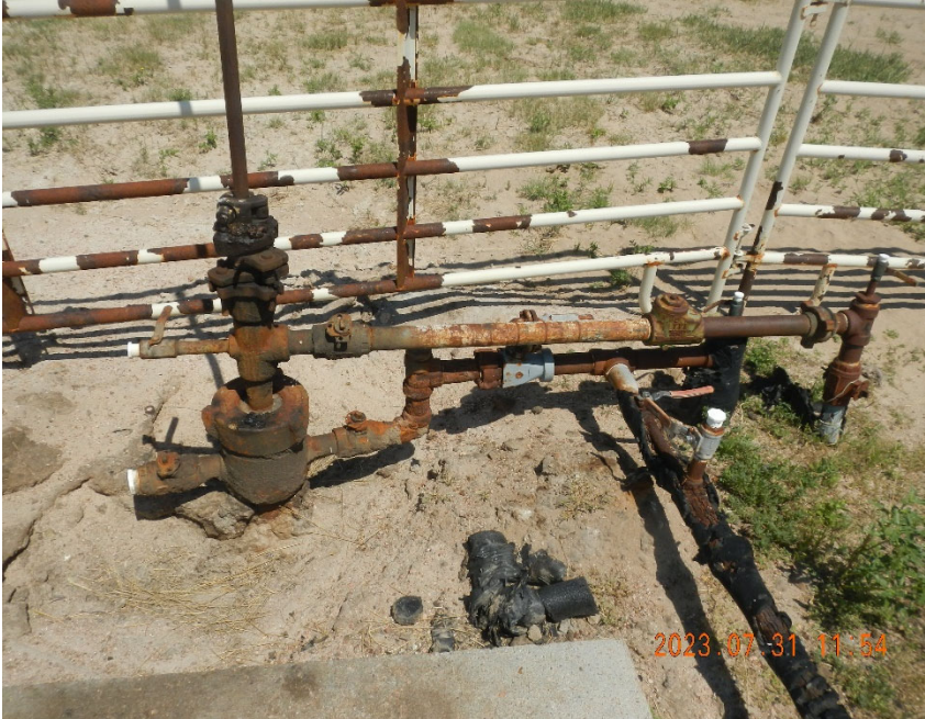
3. View of wellhead. Note debris and stained soils at well.