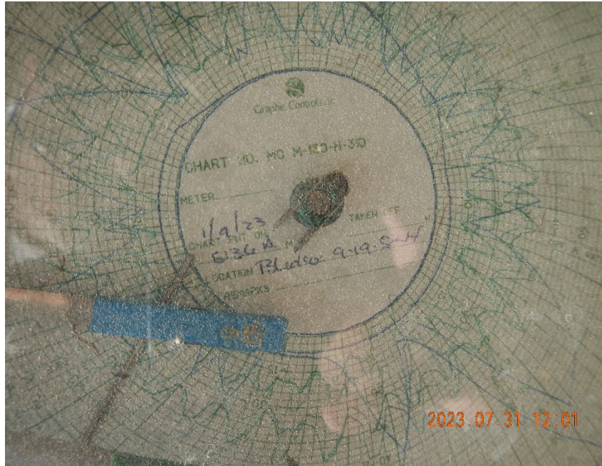
5. Chart in Meter Box at time of inspection.