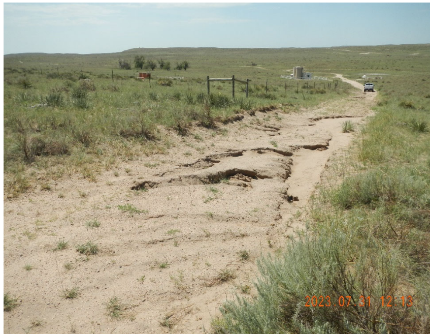
11. Access road.