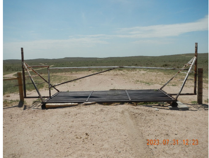
8. Cattle guard at access entrance. Roadside is washing down slope.