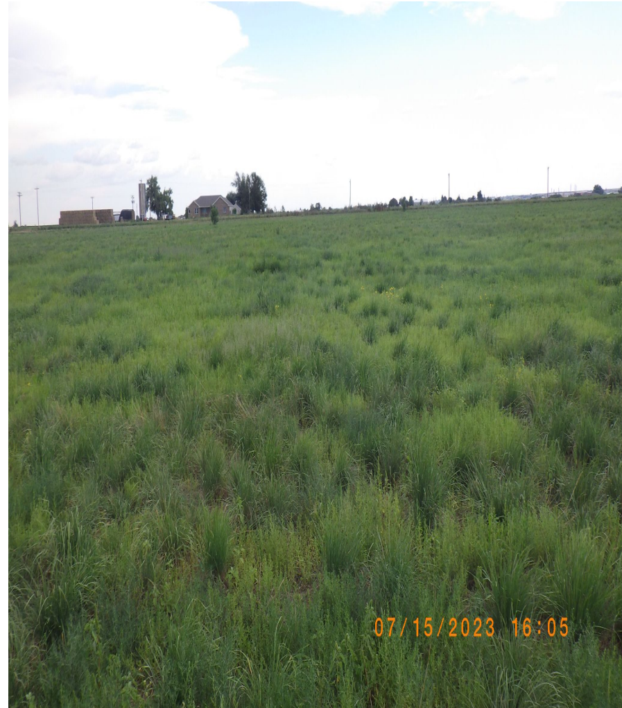
Photo 3. Cardinal photos taken from the middle of the well pad. Left photo facing north, right photo facing east.