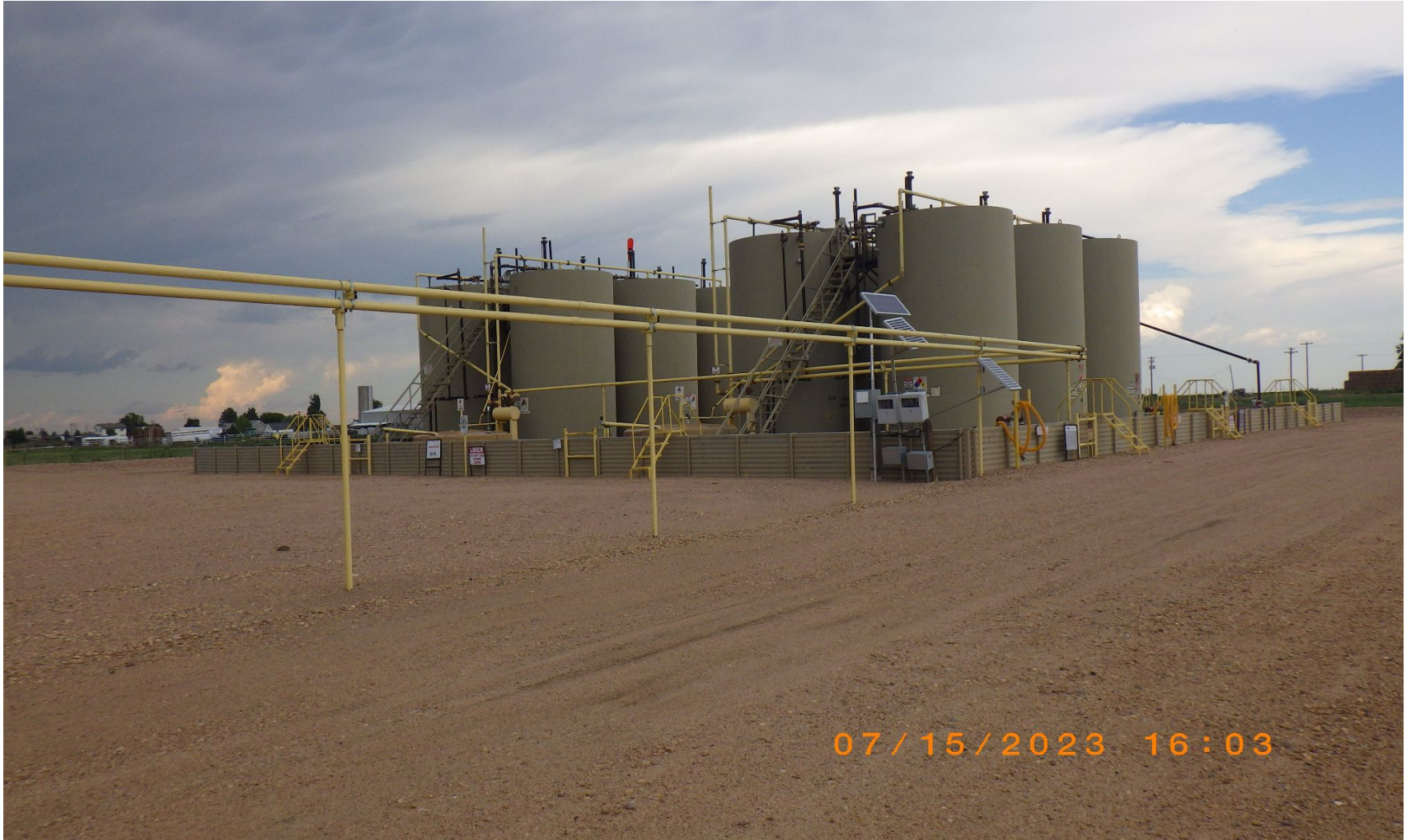
Photo 7. Overview photo of the tank battery. Note: absorbed by active Ram Land production facility.