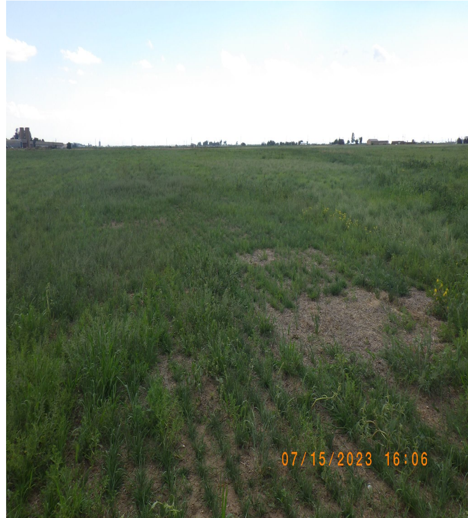
Photo 6. Overview photos of the well pad access road. Note: photo shows that operator has performed final reclamation activities with evidence of drill rows and straw crimped mulch. Site will remain in-process until uniform plant cover of at least 80% of the reference area is achieved.