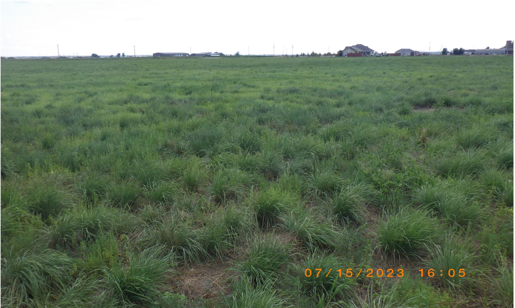
Photo 2. Overview photo of the well pad taken at ground level from the northern edge facing southeast.

Inspection Photos Location Name: Frank 1 Location ID: 327207