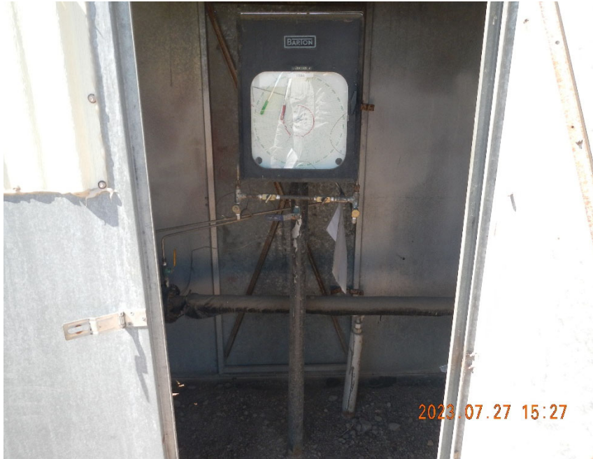
5. Gas Meter Run located inside Meter Shed.