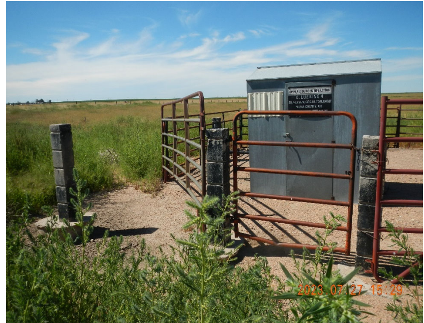
6. Concrete pillars located at well location.