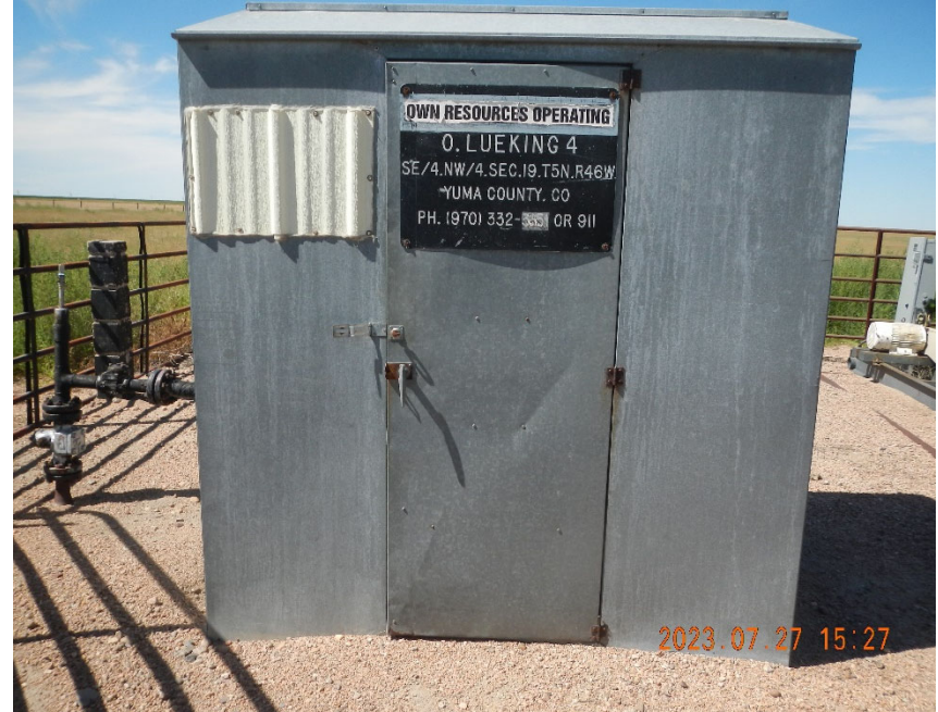
4. Meter Shed.