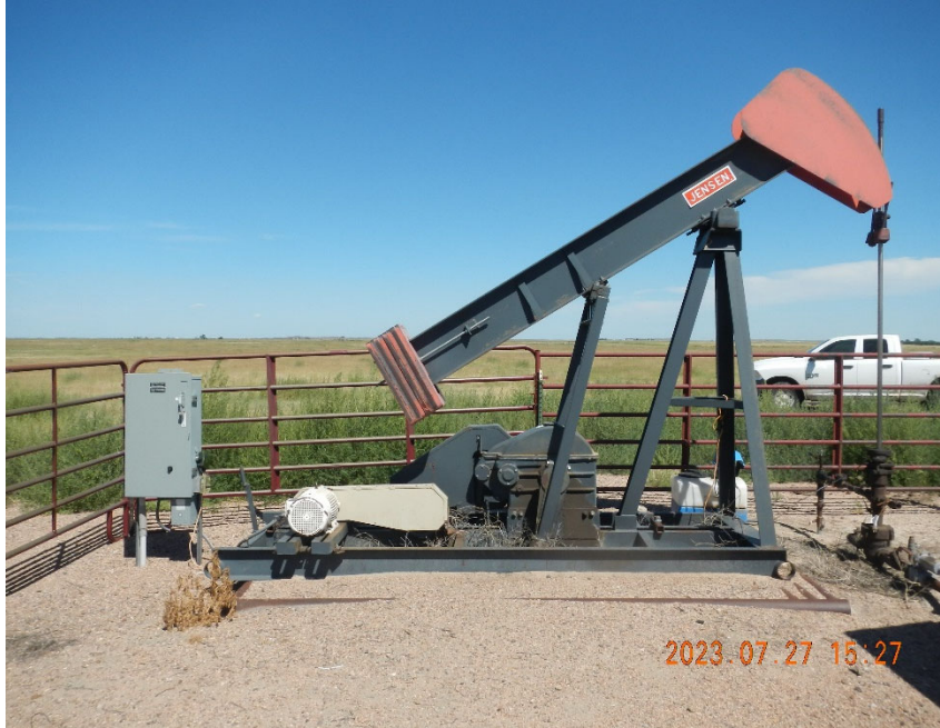
3. Location overview.