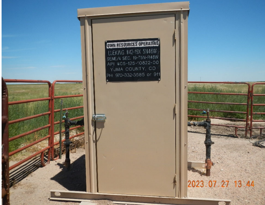
5. Meter Shed.