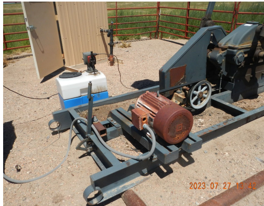
4. View of Electric Motor and Chemical Tank at Pump Jack.