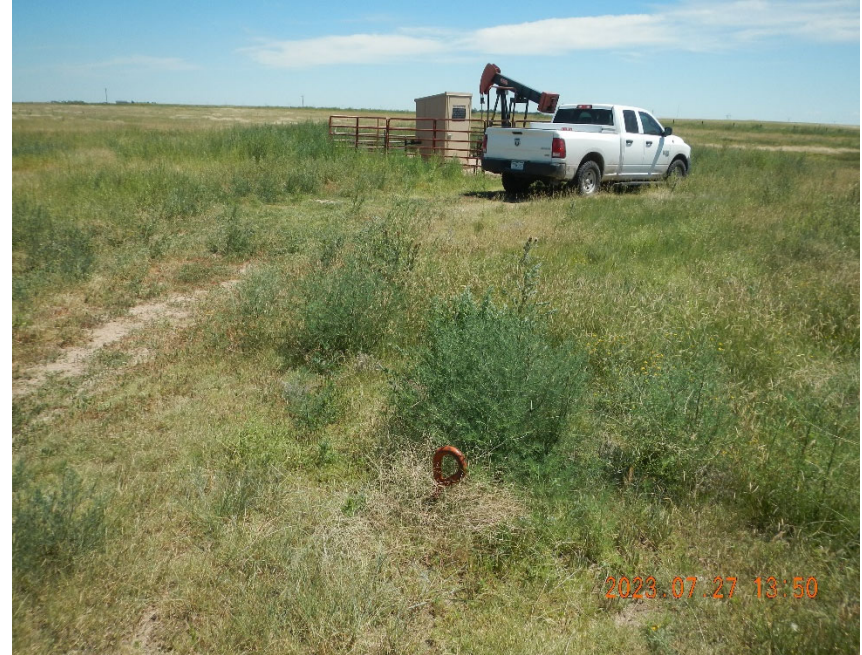
10. View of unmarked rig anchor.