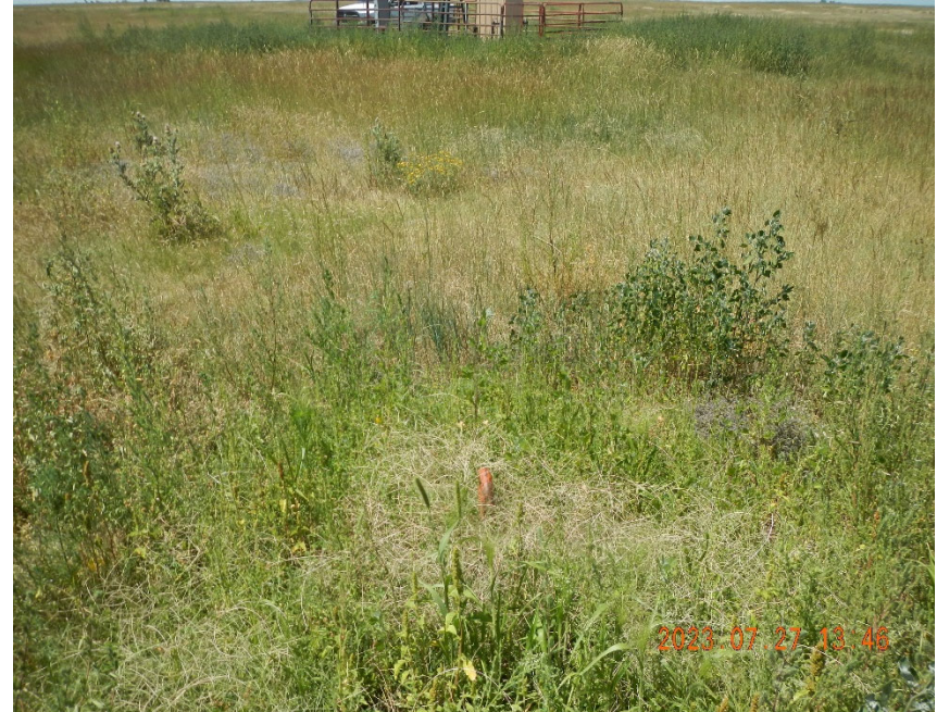
8. View of unmarked rig anchor.