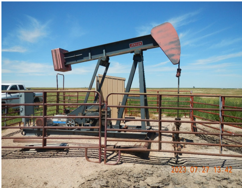
3. Location overview.