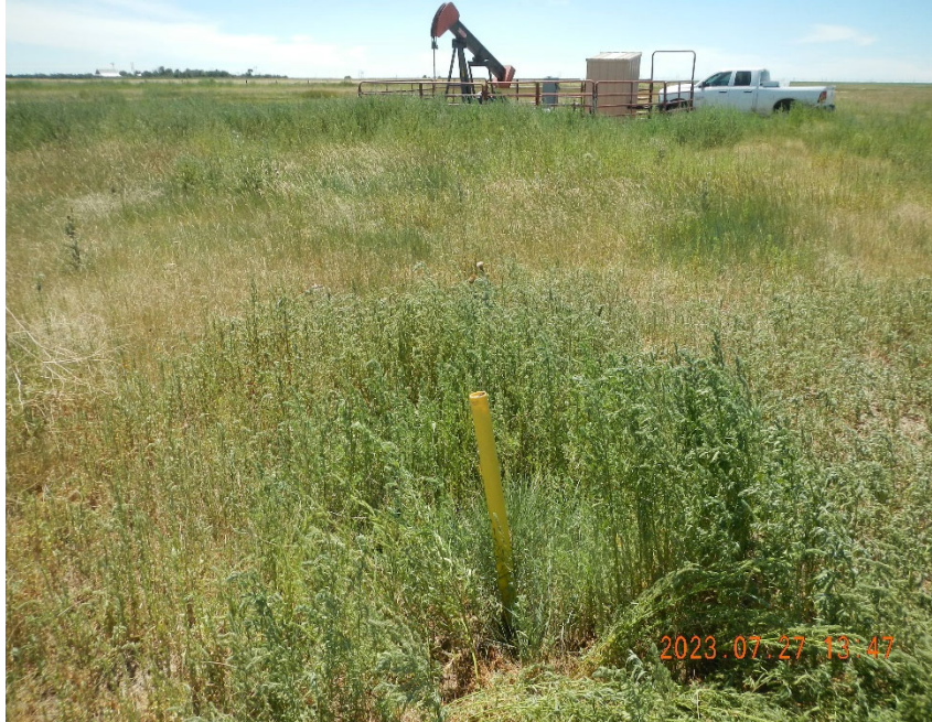
9. View of marked rig anchor.