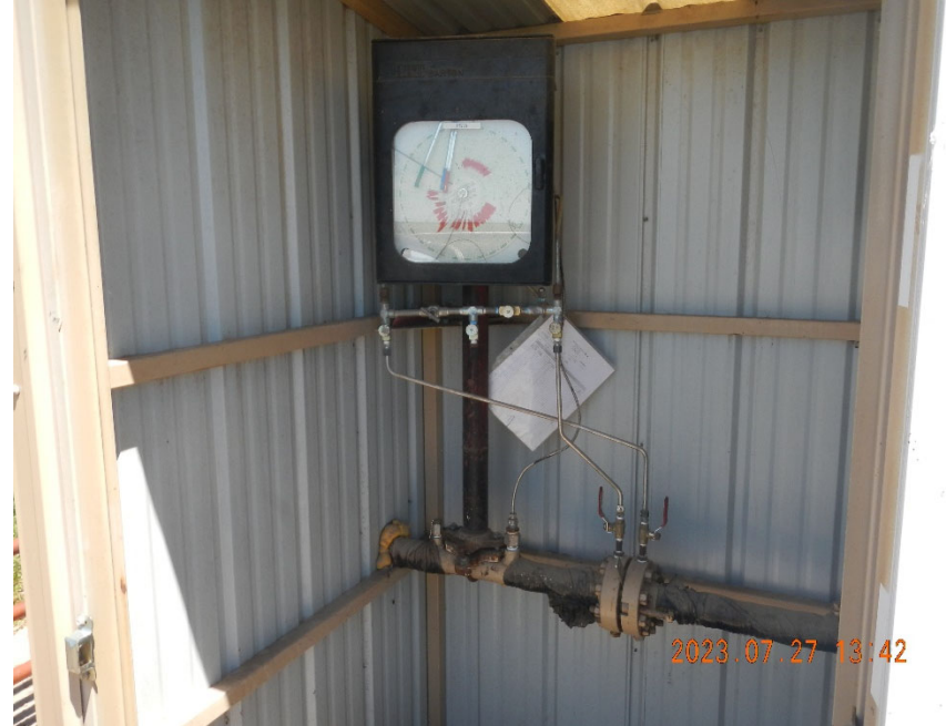
6. Gas Meter Run inside Meter Shed.