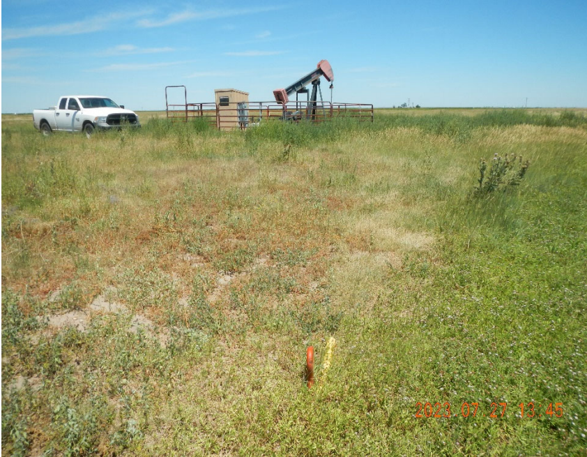
7. View of rig anchor with downed Anchor Marker.