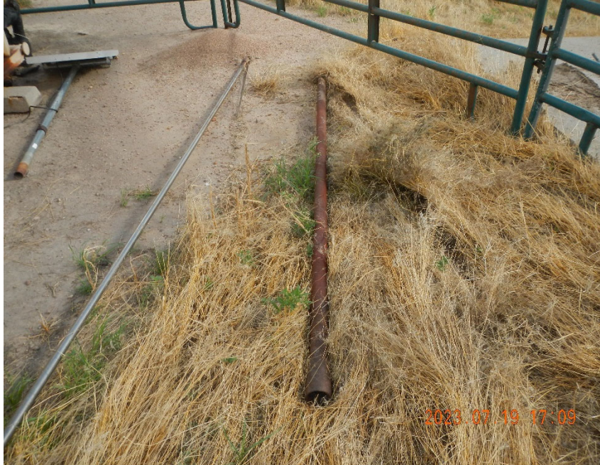
7. View of unused equipment; Solar Panel, Polish Rod, Tubing Sub. Note Dried grass inside fencing.