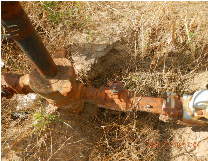
3. Closer view of Wellhead ground area.