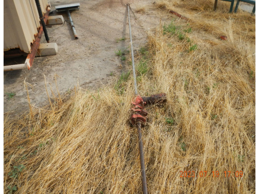
8. Unused equipment. Note grass growth inside fencing.