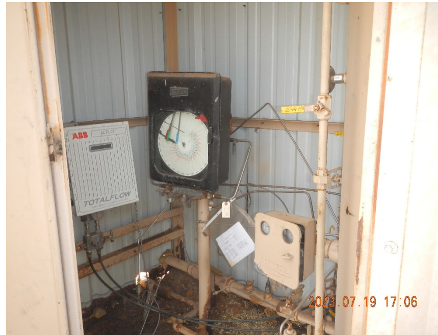
4. View of Gas Meter Run inside Meter Shed.