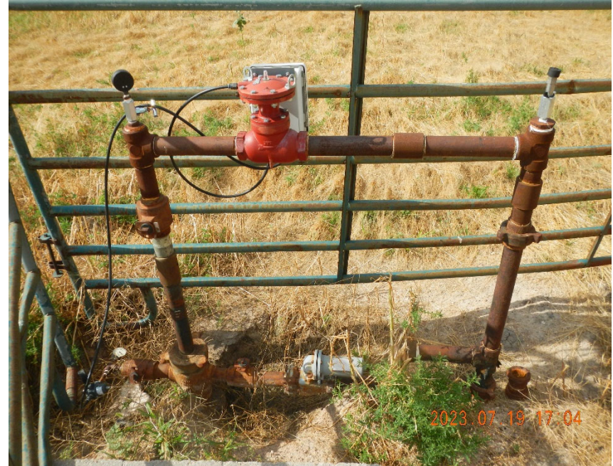
2. View of Wellhead. Note staining on ground around wellhead.