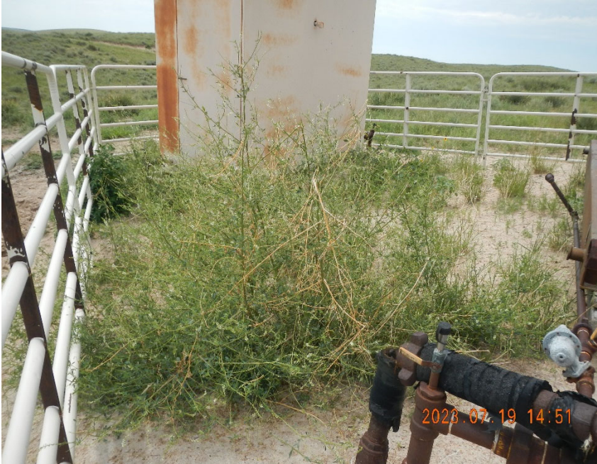
7. View of weed/vegetation growth inside fencing.