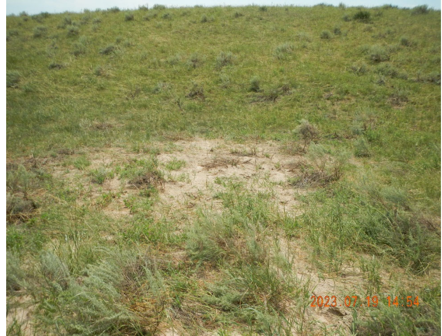
12. View of sediment deposit from erosion channel at base of slope.