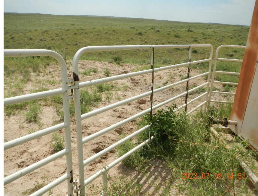
8. View looking SW from inside fencing at erosion channel that starts on the S end of panel fencing.