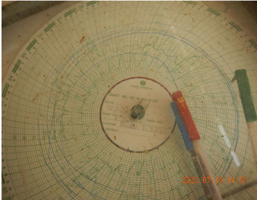
5. View of recording chart inside meter box dated 12-2-22.