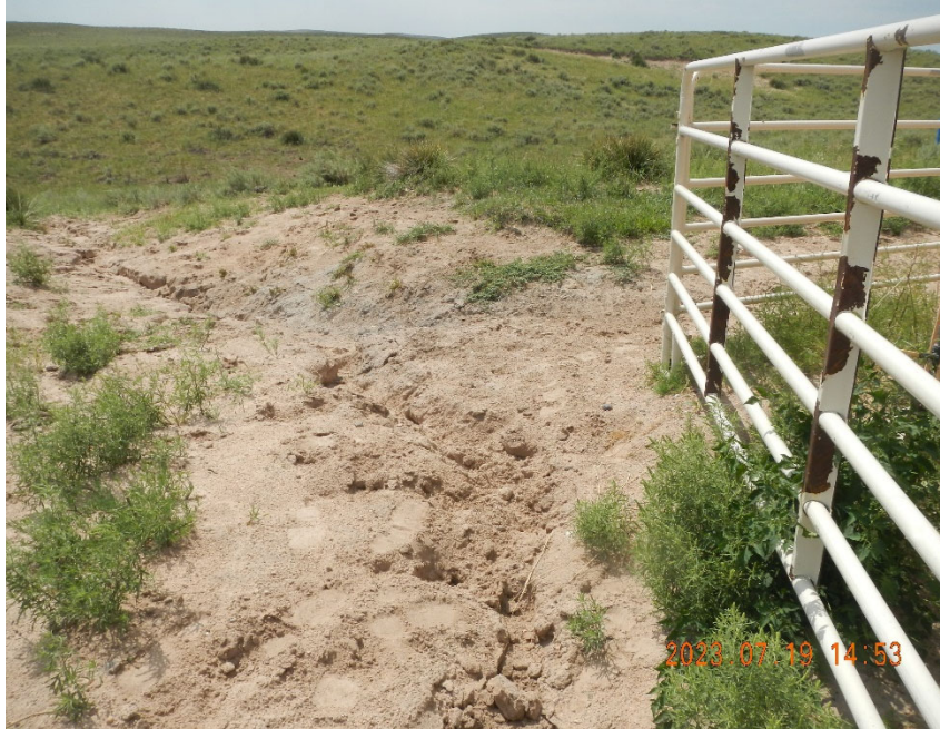
9. View of erosion channel from outside fencing looking W.