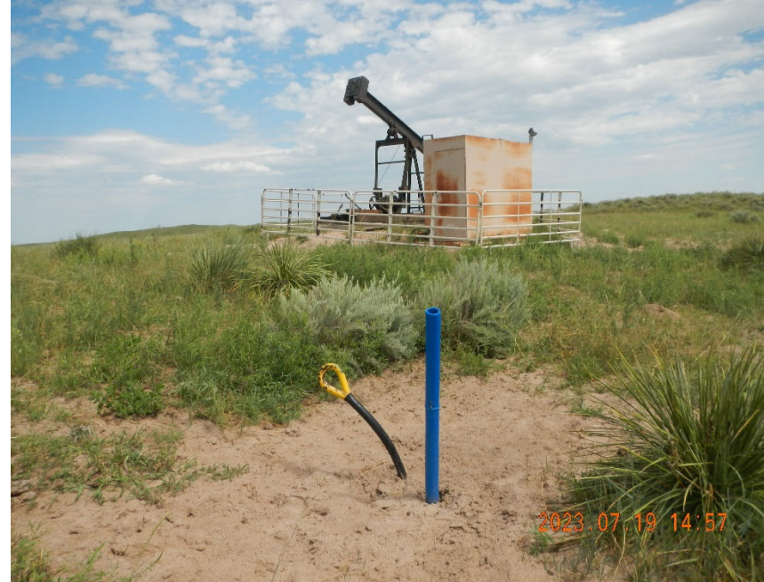
14. One of four marked deadmen.