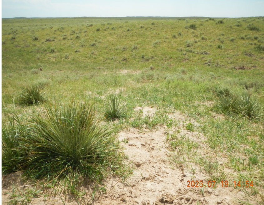
11. View of erosion channel looking SW downgrade of slope.