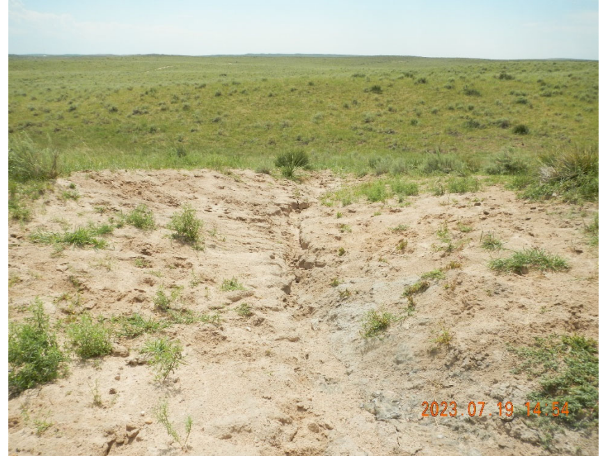
10. View of erosion channel looking W/SW at edge of location and top edge of slope.