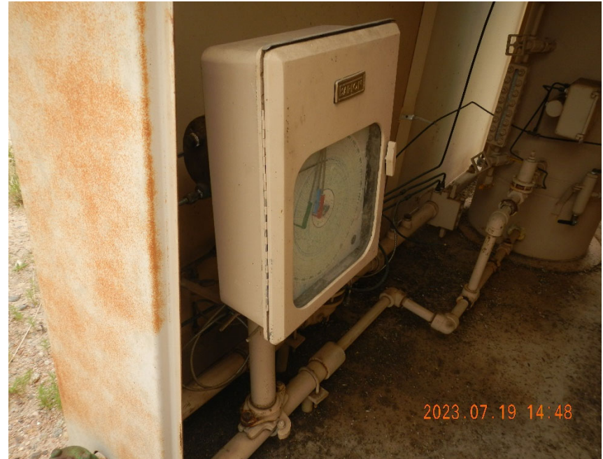
4. View of gas meter run inside meter shed.