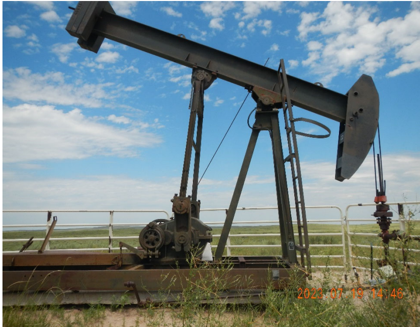
3. Pump Jack with motor removed.