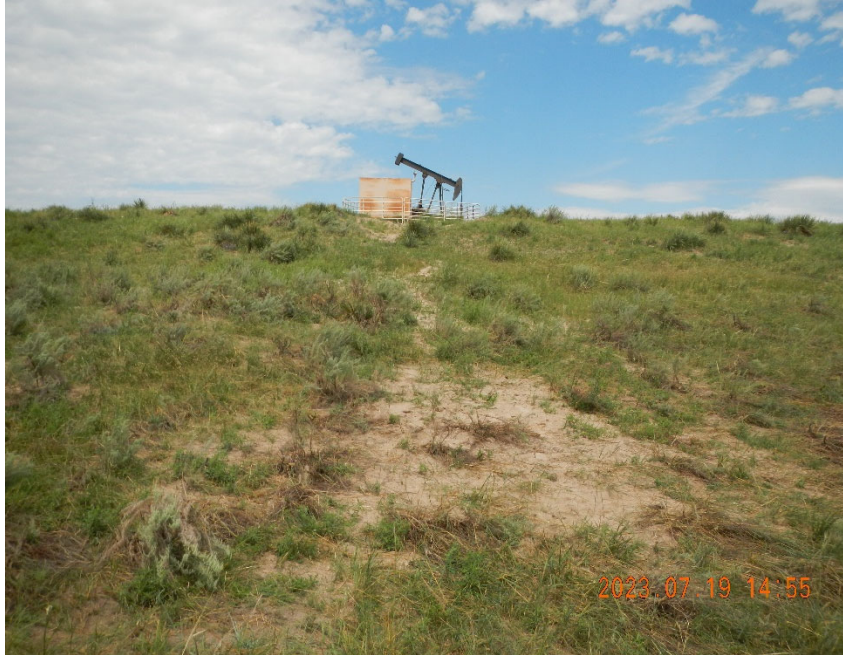
13. View at base of slope looking NE towards well location.