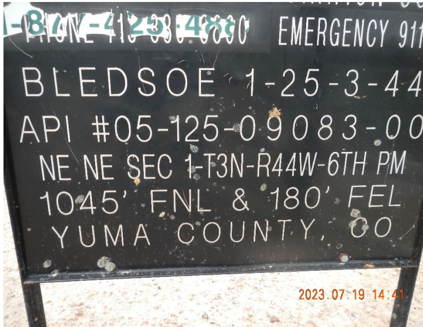
1. Well sign.