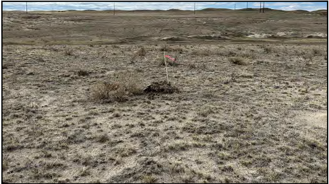
PHOTO: VIEW OF AS-DRILLED LOCATION