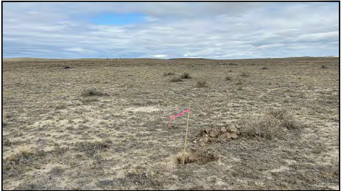
PHOTO: VIEW OF AS-DRILLED LOCATION