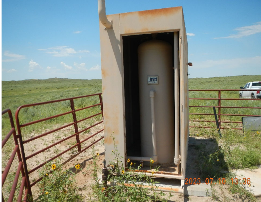
3. View of Vertical Separator inside shed.