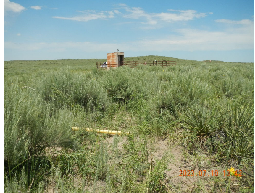
6. Downed Deadman Marker.