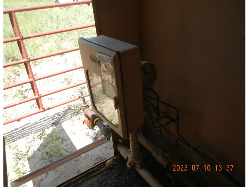
4. View of Gas Meter Run inside shed.