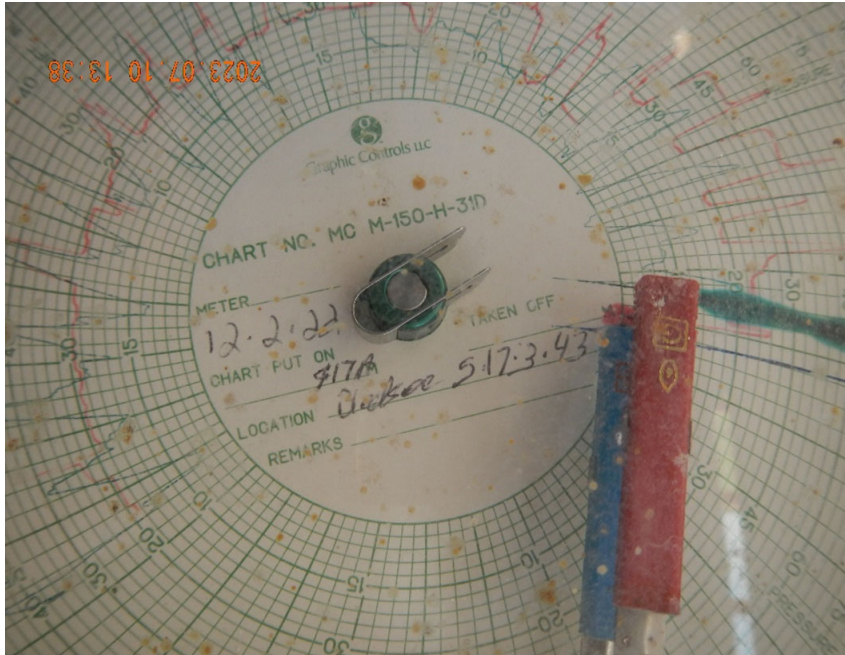
5. Charter inside Meter Box dated 12-2-22 at time of inspection.