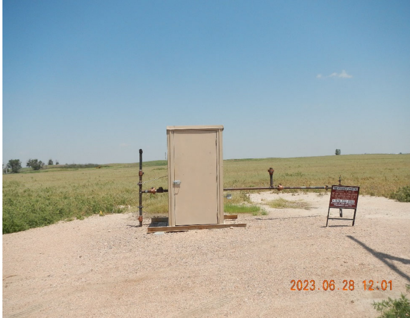
9. View of remote Meter House at CR 57.