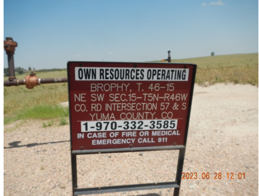
8. Well sign located at remote Gas Meter Run.