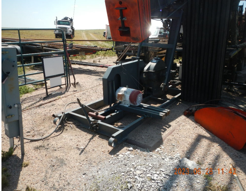
5. View of rear of Pump Jack and electric Prime Mover.