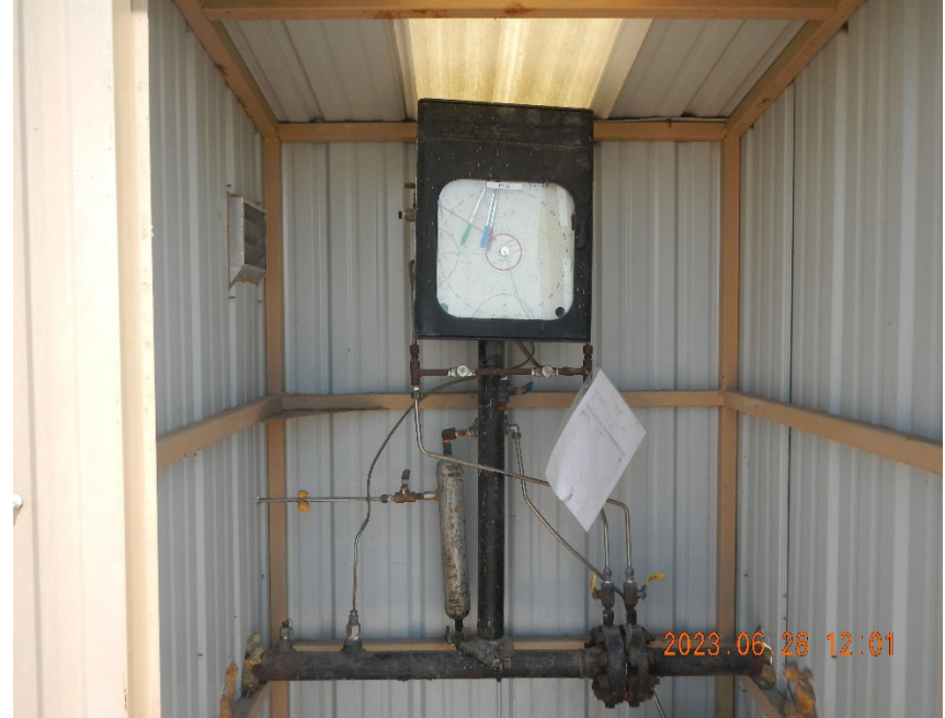
10. View if Gas Meter Run inside Meter House.