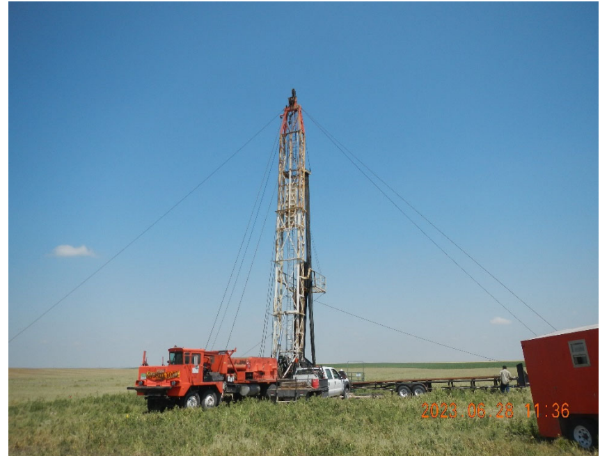
2. View of Work Over Rig approaching location.