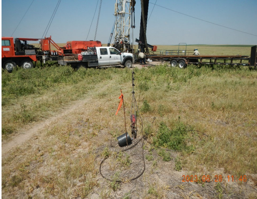
7. One of four anchors/deadmen marked and in use.