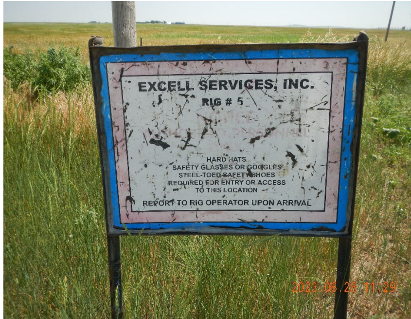
1. Rig sign at CR 57 and access road.