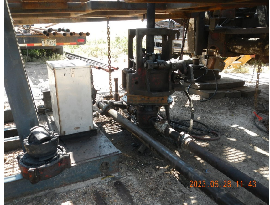
View of well with Blow Out Preventer installed for well work.