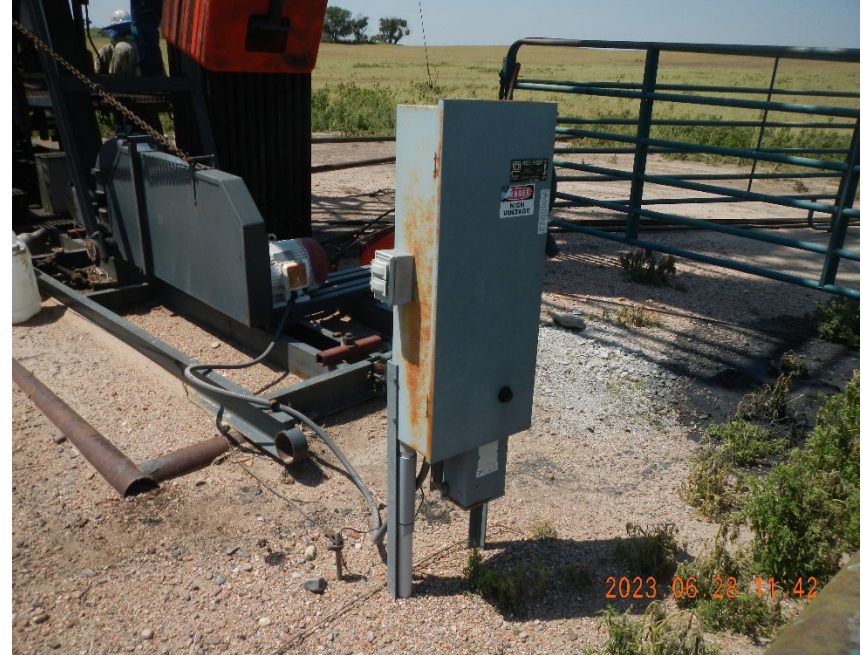
6. Pump Jack power and control panel.