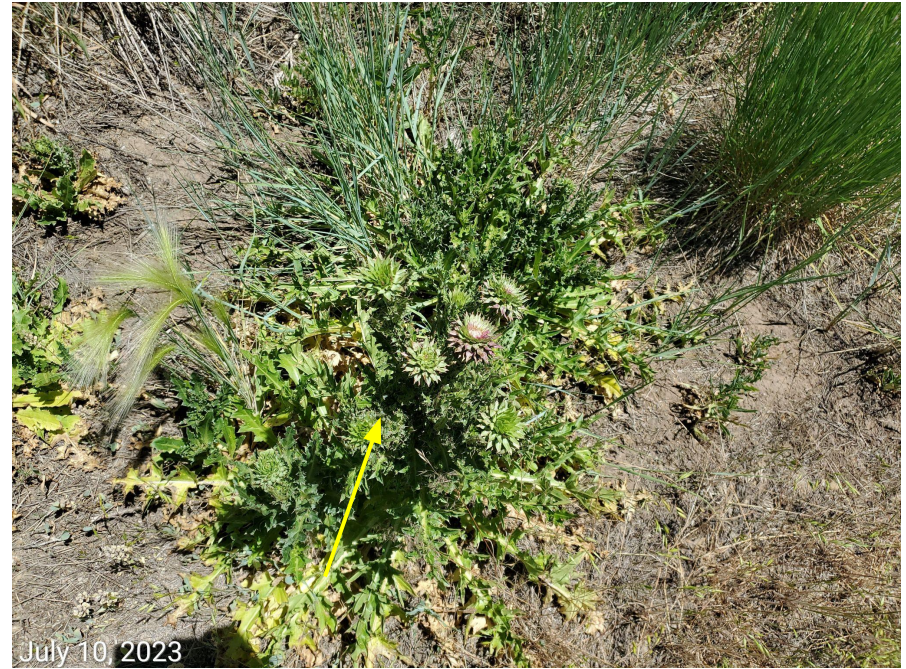
Photo 13: Photos 13-16 show Undesirable and Noxious Plant Species observed established on the vegetated areas along the perimeter of the Location, and the working pad surface.