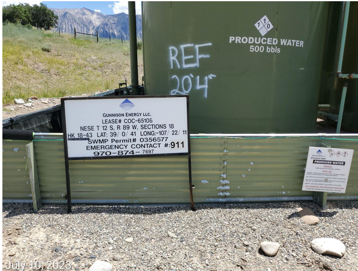
Photo 6: Photo taken from the tank battery facility on the east end of the Location. Photo shows tank battery signage missing required information in accordance with Rule 605.e; The four tanks at the battery facility observed missing required information in accordance with Rule 605.h.