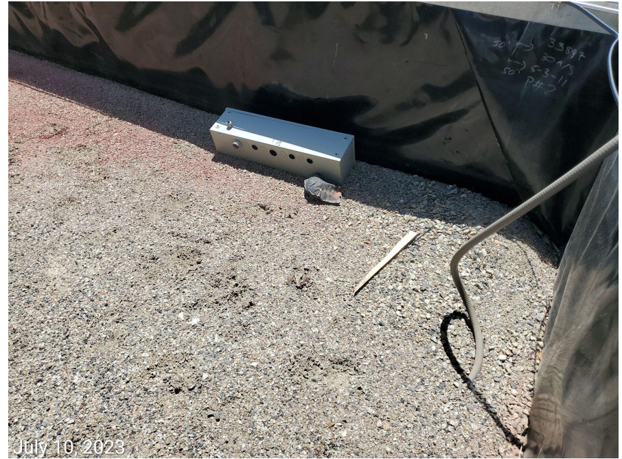
Photo 8: Photos 8-7 show various unused equipment/trash/debris observed improperly stored within the battery's containment BMP.