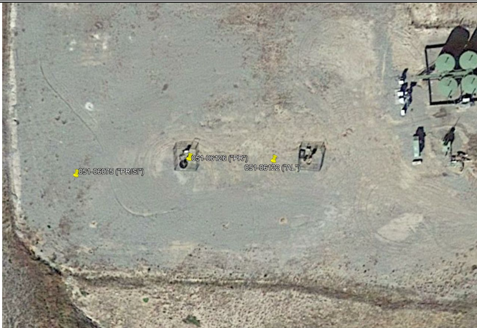
Photo 6: Continue from photo 5. Photo a Google Earth aerial image of the Location. Photo shows well coordinates from the Scout Cards; as drilled coordinates for Well API 051-06075 incorrect; coordinates for the abandoned Well API 051-06122 also incorrect.