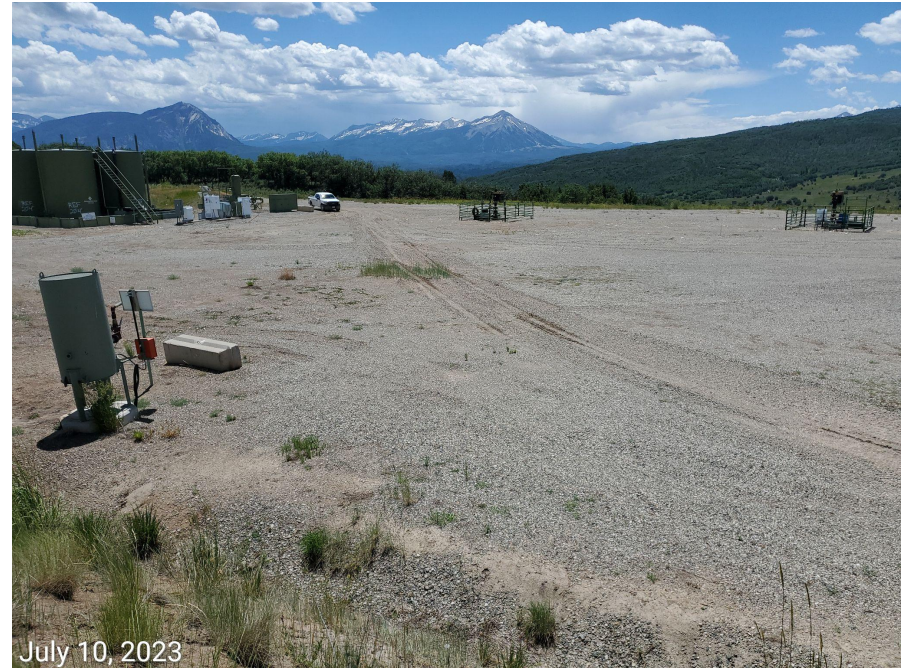
Photo 1: Photos 1-2 taken from the North end of the Location. Photos provide an overview of the Location from east, southeast, southwest to west.