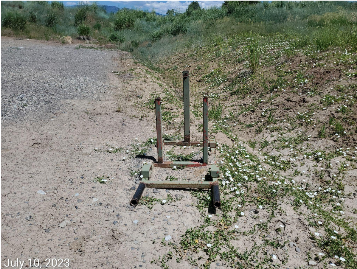
Photo 10: Photo taken from the east end of the Location. Photo shows Unused equipment stored on Location.