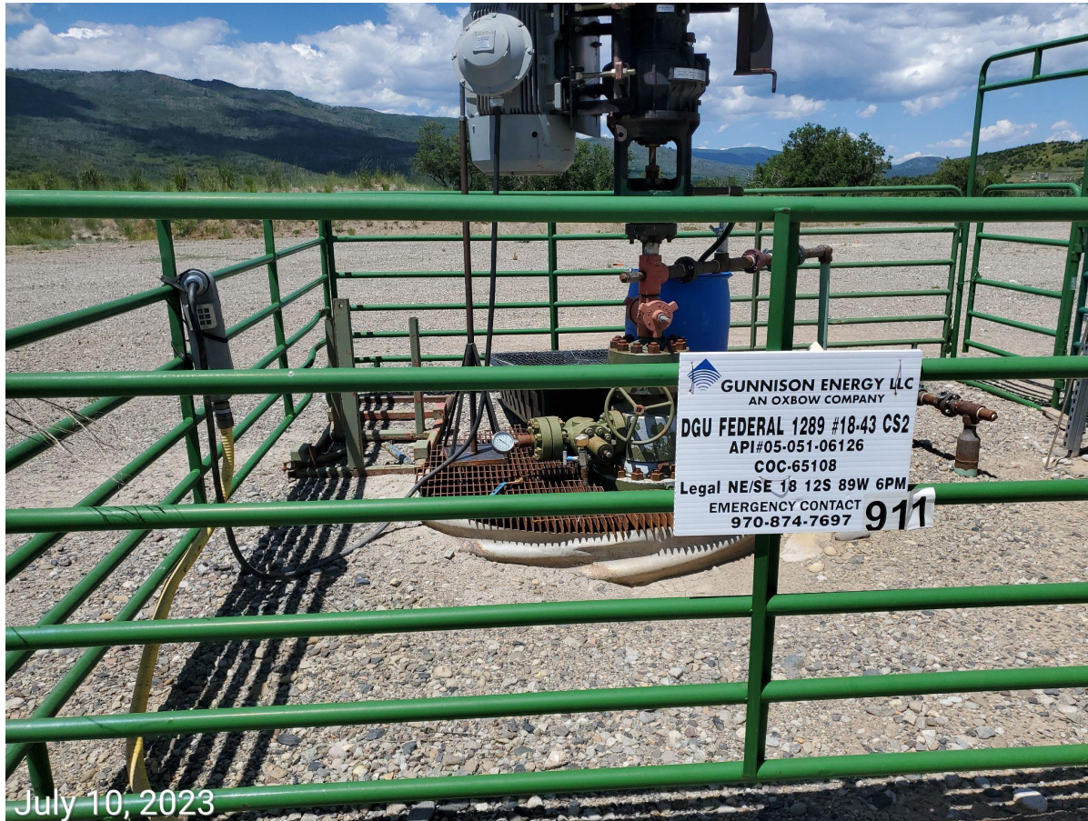
Photo 4: Photo shows Well API #051-06126. Well is the easternmost producing well on the Location.