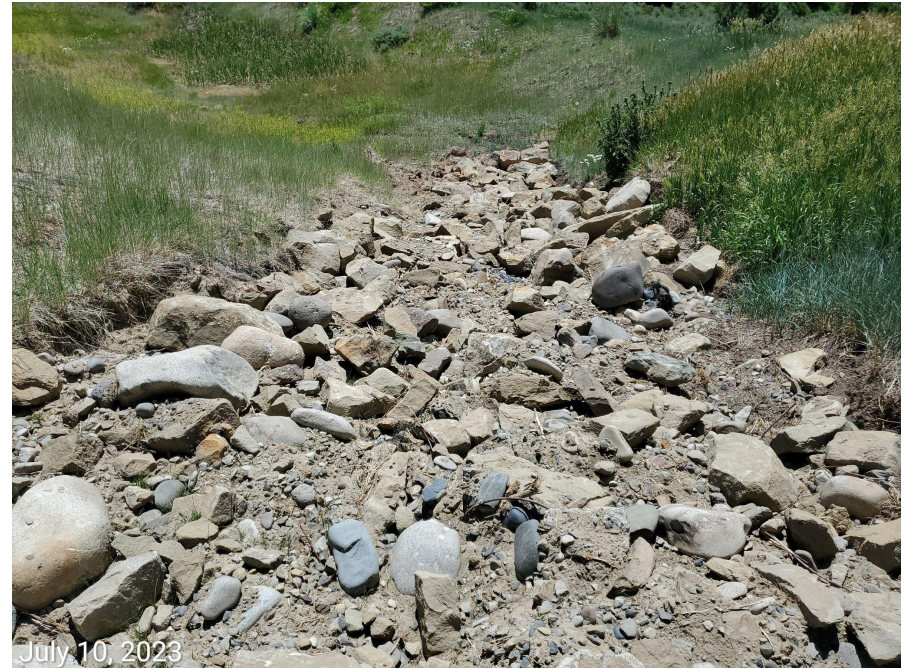
Photo 17: Photos taken from the sediment trap inlet on the southwest end of the Location. Photo shows the gully erosion has been repaired, and the inlet armored with riprap material; liner appears to have been placed beneath the rock material.