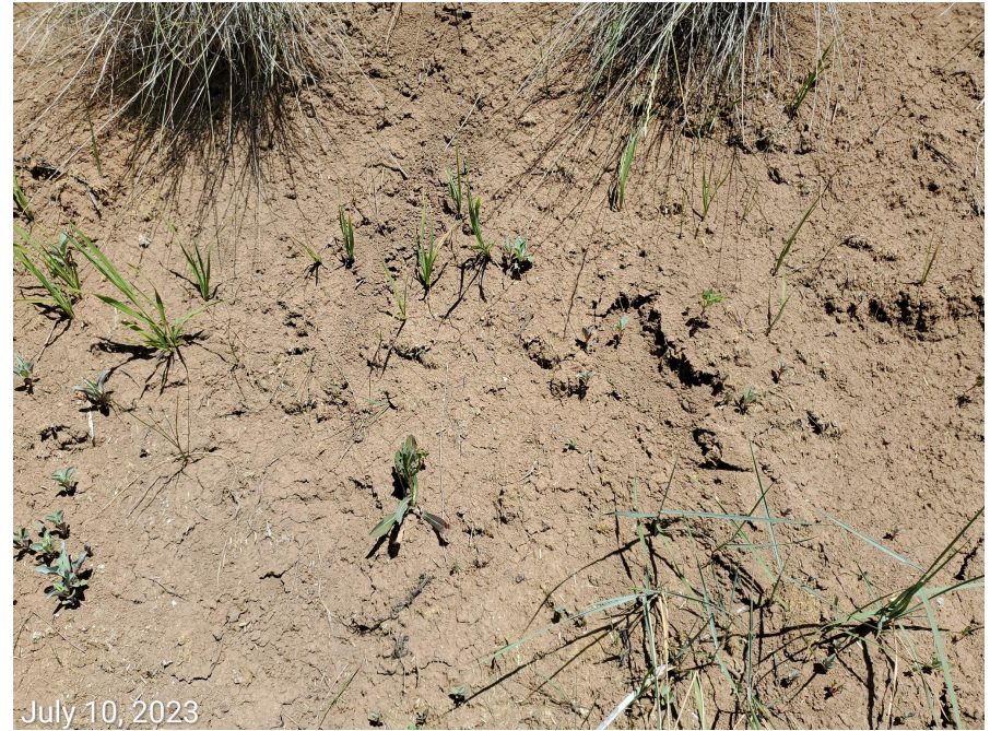
Photo 11: Photos taken from the slopes on the north end of the Location. Hydromulch observed on slopes, though degradation of the BMP is beginning to occur. Maintenance advised prior to failure of the control.