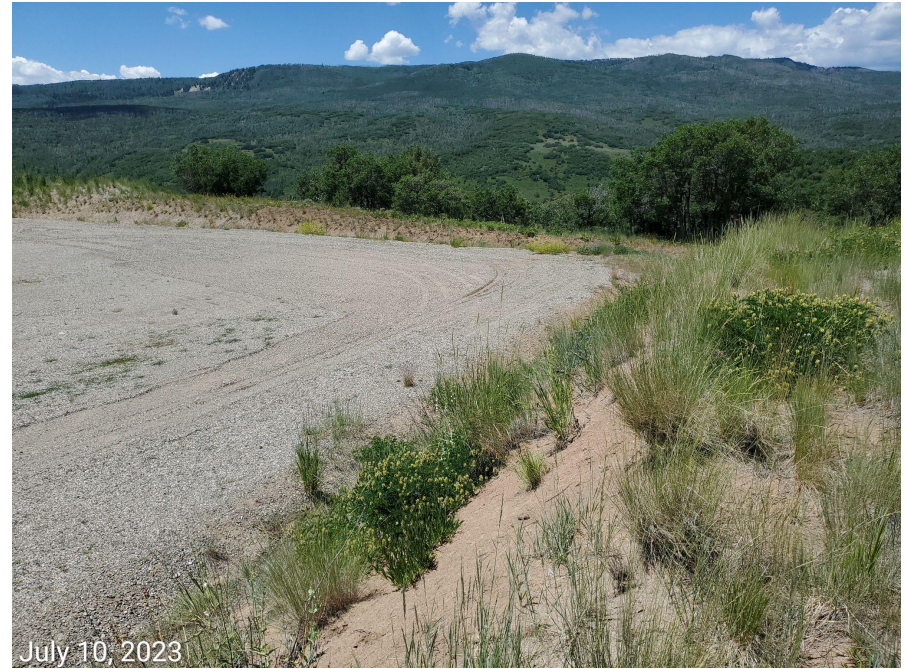
Photo 2: See comments under photo 1. Photos also show areas on the west end of the Location, not needed for production, have not been reclaimed in accordance with 1003 Rules.