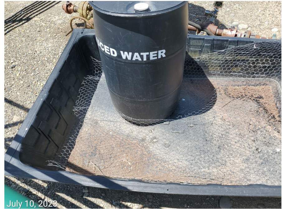
Photo 5: Photo shows Well API #051-06075. Well is the westernmost producing well on the Location; “As Drilled” coordinates within scout card incorrect. Photo right shows wildlife protection BMP (chicken wire/netting) is no longer in proper functioning condition.