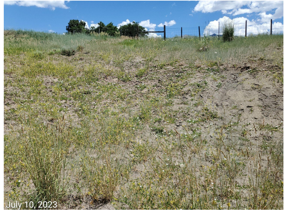
Photo 12: Photos taken from cut slopes on the east end of the Location. Hydromulch observed on slopes, though degradation of the BMP is beginning to occur. Maintenance advised prior to failure of the control. Photo right also shows Undesirable/Noxious Plant Species (Bindweed, white flowers) established on the Location.