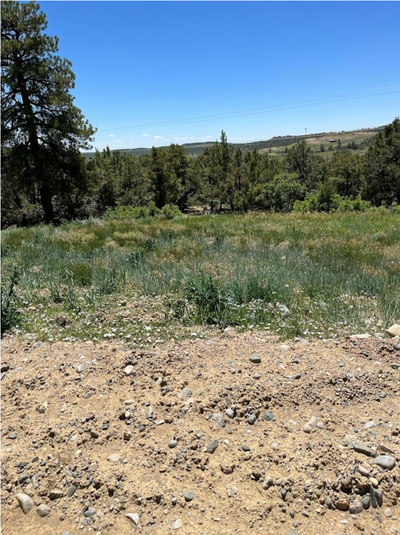
Chemical Treatment of weeds