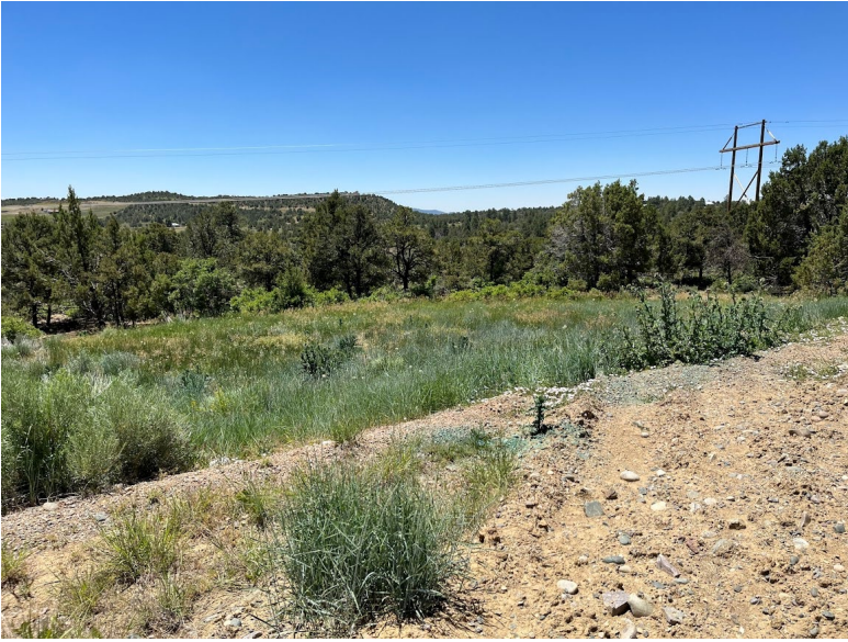
Chemical Treatment of weeds