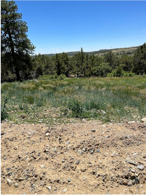
Chemical Treatment of weeds