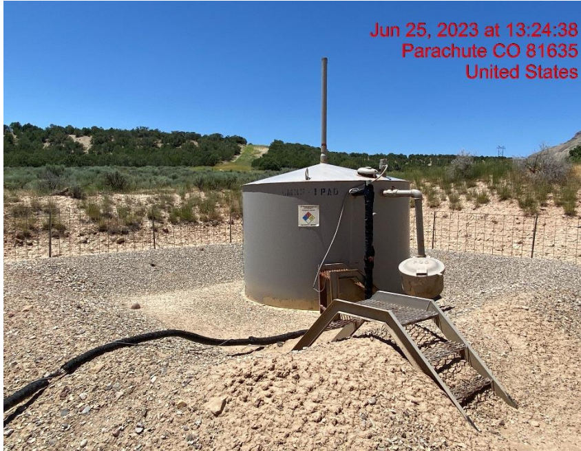
Tank Battery – Photo #04832