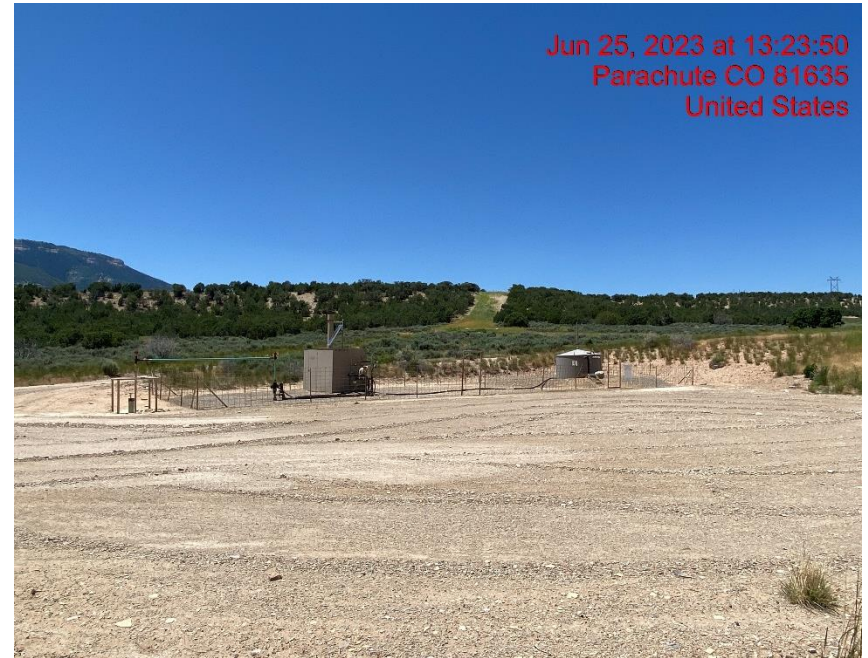
SE Corner of Location – Photo #04828