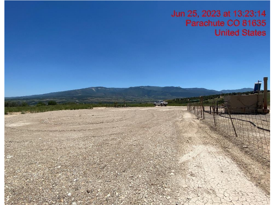
NW Corner of Location – Photo #04826