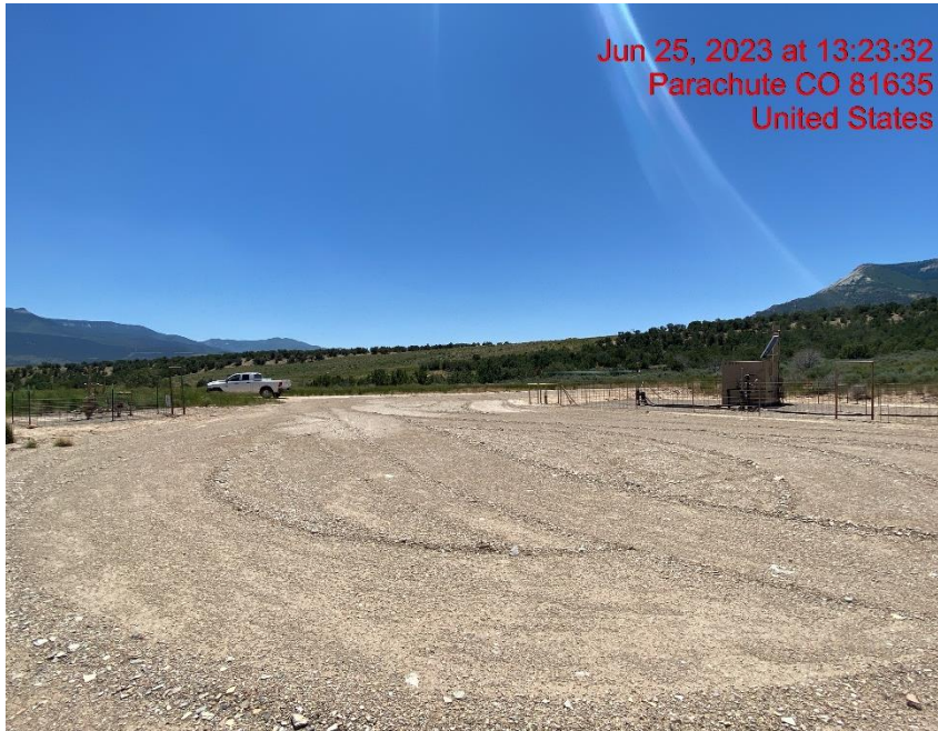
NE Corner of Location – Photo #04827