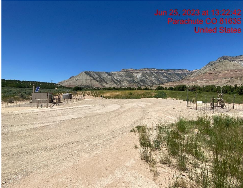
SW Corner of Location – Photo #04825