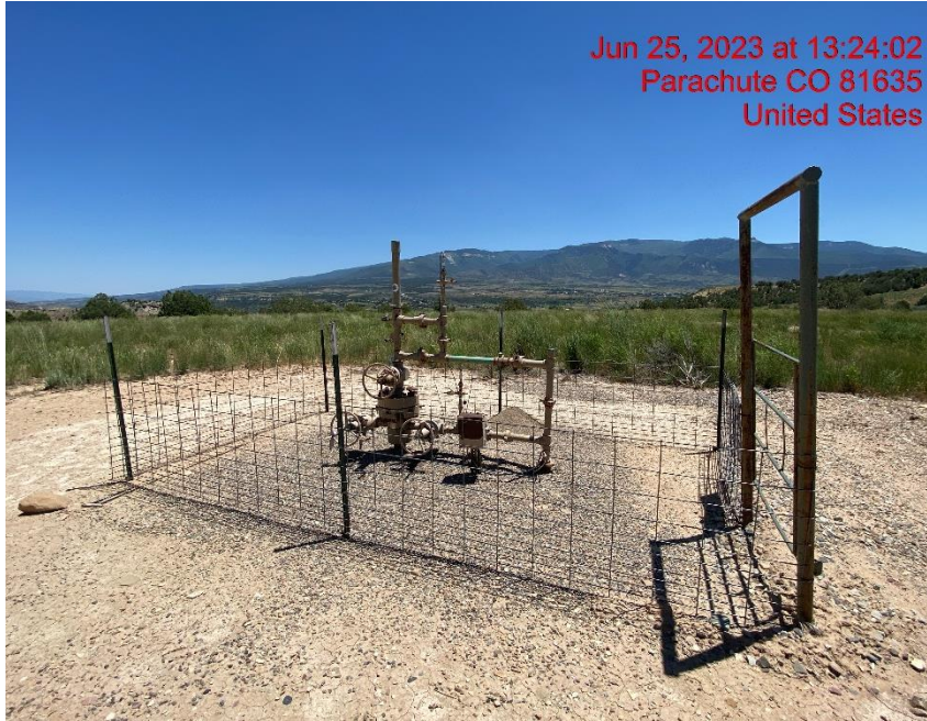
Wellhead – Photo #04829