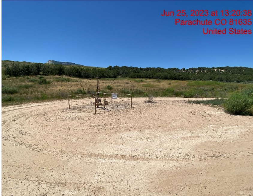
SE Corner of Location – Photo #04822