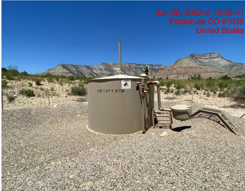
Tank Battery – Photo #04834