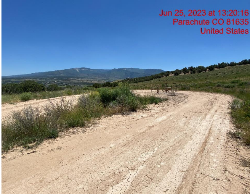
NW Corner of Location – Photo #04820