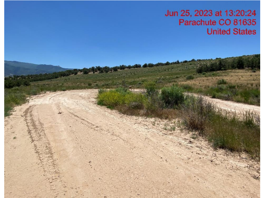
NE Corner of Location – Photo #04821