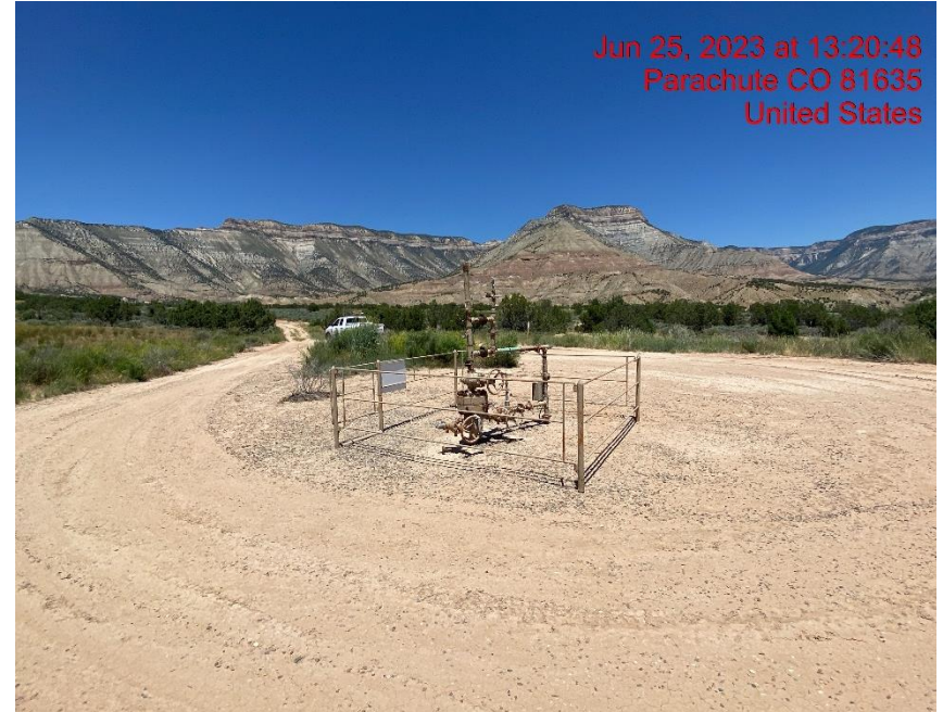
SW Corner of Location – Photo #04823