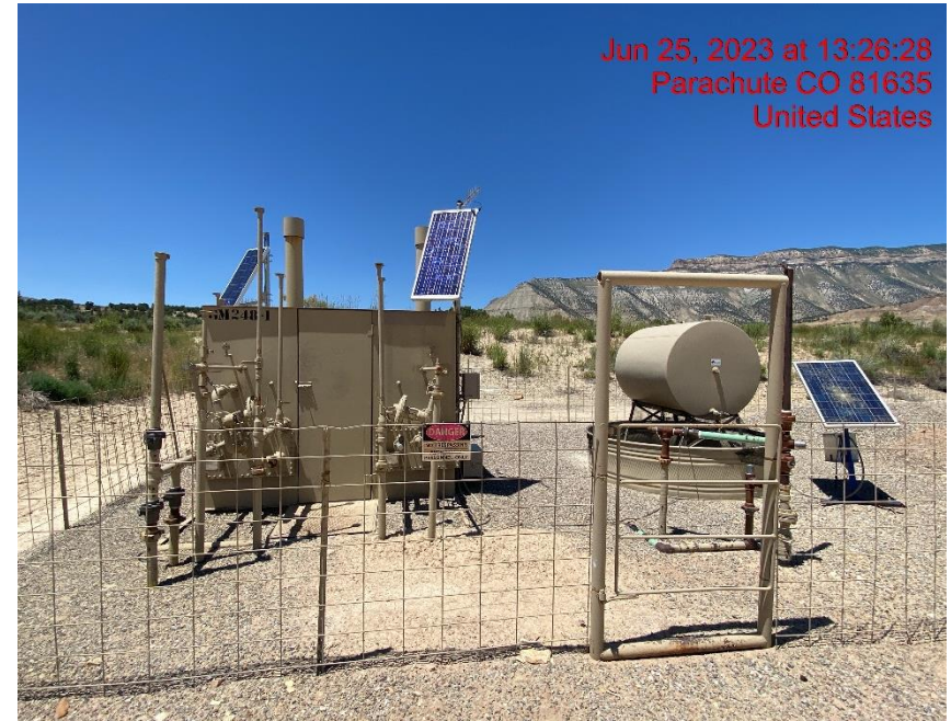
Separator – Photo #04833