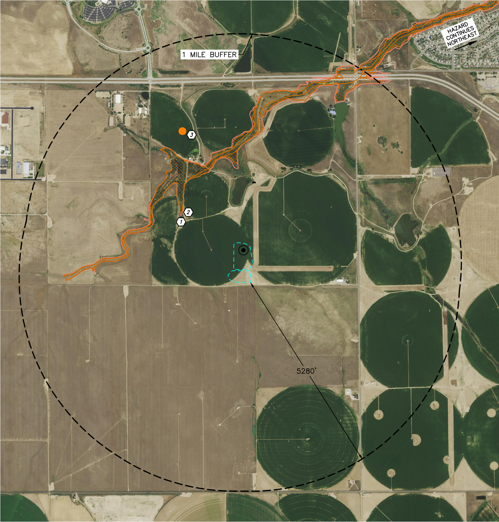
GEOLOGIC HAZARD: (MEASURED FROM EDGE OF WORKING PAD SURFACE)

Q-Q: SESW SECTION: 13 TOWNSHIP: 5N RANGE: 67W 6TH. P.M. WELD COUNTY, CO