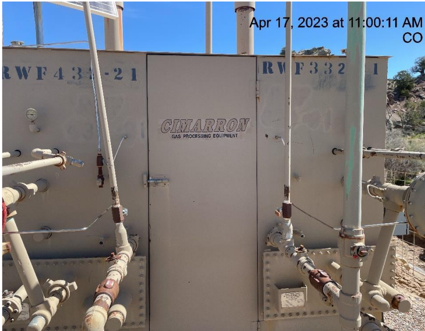
Photo # 5403 From Inspection 708900295 conducted on 04/17/2023 Meter calibration info not conspicuously posted