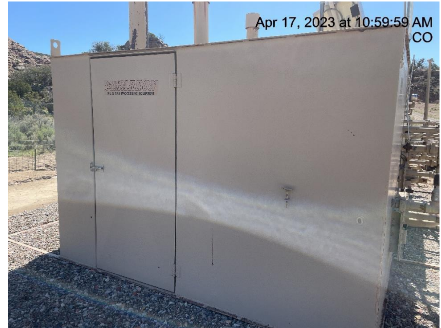
Photo # 5402 From Inspection 708900295 conducted on 04/17/2023 Meter calibration info not conspicuously posted