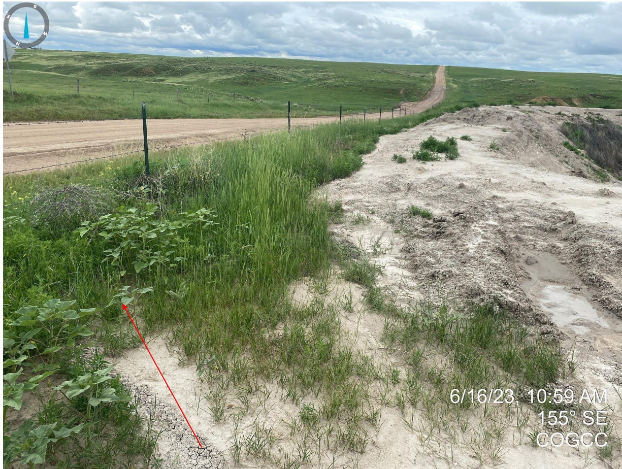
Photo 2. Berm material (possibly impacted) does not appear stabilized with evidence of sediment transport and unconsolidated material. Additional stormwater BMPs will be required to prevent sediment from leaving location.