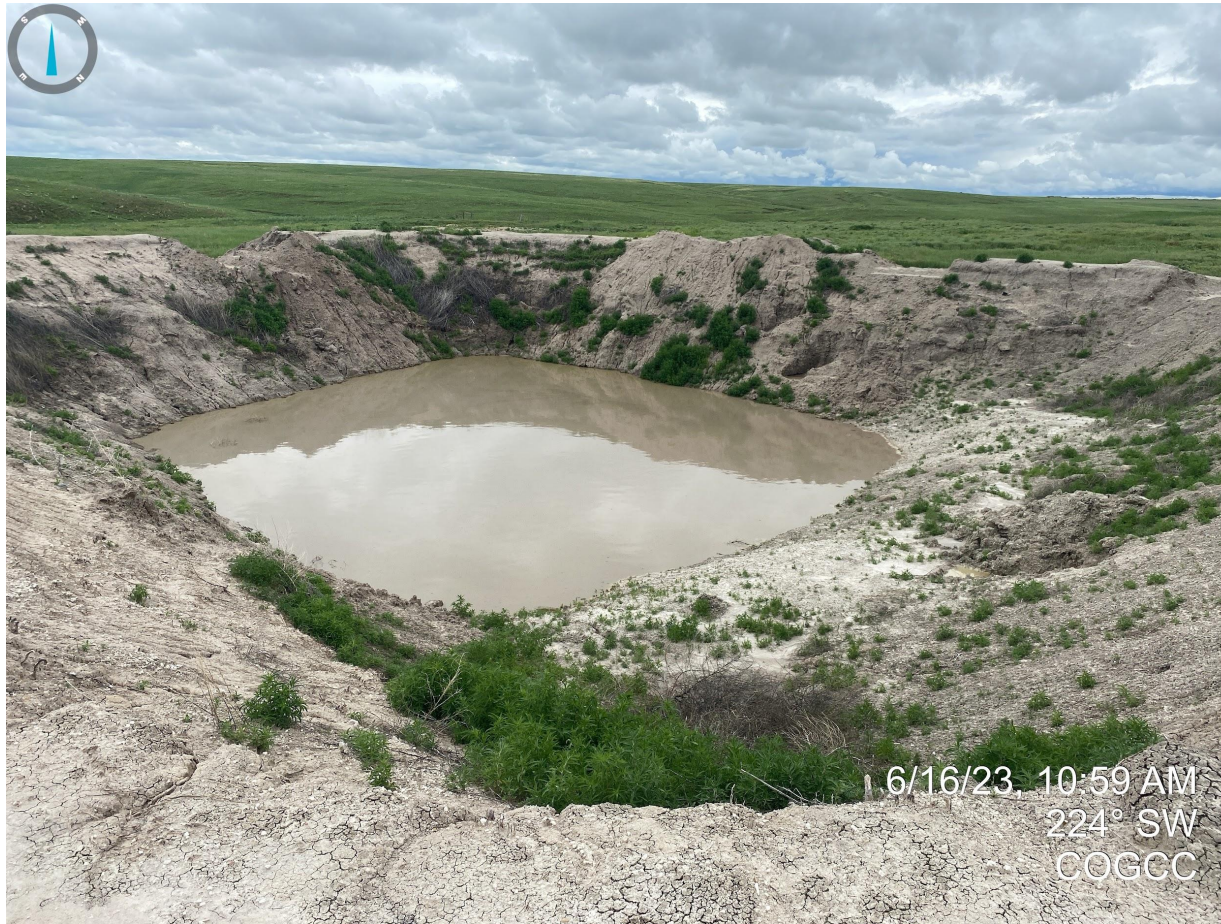
Photo 3. Pit walls do not appear to be properly stabilized with evidence of unconsolidated material. Kochia was also observed to be growing within the pit walls and will need to be managed for.