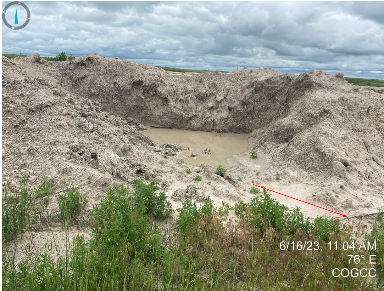
Photo 10. Western portion of the pit. It appears a recent excavation has occurred and stormwater has collected in the void. No apparent stormwater BMPs were observed to prevent any stormwater from coming in contact with impacted material and preventing sediment transport (observed at the base of the excavation).