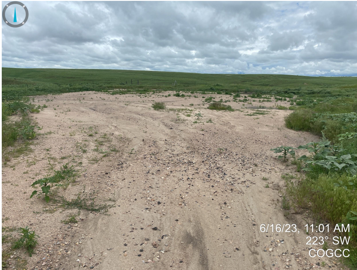
Photo 7. Former well location does not appear to have been reclaimed. Active remediation projects should not preclude the commencement of final reclamation activities.