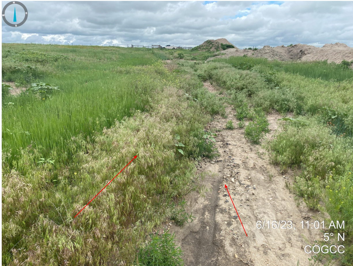
Photo 6. Taken from the access road. Evidence of rill erosion and CO List C Noxious Weed (cheatgrass) observed.