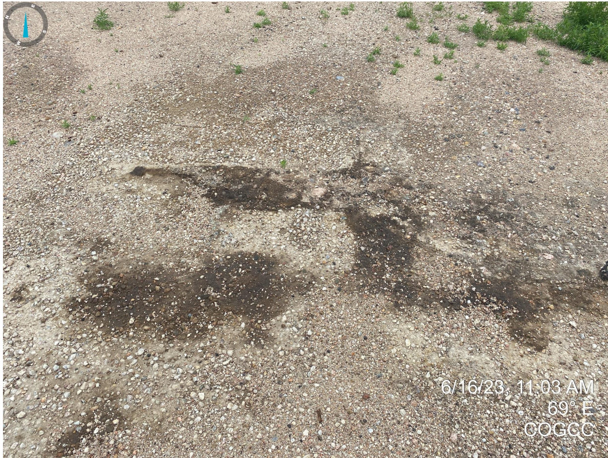
Photo 9. Stained soils near the access road and former well location will need to be properly cleaned and disposed of.