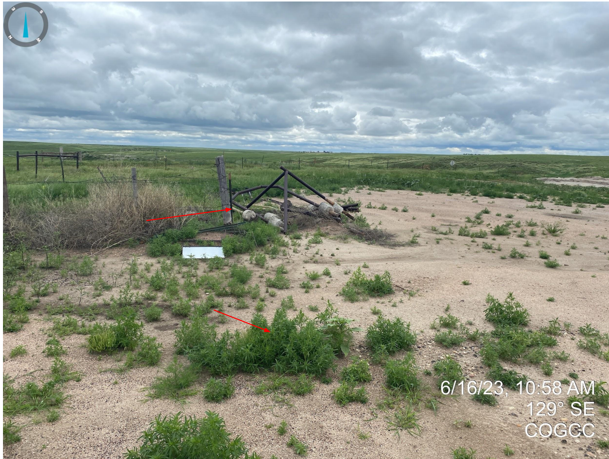
Photo 1. Debris and equipment observed on location. This equipment should have been removed 3 months after plugging date in accordance with Rule 1004. Also pictured, undesirable vegetation (e.g. kochia) throughout the former production areas.