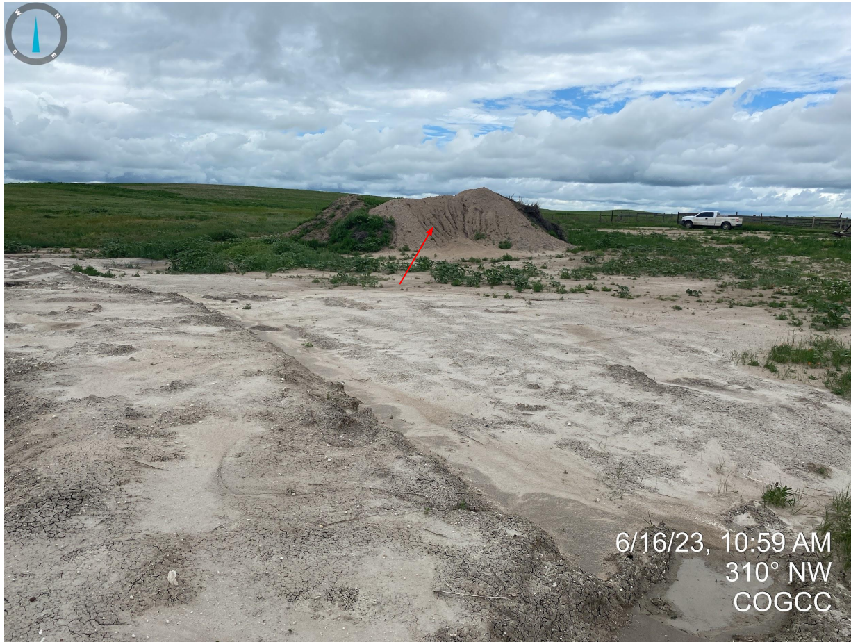
Photo 4. Stockpiled material north of the pit is not marked or signed to indicate if material is impacted or not. Rill erosion and sediment transport is observed on the stockpile and no evident stormwater controls/BMPs observed to contain the soils.