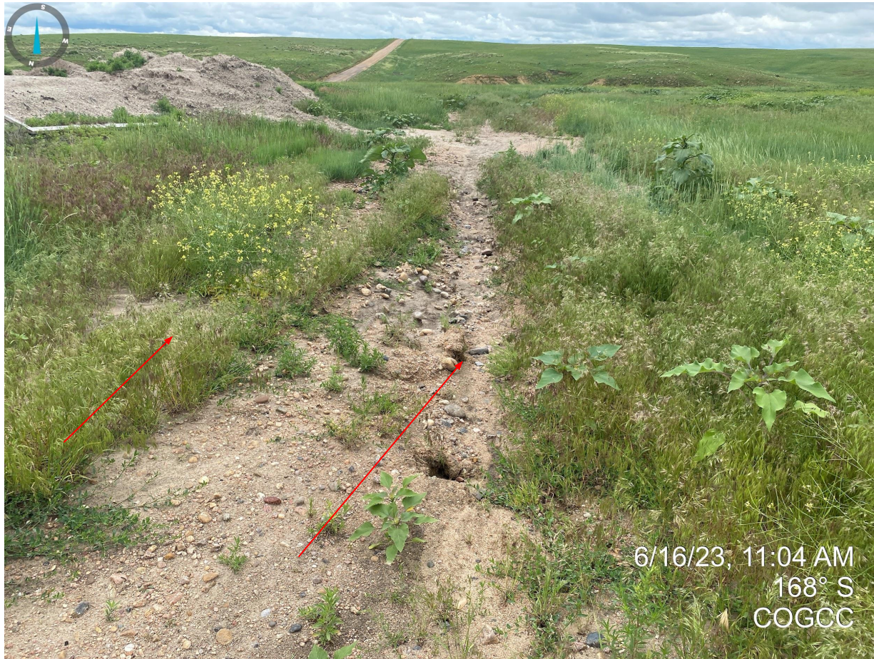
Photo 11. Rill erosion and Noxious Weeds (cheatgrass) observed on the access road.