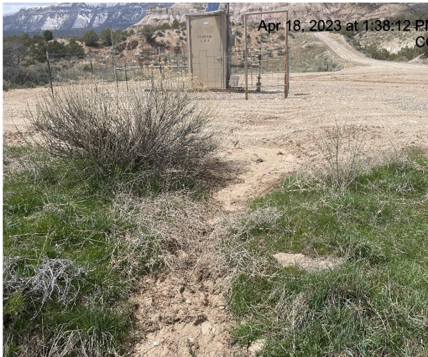
Photo # 5695 From Inspection 708900299 conducted on 04/18/2023 Erosion & transport of sediment off location