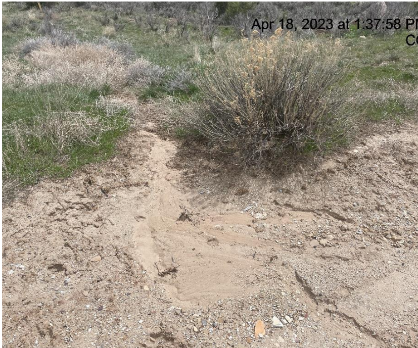
Photo # 5694 From Inspection 708900299 conducted on 04/18/2023 Erosion & transport of sediment off location