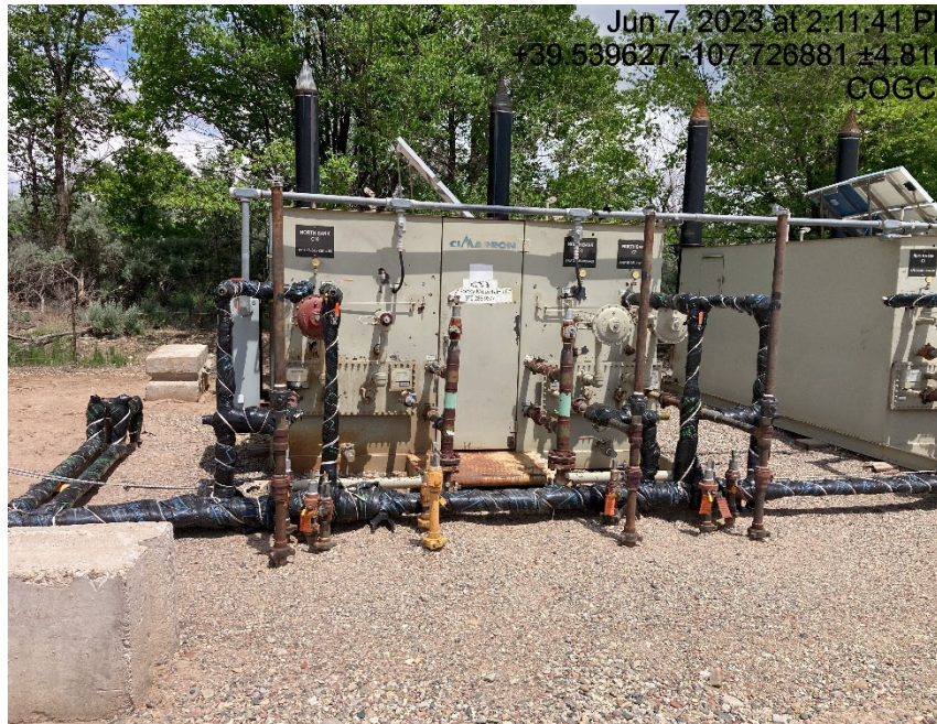
Meter calibration card not conspicuously posted.