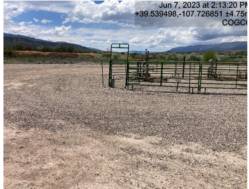
Open gate to well heads