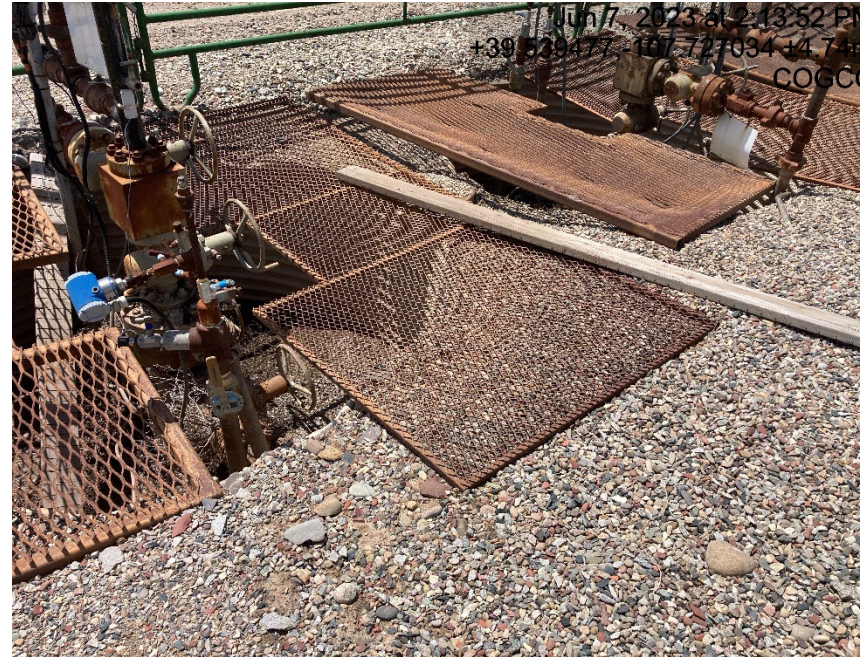
Open cellars and egress ramp