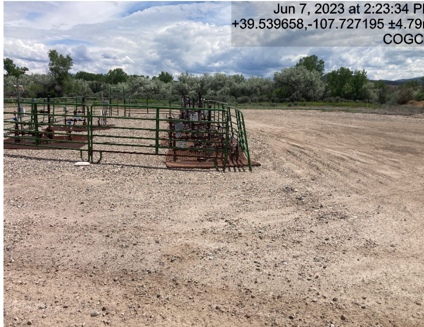
Well head fencing open