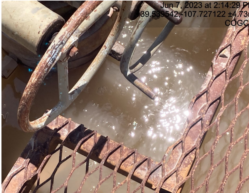
Well head bubbling