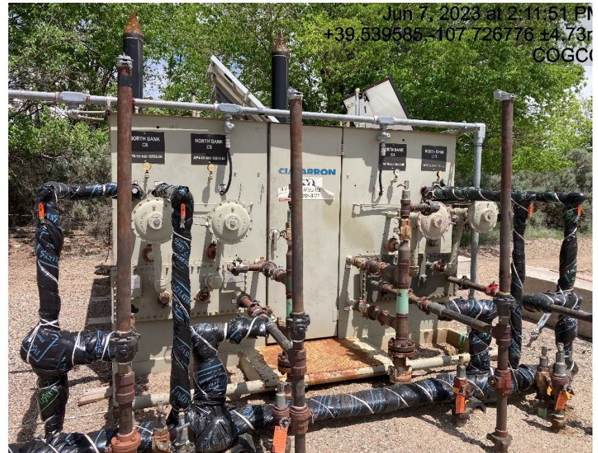
Meter calibration card not conspicuously posted.