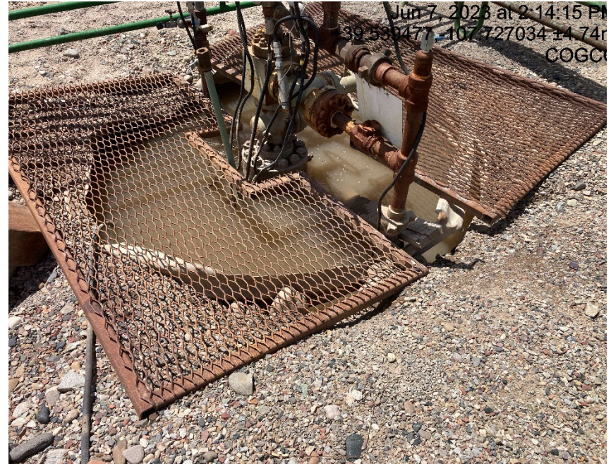
Well head bubbling and open cellar