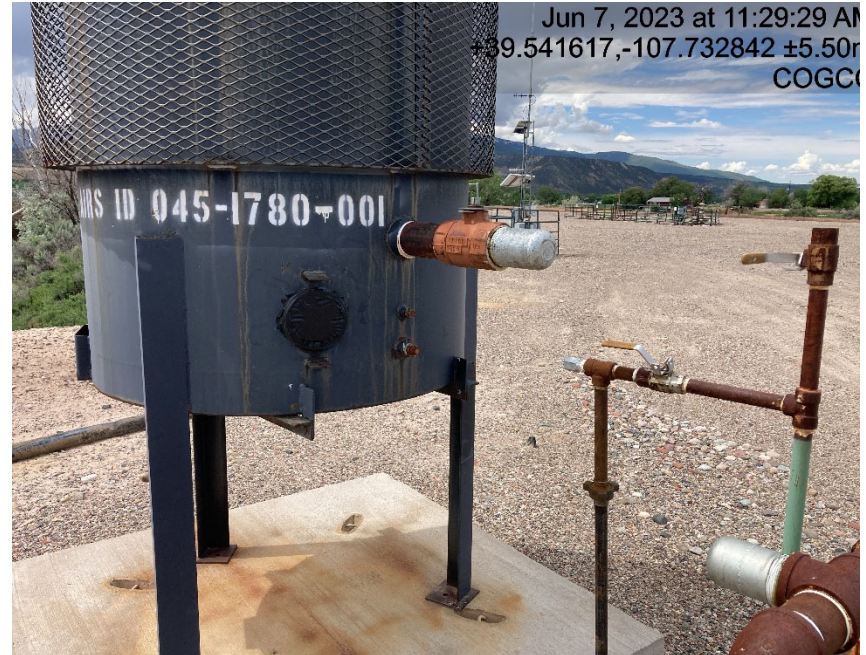
Recent inspection of stored equipment