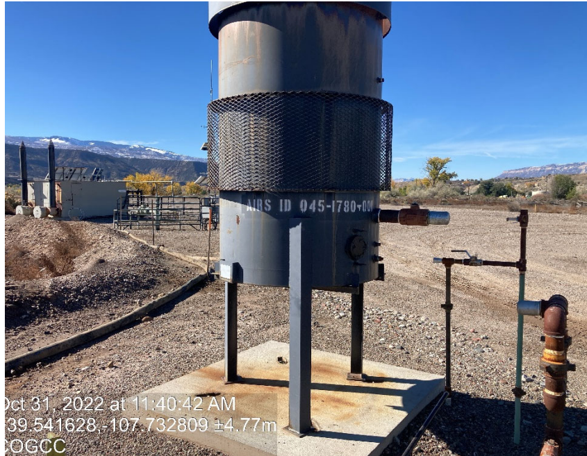
Stored equipment from previous inspection document # 700704667