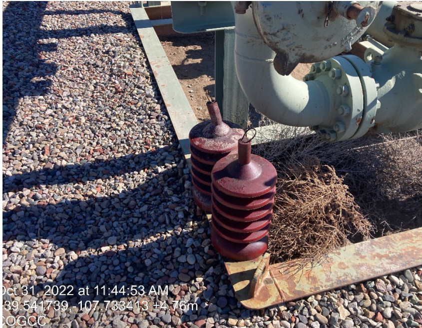
Debris from previous inspection document # 700704667