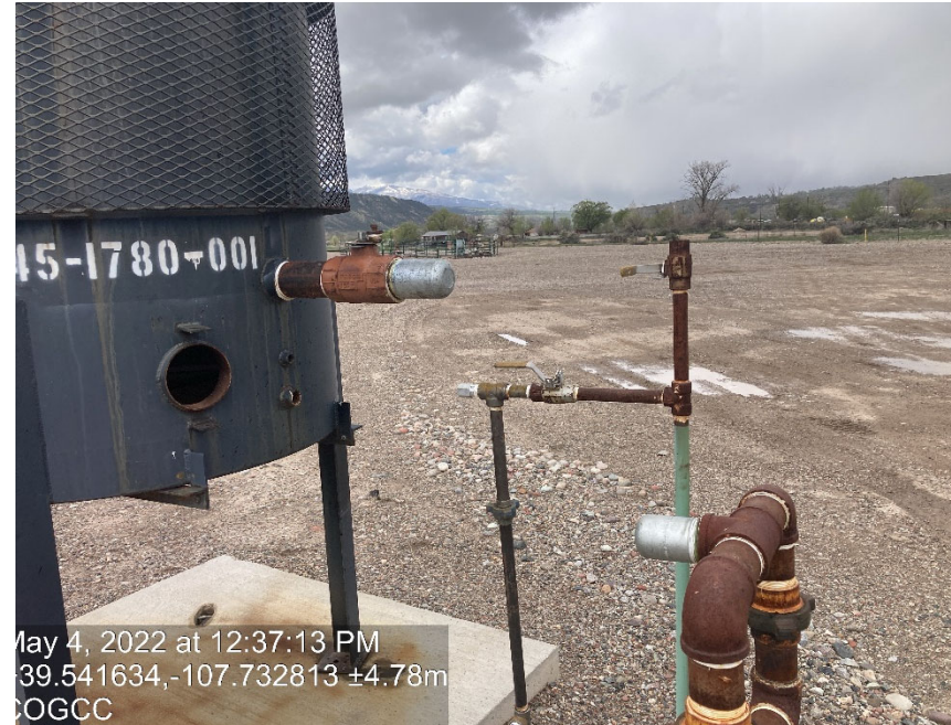
Stored equipment from 2 inspections ago document # 700704161