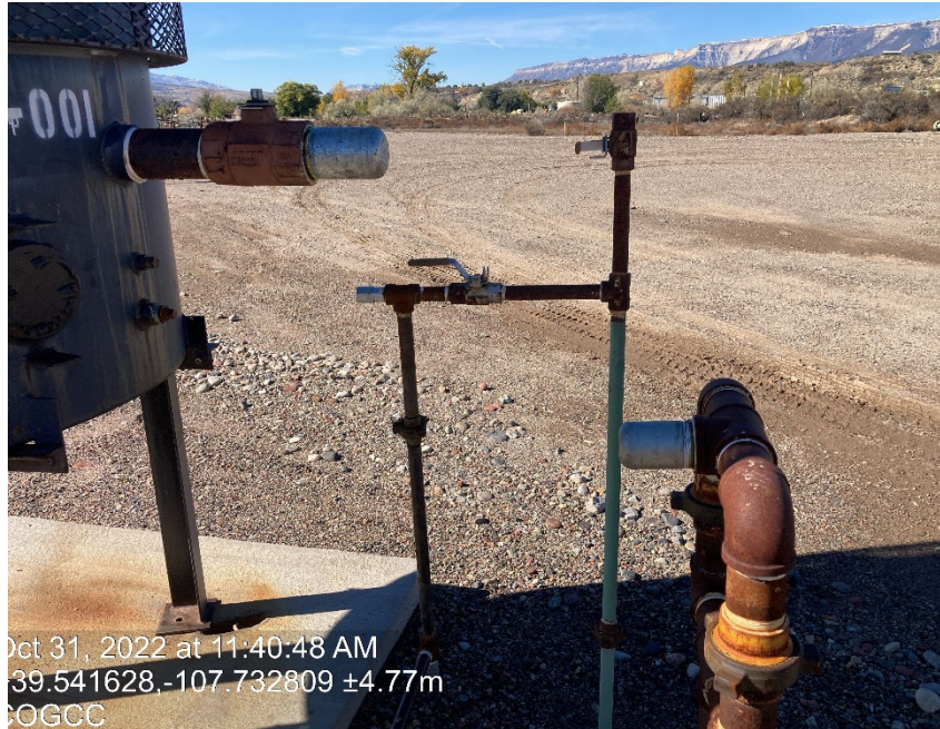
Stored equipment from previous inspection document # 700704667