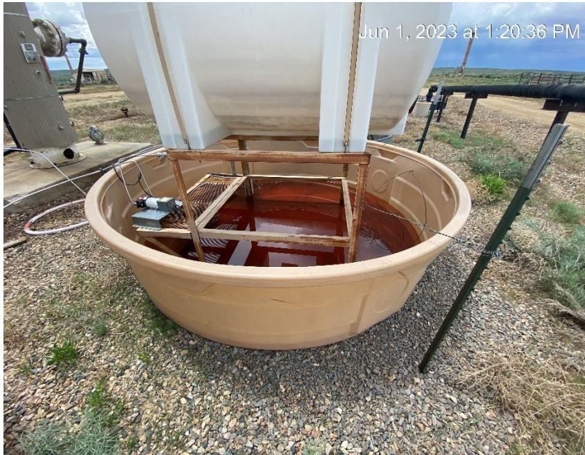
Open to wildlife and containing liquid