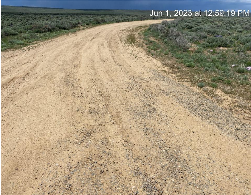
Access road to location