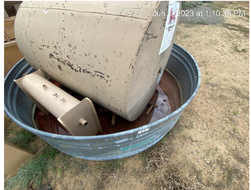
Open to wildlife with liquid