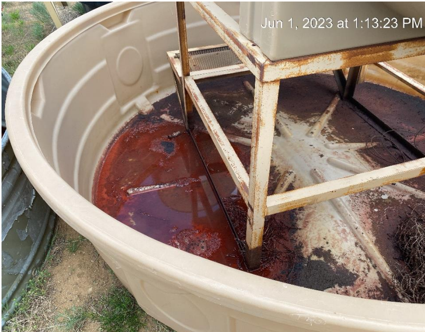
Containment open to wildlife