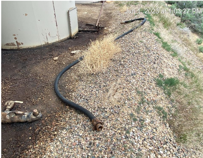
Debris. Tank battery soil staining