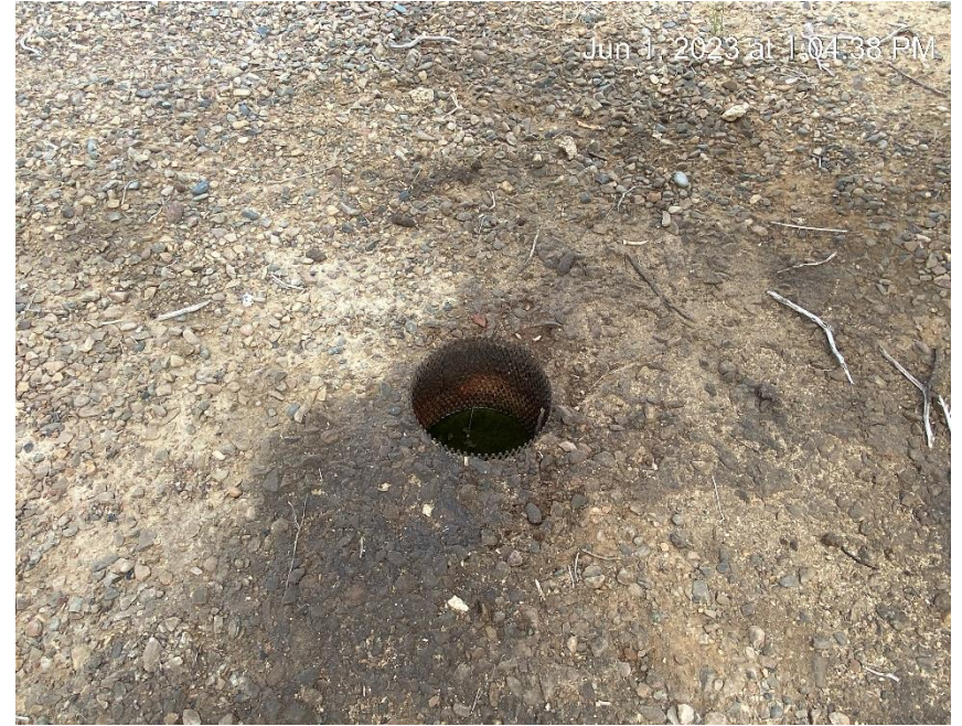
Open to wildlife