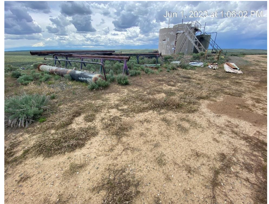
Unused equipment storage