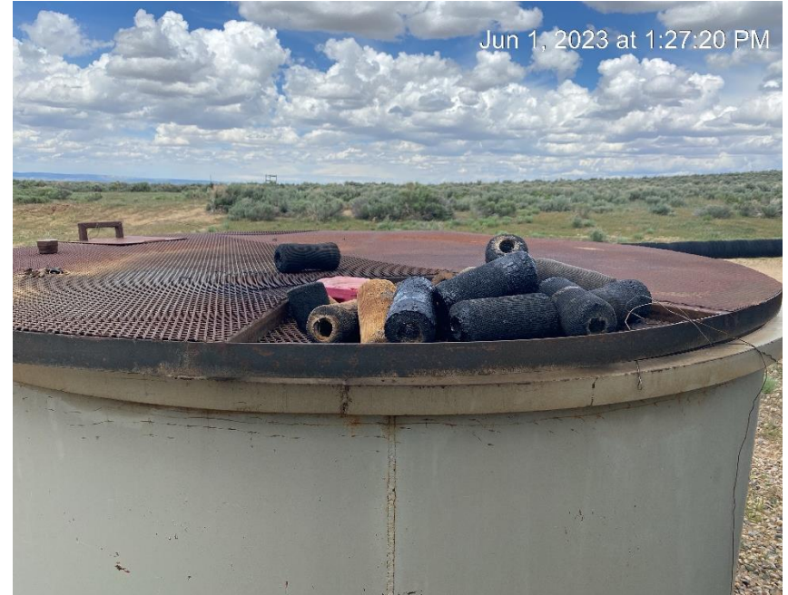
Oily debris not properly stored.