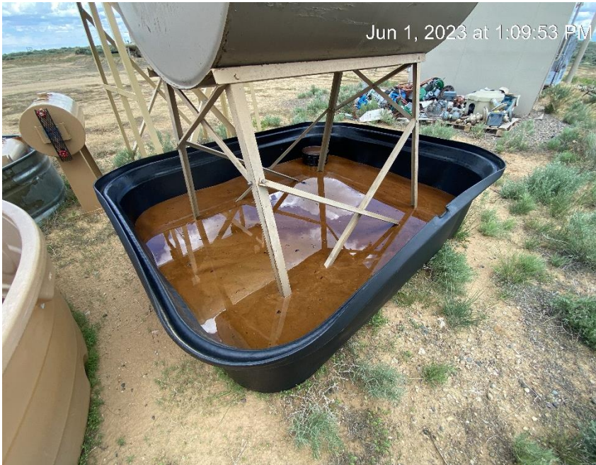
Contaminated liquid and open to wildlife