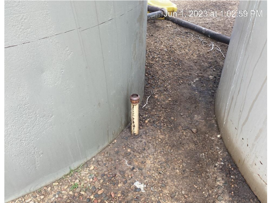
Line open to wildlife. Soil staining