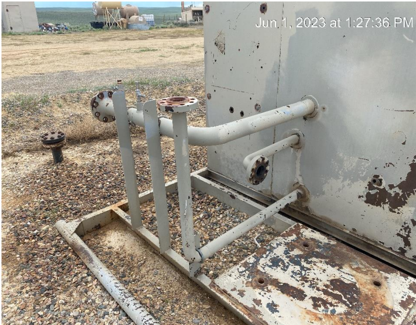
Unused equipment. Open to wildlife.