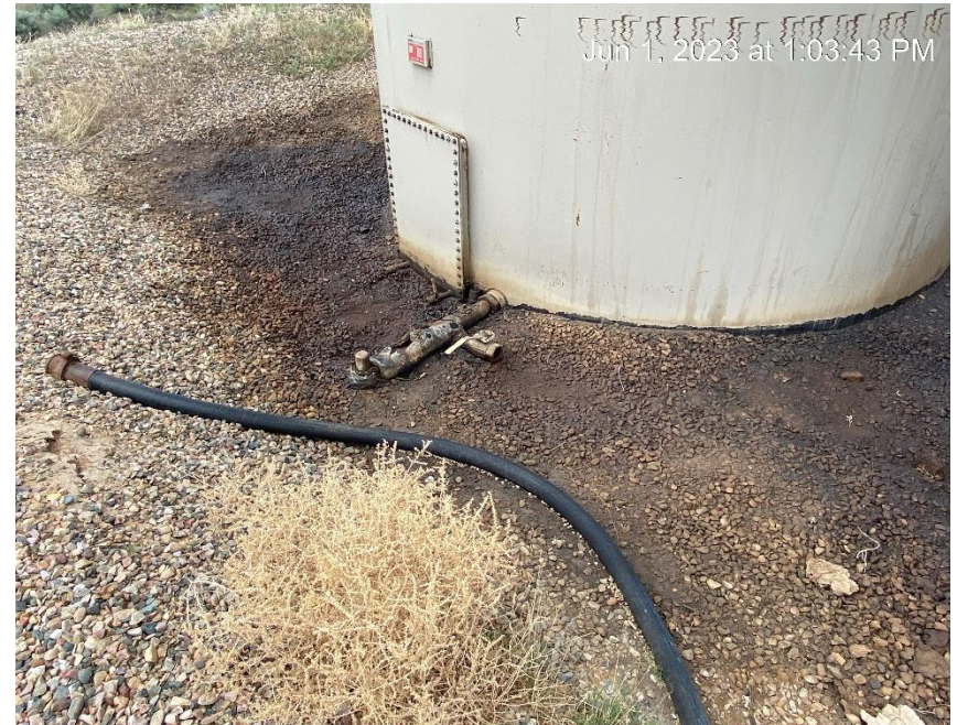
Staining. Open end tank valve