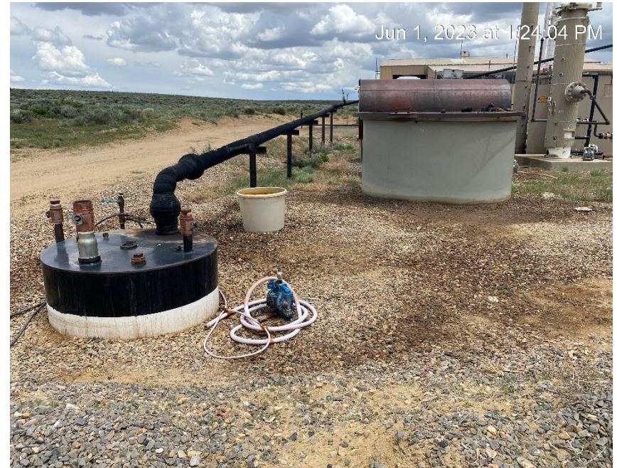
Unused equipment. Soil staining.