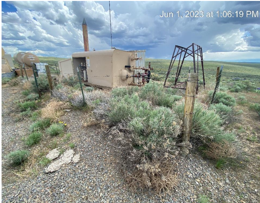
Separator and unused equipment