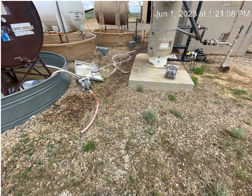
Debris. Oil stains. Containments open to wildlife and containing contaminated liquids