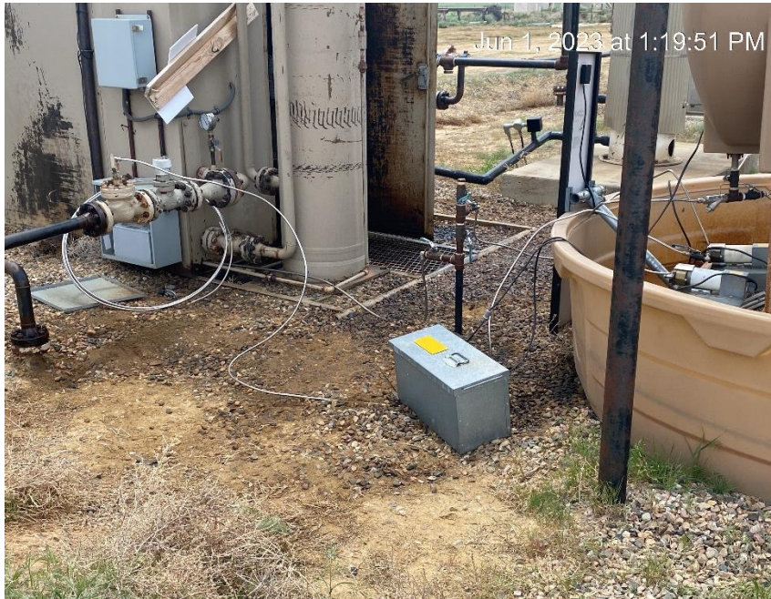
Debris. Stained soils