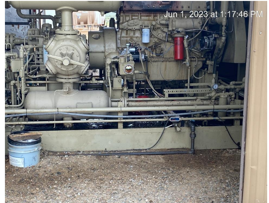
Oil underneath equipment. Stained soil