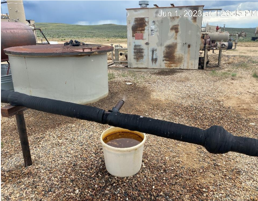
Stained soil. Open top container open to wildlife