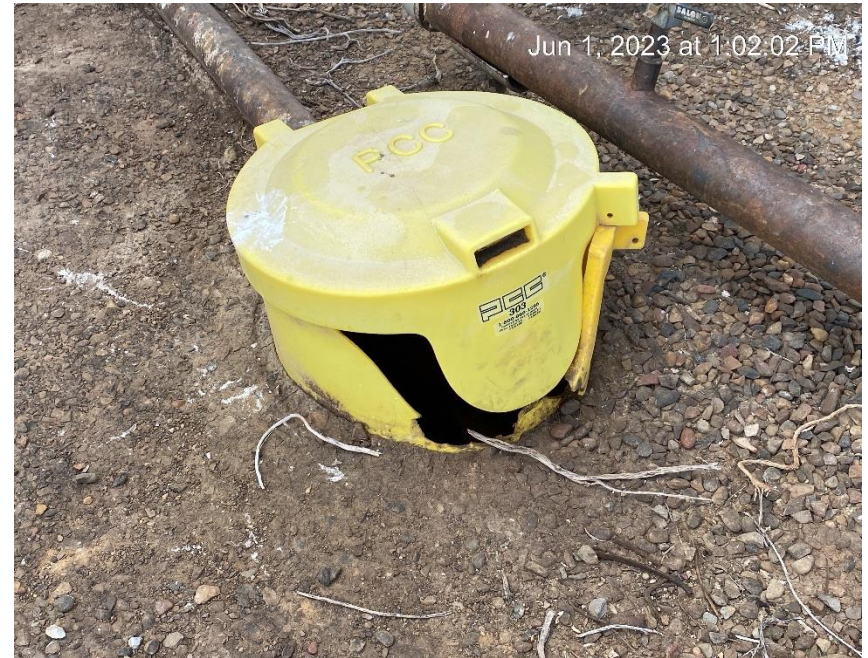
Open to wildlife. Open end loadline.