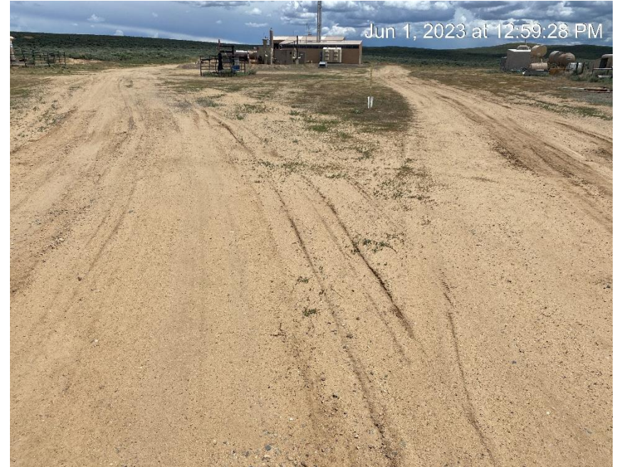
Entrance to location