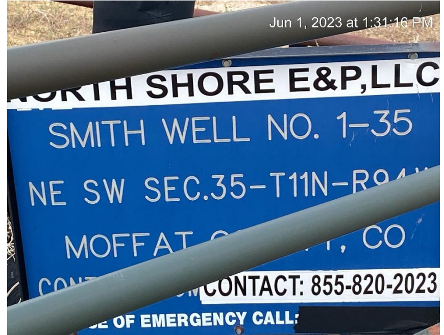
Sign at wellhead