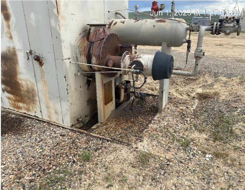
Stained soil. Burner openings open to wildlife. Not in service.