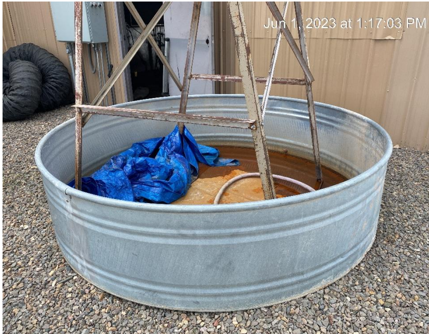
Open top tank open to wildlife