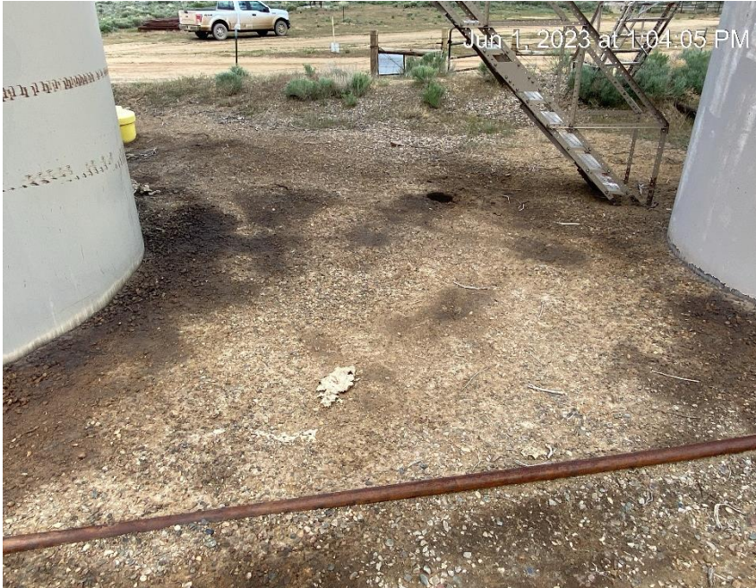
Tank battery soil staining