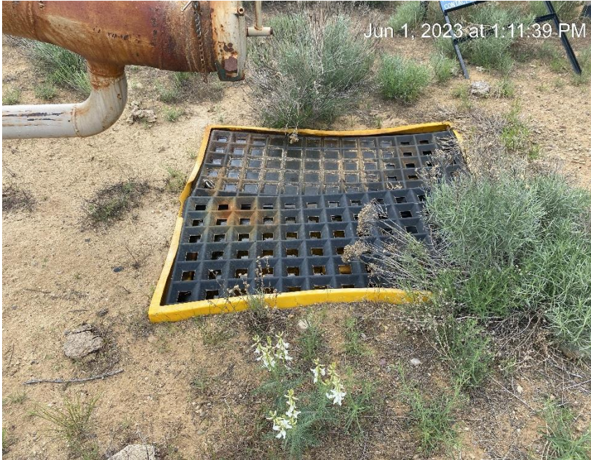
Catch containment full of liquid