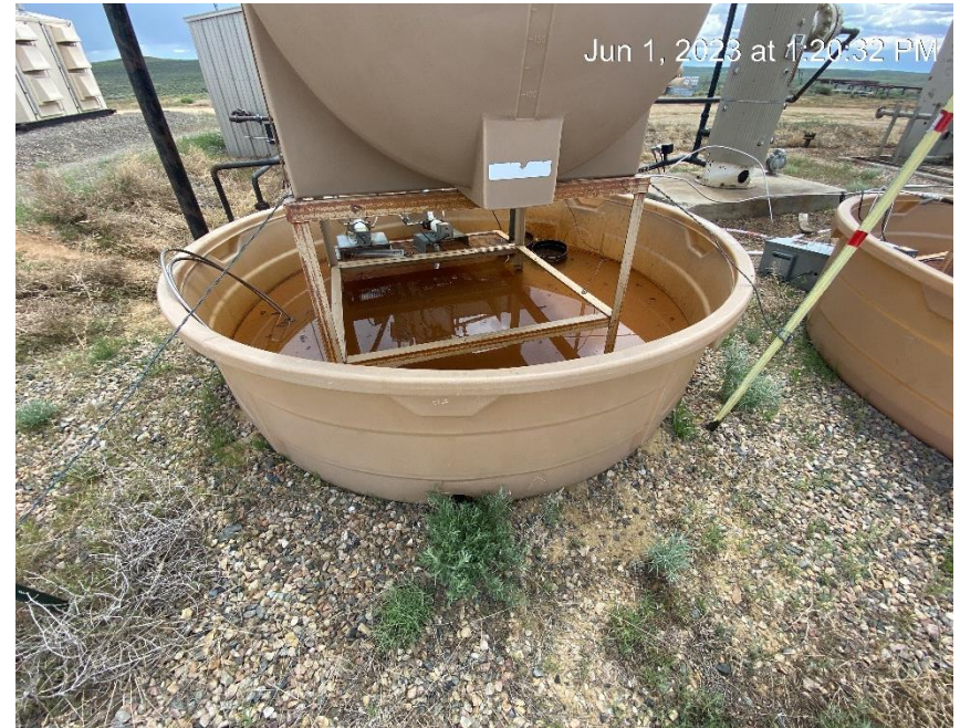
Open to wildlife and containing liquid