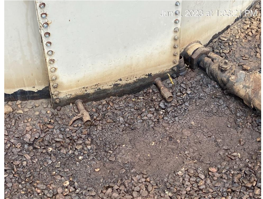
Open end tank valves. Stained soil