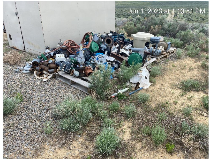
Unused equipment storage