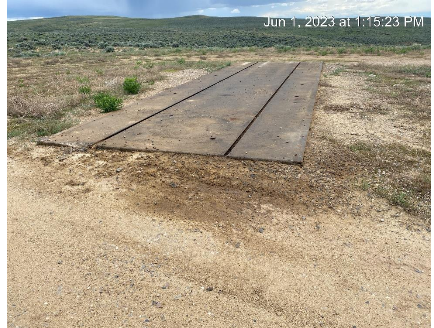
Stained equipment and soil. Equipment not in use.