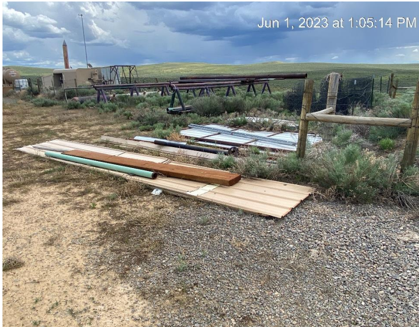
Unused equipment storage