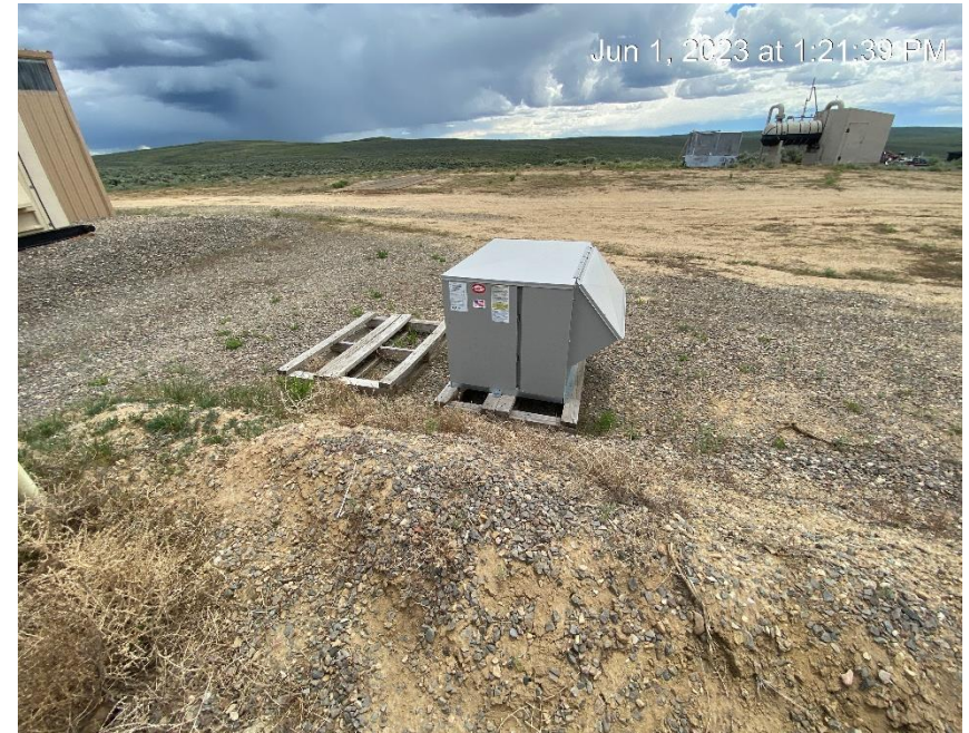
Unused equipment storage