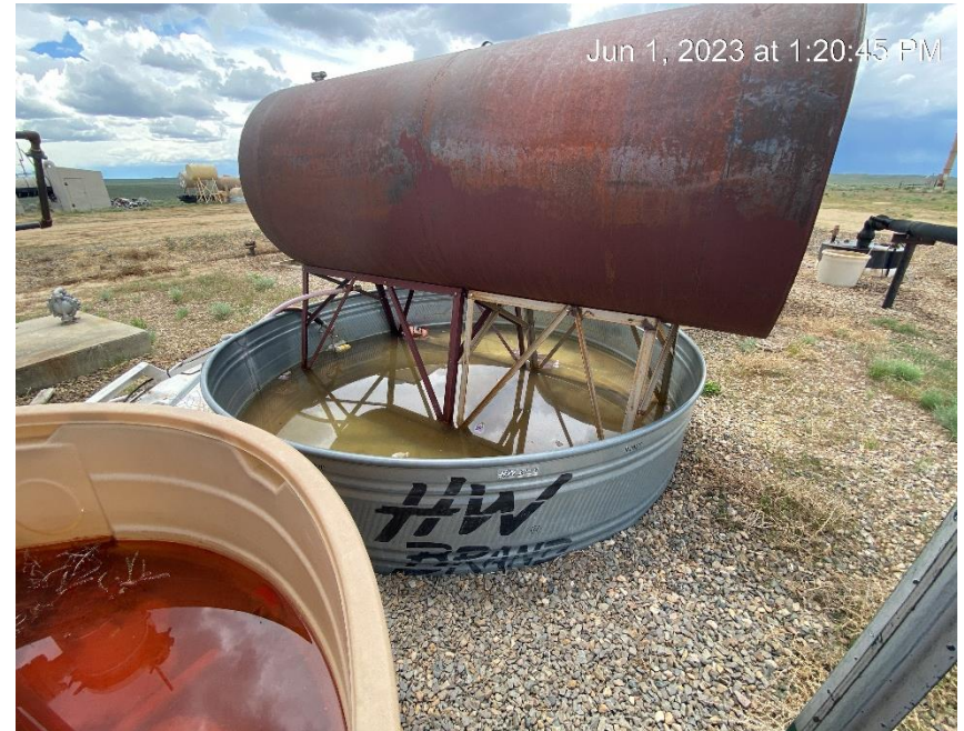
Open to wildlife and containing liquid