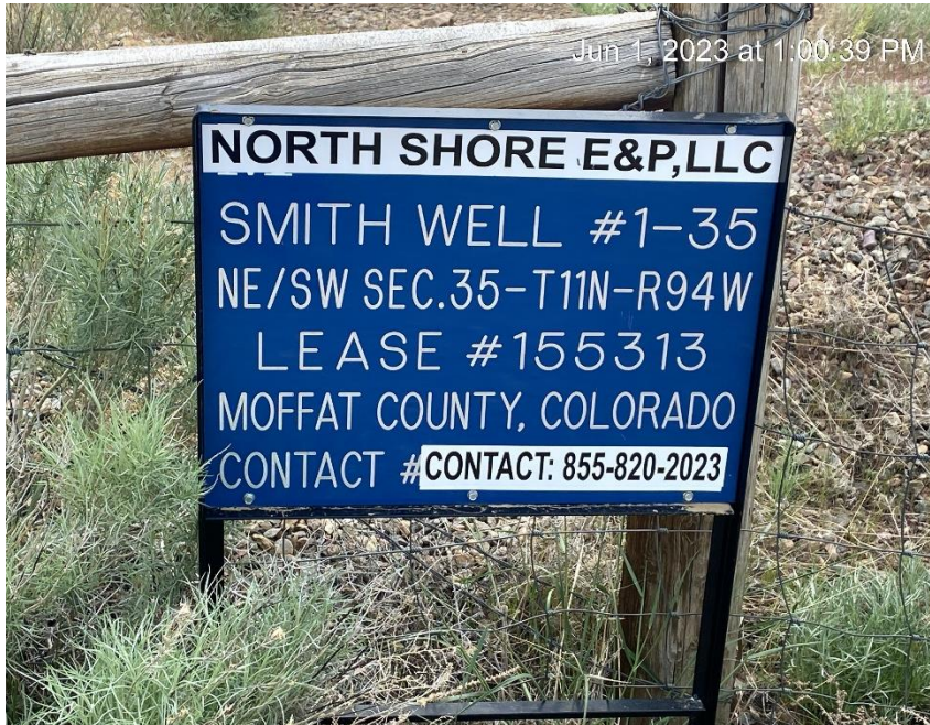
Sign at tank battery