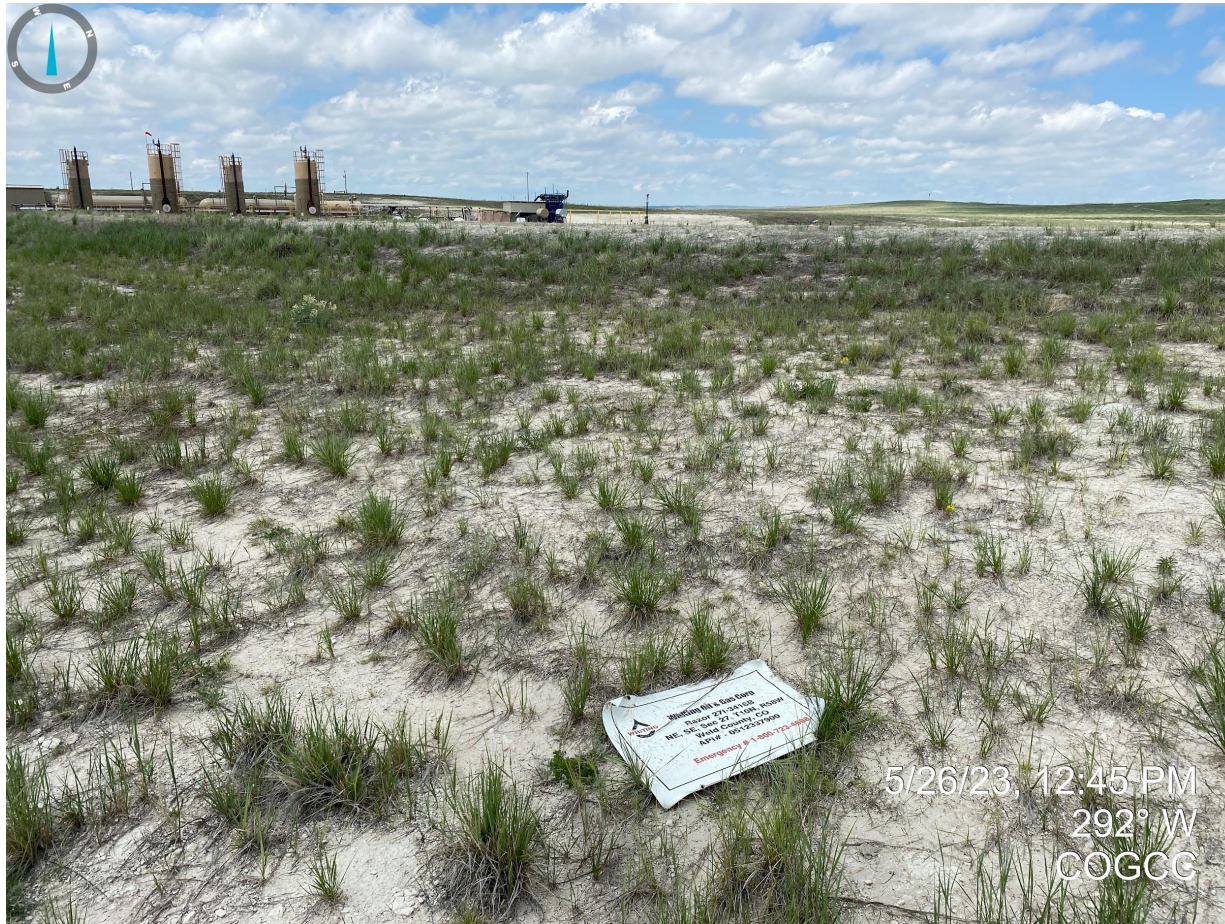
Photo 8. Eastern side of location. See comments in Photo 7.