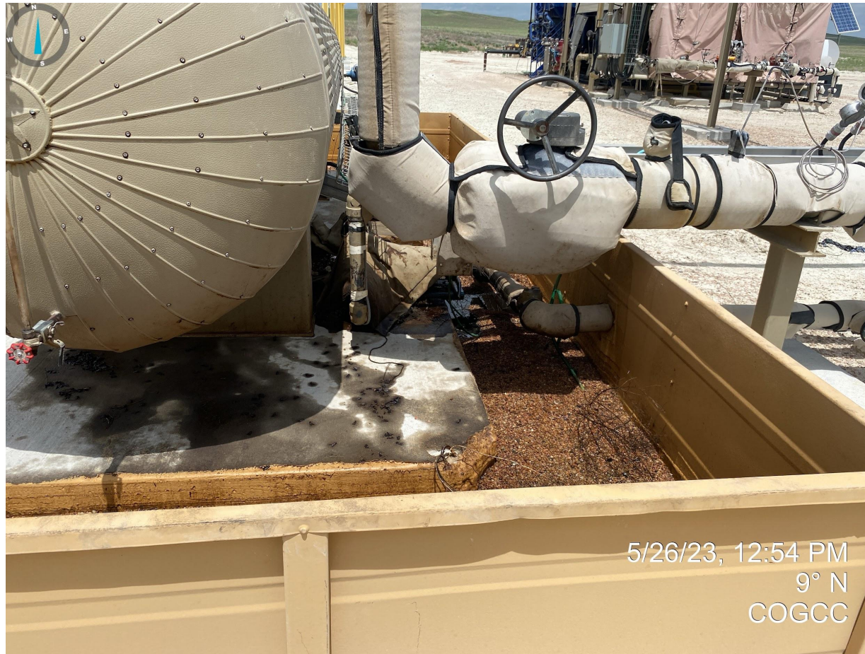
Photo 10. Apparent hydrocarbon leak observed within secondary containment on the west side of the location. Properly dispose of oily waste in accordance with 905.e. Additionally, Securely fasten all valves, pipes, fittings, and Production Facilities to ensure good mechanical condition, inspect at regular intervals and maintain in good mechanical condition per Rule 608.e.