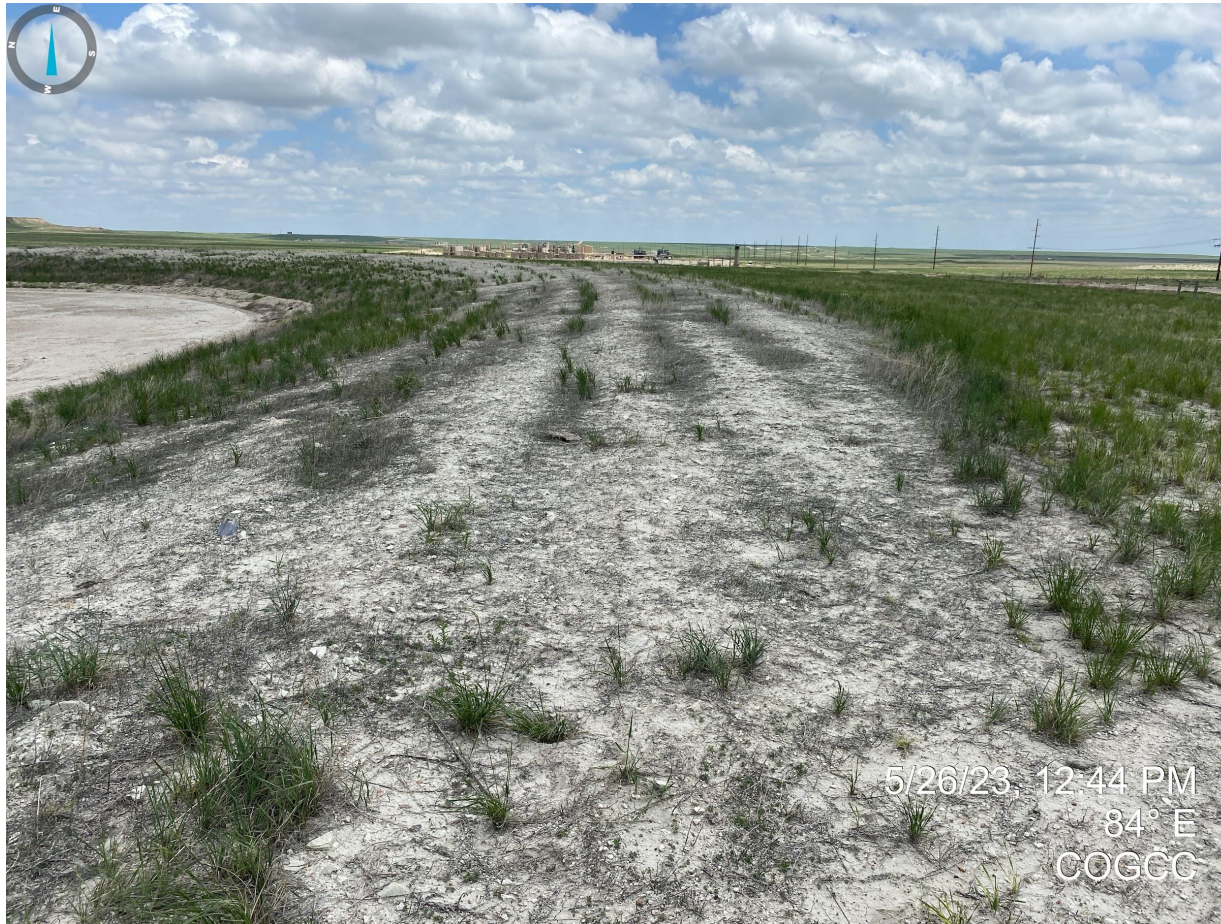
Photo 1. Southern interim/topsoil stockpile. During this inspection Staff observed that the interim areas are not progressing towards reclamation standards with evidence of non-uniform vegetation cover resulting in areas of bare soil and undesirable vegetation (e.g. kochia) was observed growing throughout. Additional reclamation activities are required in order to meet Rule 1003 standards.