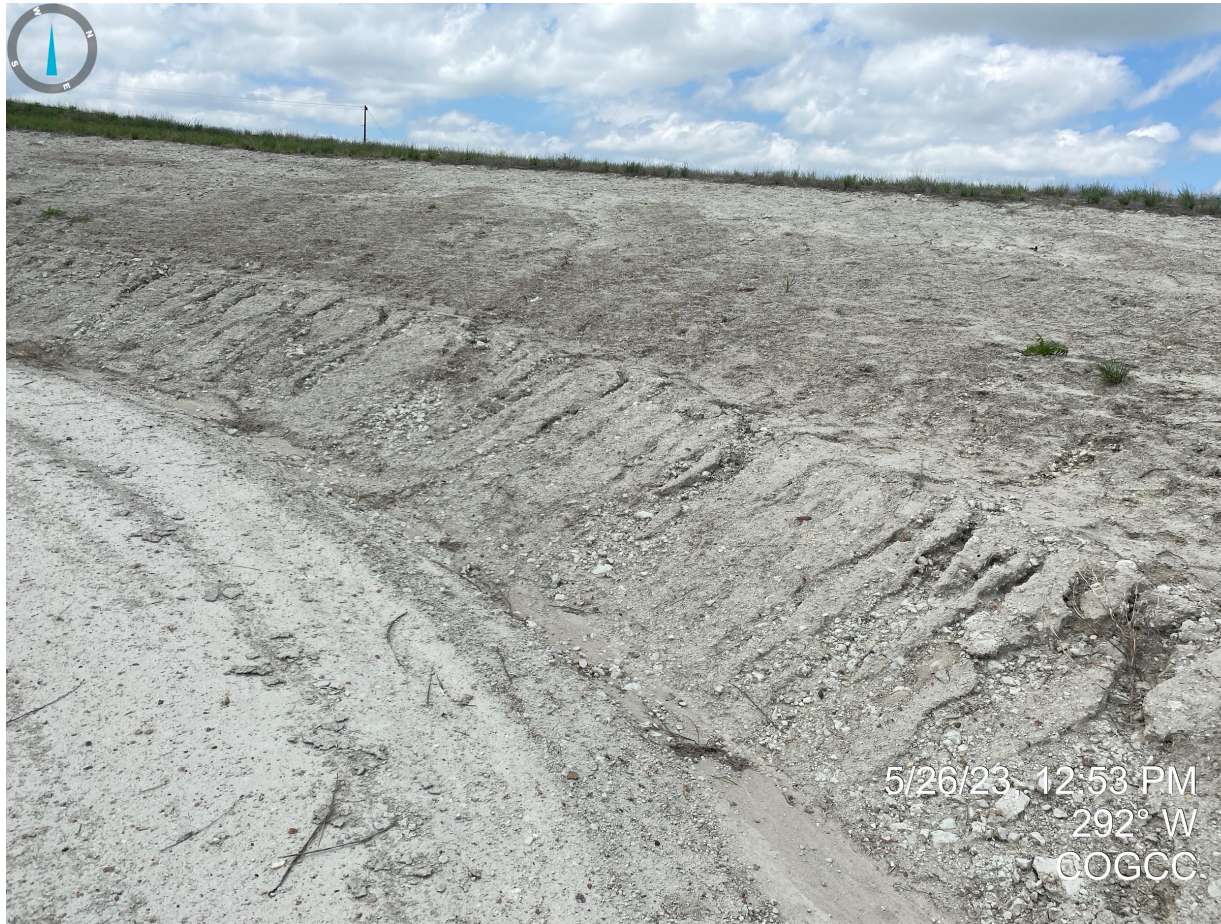
Photo 6. During this inspection, Staff observed that cut banks towards the northwest corner of the location are experiencing rill erosion and do not appear to be properly stabilized. Repair/maintenance of stormwater BMPs should be implemented to stabilize the areas experiencing erosion.