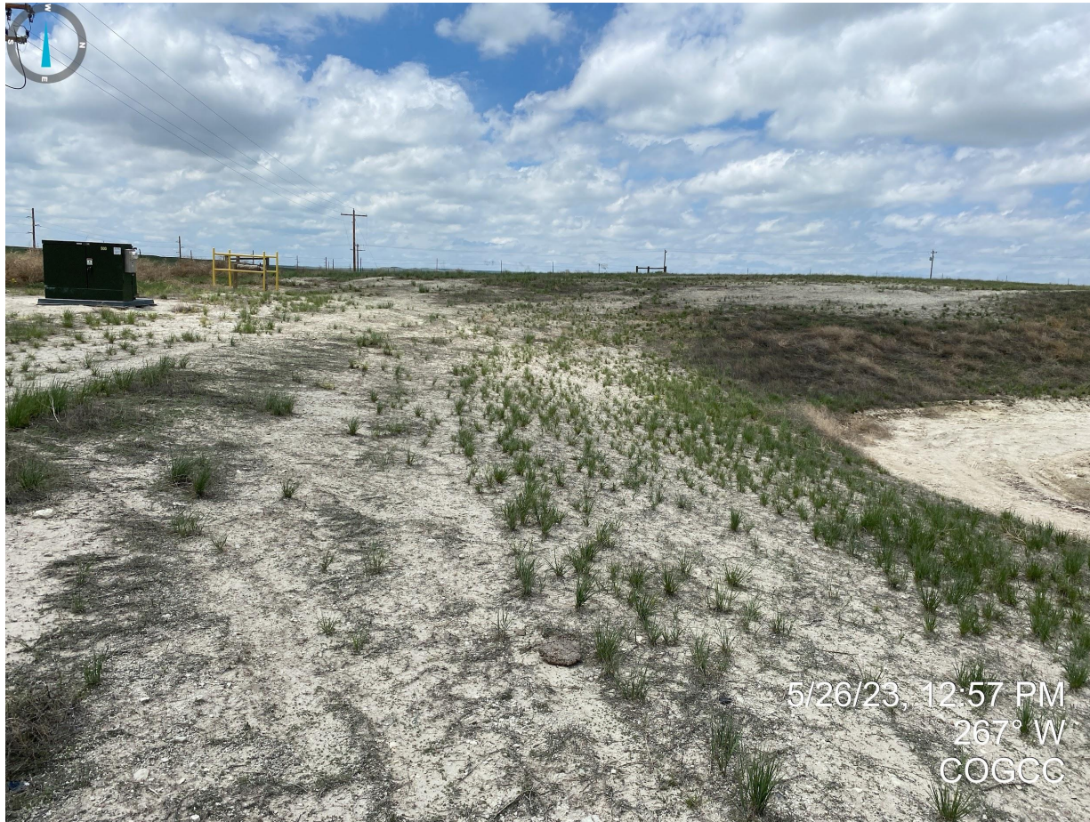
Photo 5. Southern Interim areas. See comments in Photo 1.