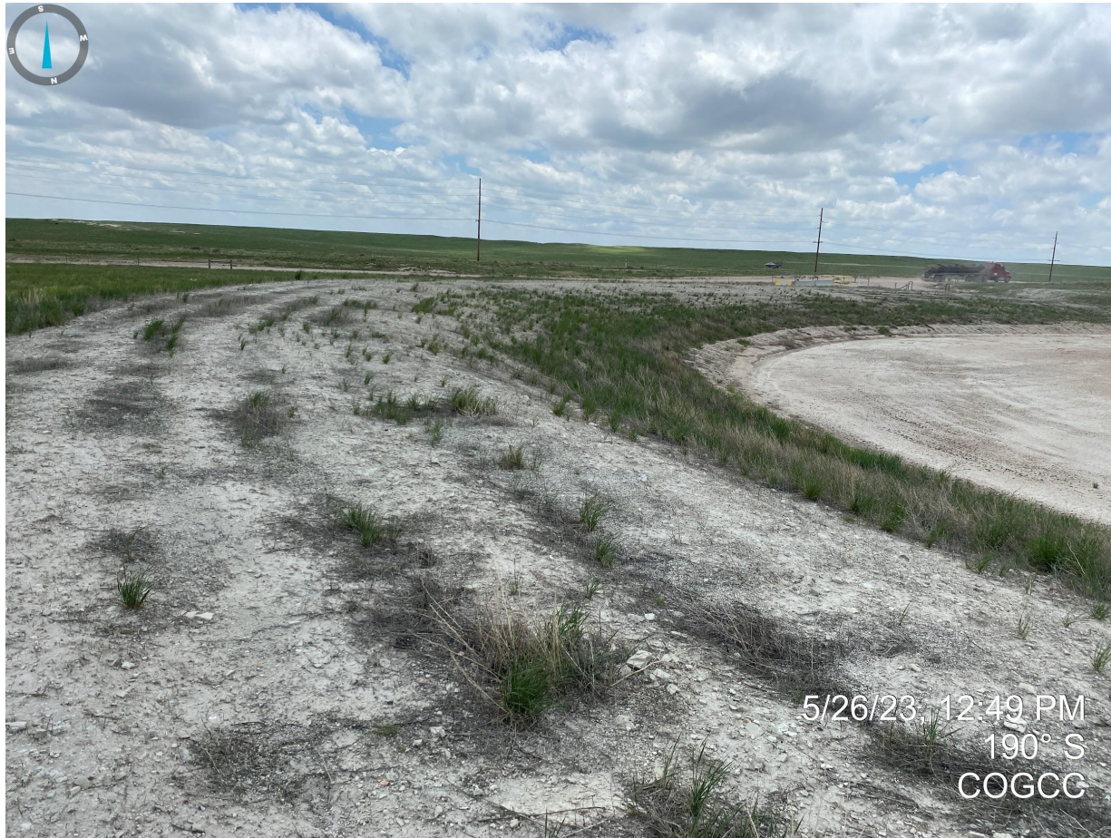
Photo 2. Topsoil stockpile. See comments in Photo 1.