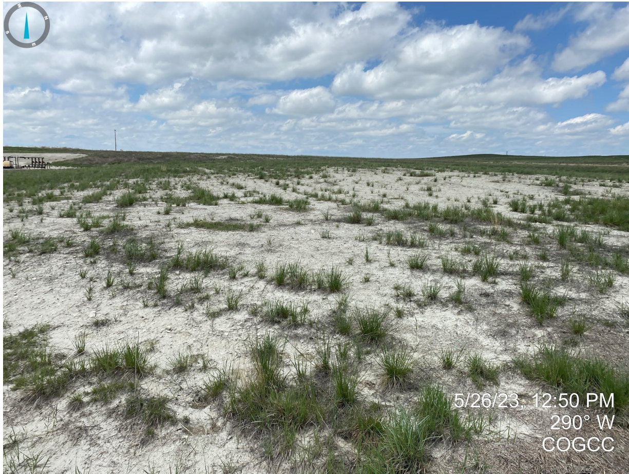
Photo 4. Northern interim area. See comments in Photo 1.