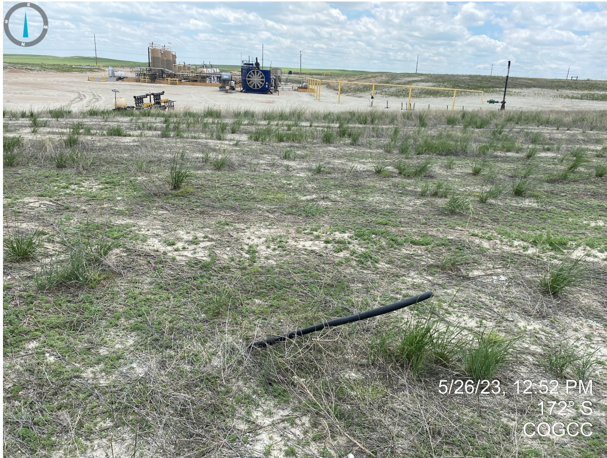
Photo 7. Northern end of location. Debris observed during this inspection will need to be removed. Unmarked hose/tubing coming from ground.