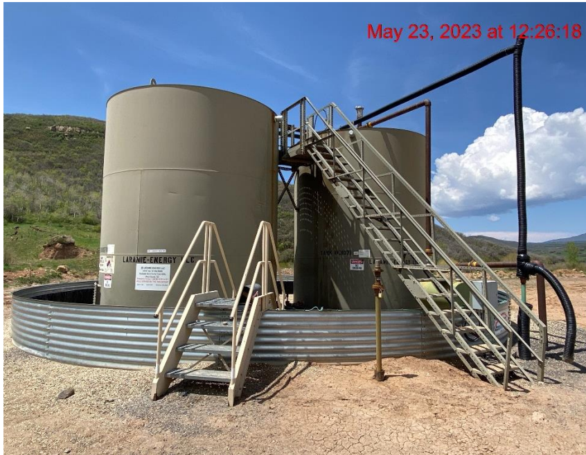
Tank Battery – Photo #03820