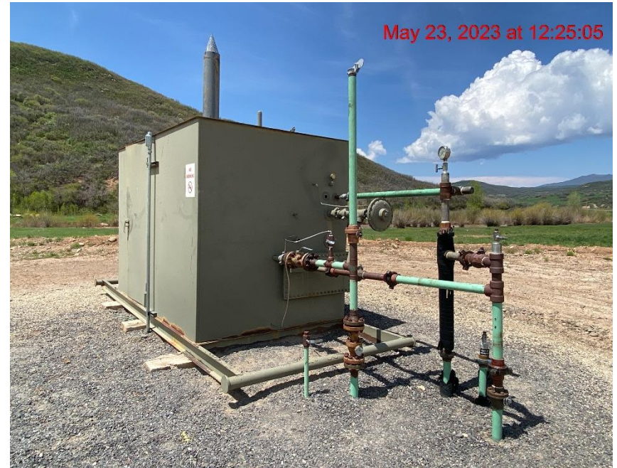
Separator – Photo #03817