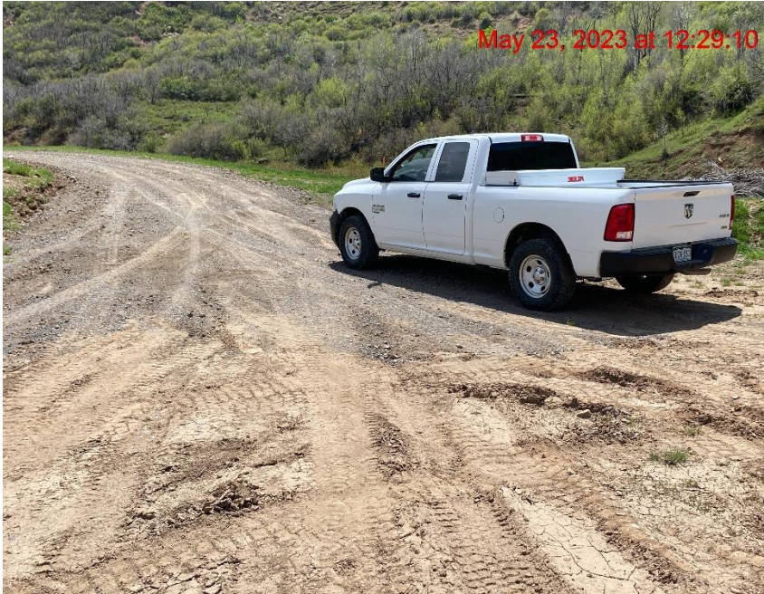
Insufficient Vehicle Tracking BMPs at Location Entrance/Exit – Photo #03829