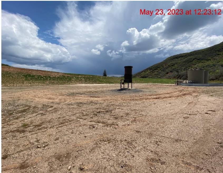
NW Corner of Location – Photo #03812