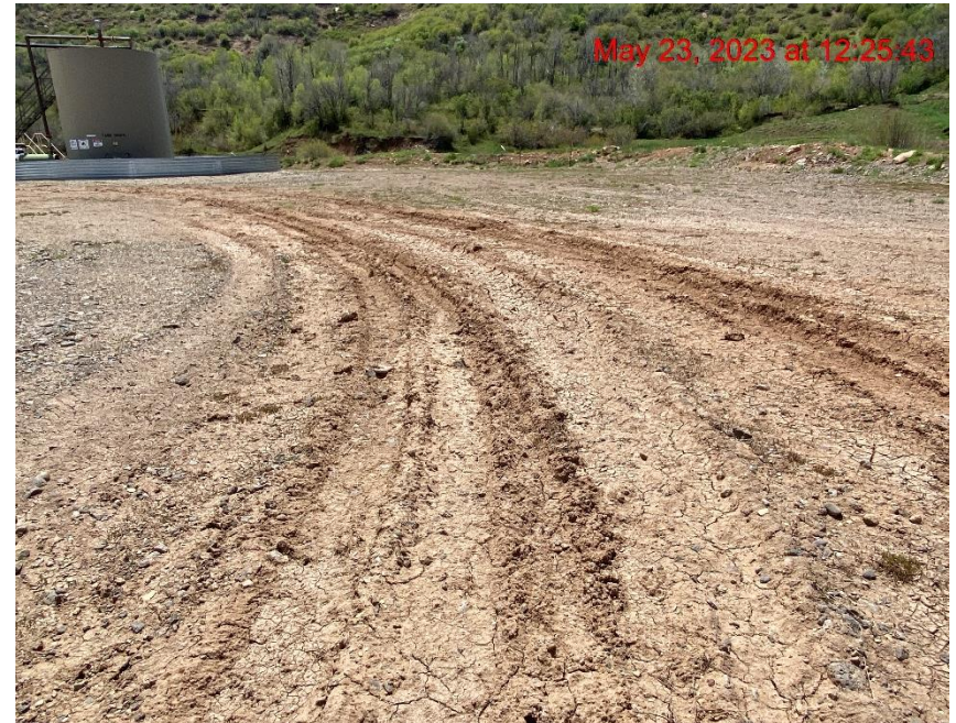
Location Lacks Stabilization – Photo #03819