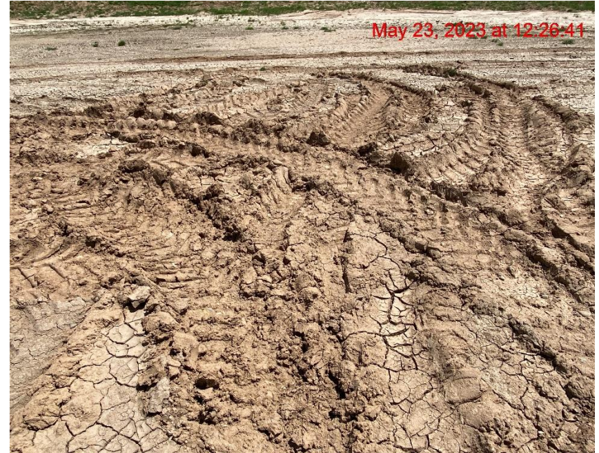
Location Lacks Stabilization – Photo #03822