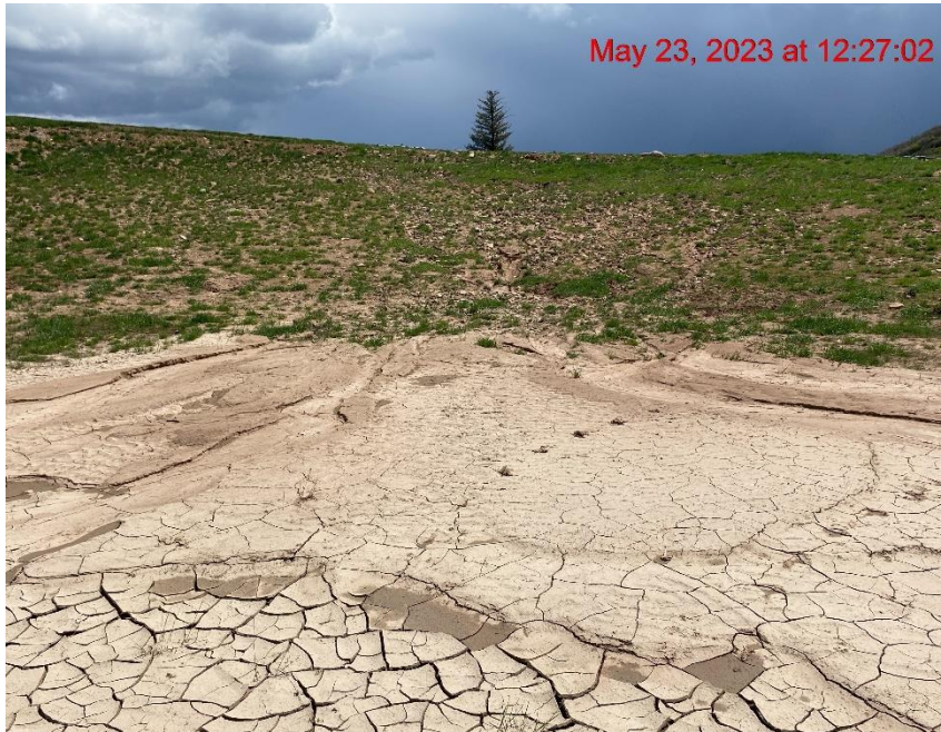
Rill Erosion Transporting Sediment onto Location – Photo #03823