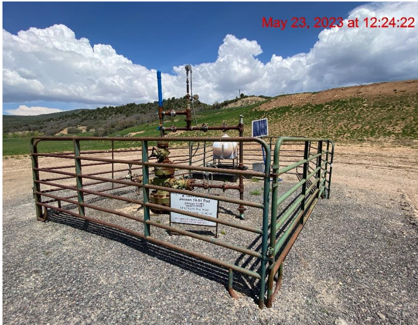
Wellhead – Photo #03814