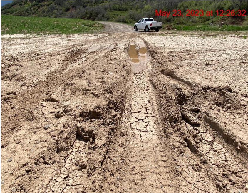
Location Lacks Stabilization – Photo #03821