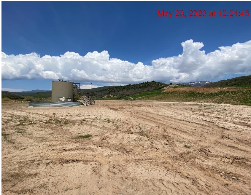
SW Corner of Location – Photo #03810