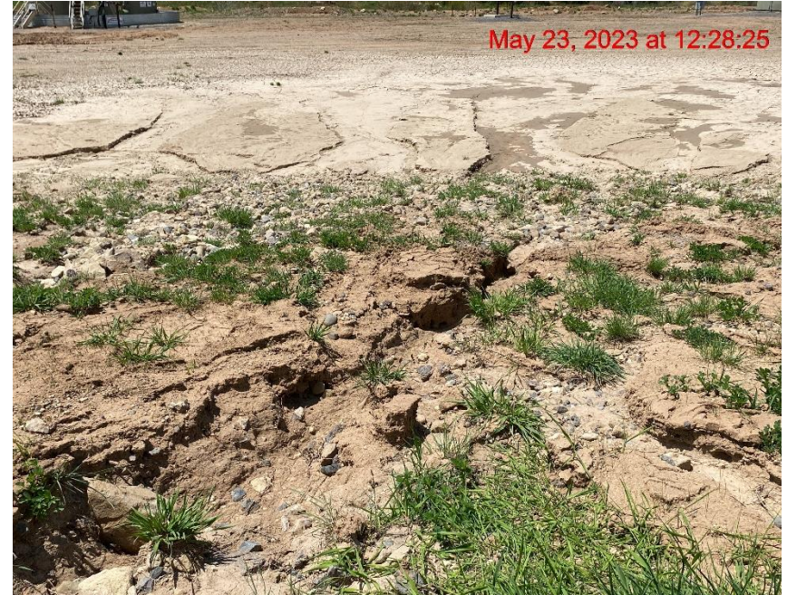
Rill Erosion Transporting Sediment onto Location – Photo #03828