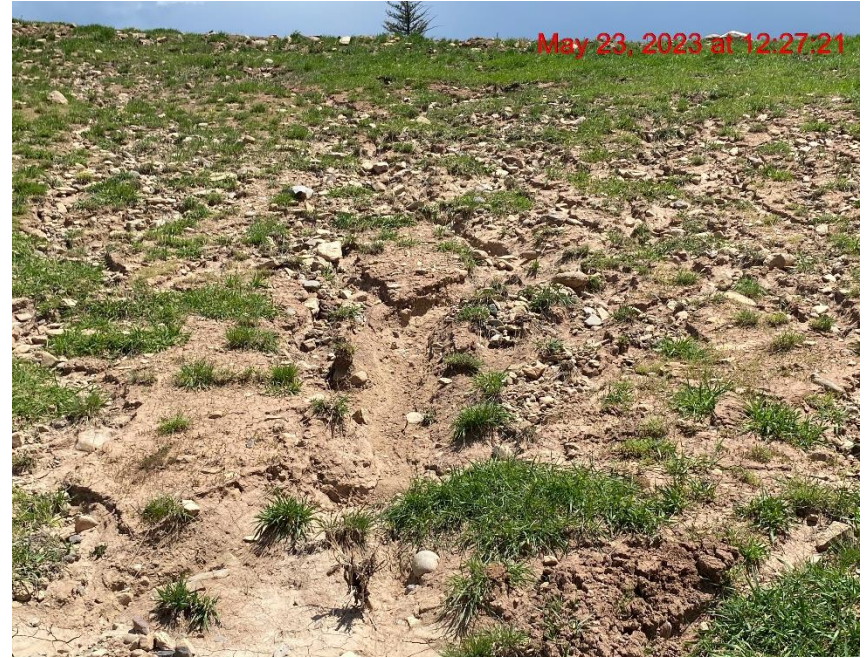
Rill Erosion Transporting Sediment onto Location – Photo #03824