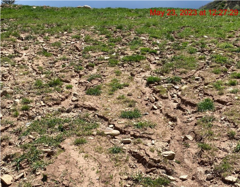
Rill Erosion Transporting Sediment onto Location – Photo #03825