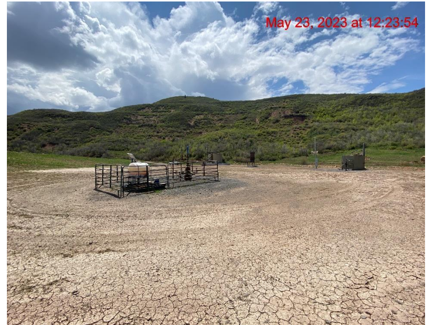
NE Corner of Location – Photo #03813