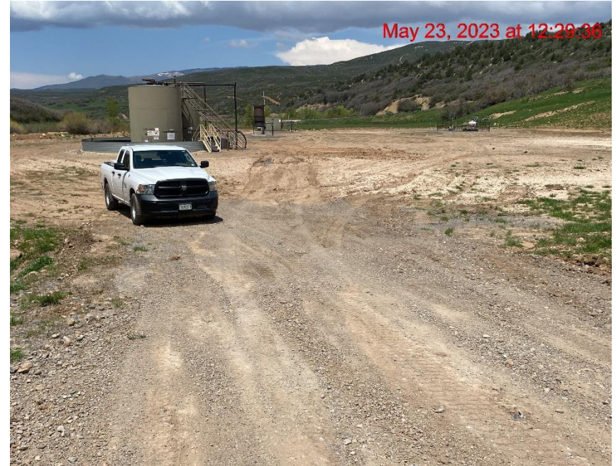
Insufficient Vehicle Tracking BMPs at Location Entrance/Exit – Photo #03830