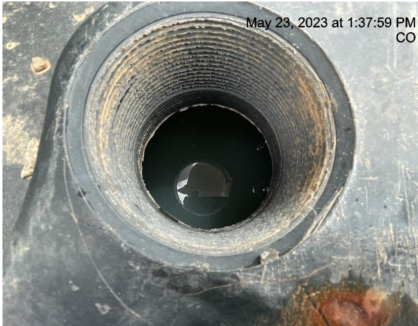
Photo # 8442 Chemical tank containment 1 full of fluid/failure to maintain chemical BMP's