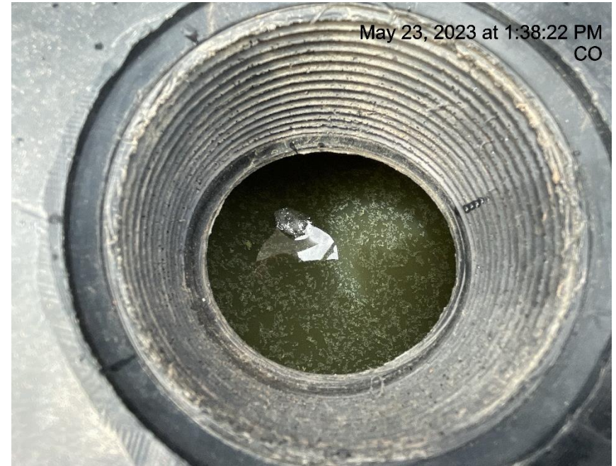
Photo # 8447 Chemical tank containment 2 full of fluid/failure to maintain chemical BMP's