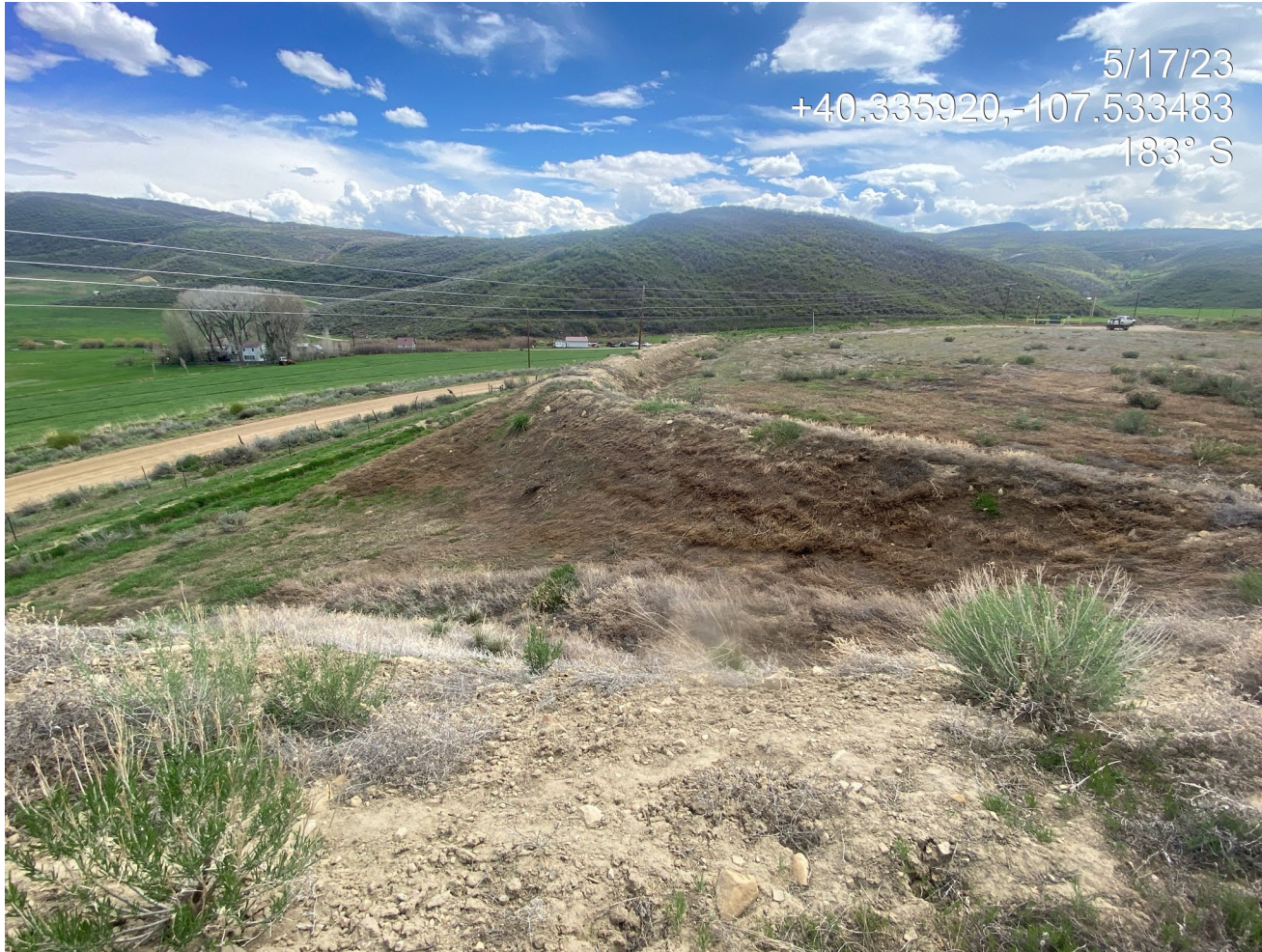
Photo 2. Photo taken from the northeast shows an overview of the southern/fill portion of the location.