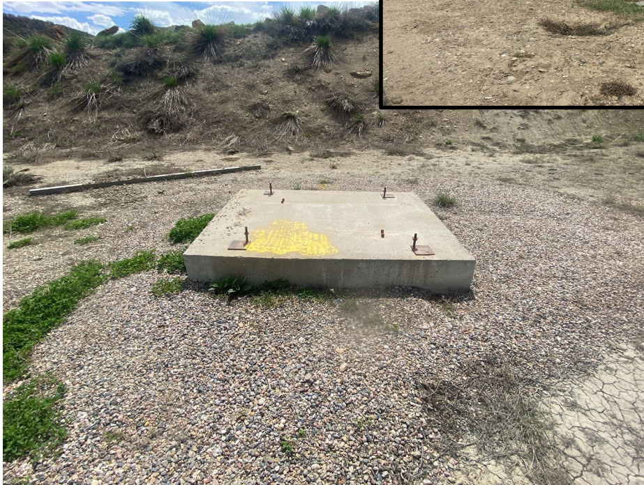
Photo 1. Photos show equipment remaining on location.