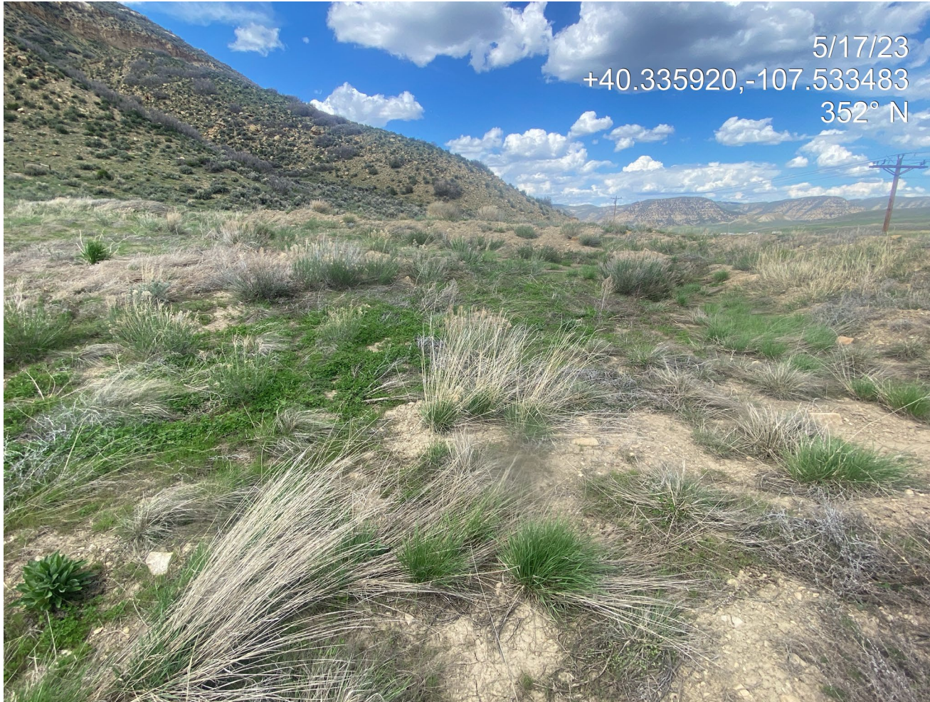
Photo 4. Photo taken from the northeast shows an overview of the eastern/more recently expanded portion of the location.