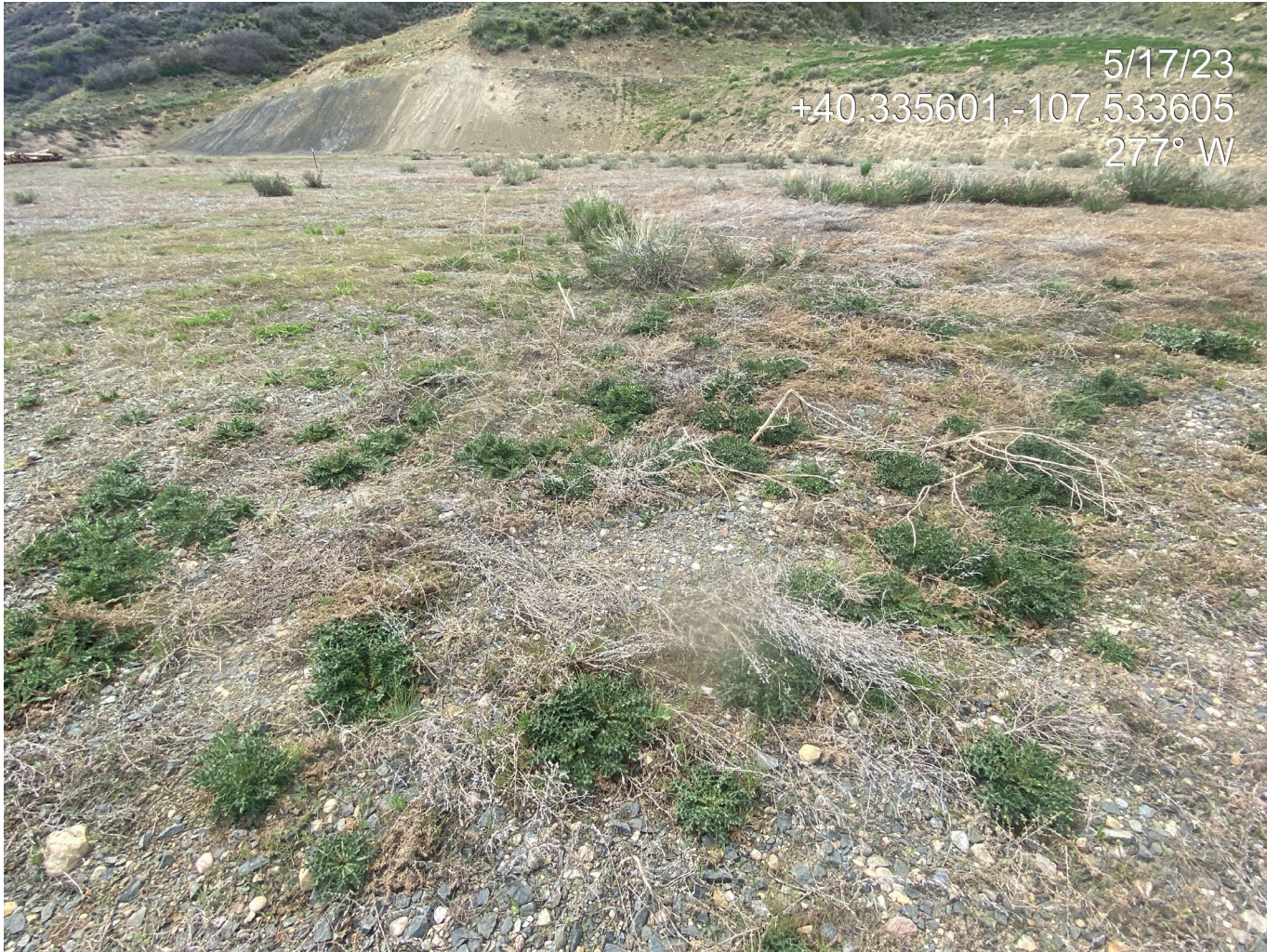
Photo 10. Photo shows noxious weeds (bull and musk thistle) and undesirable plant species/weeds (Russian thistle).