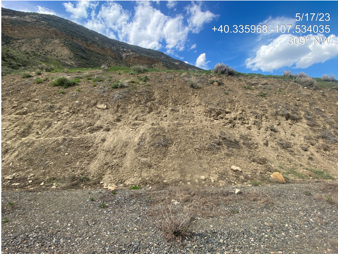
Photo 7. Photo show the cut slope at the north of the location. The location has not been recontoured, slopes are bare, unvegetated and unstabilized.