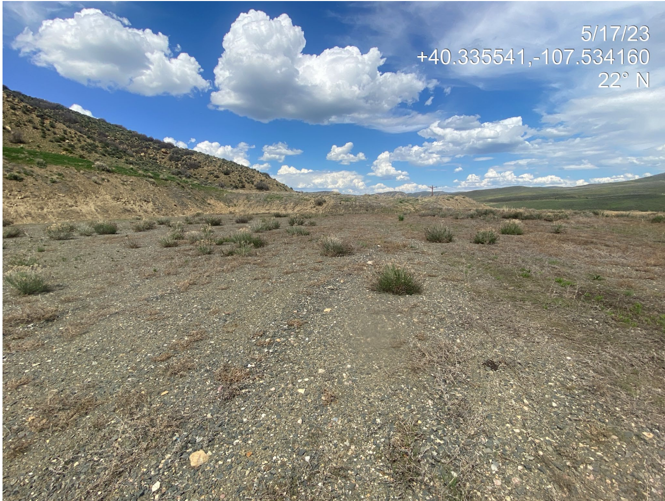
Photo 6. Photo shows the cut slope at the north of the location. The location has not been recontoured, slopes are bare, unvegetated and unstabilized.