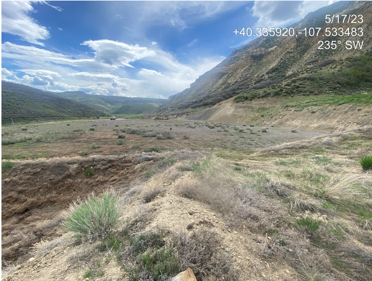
Photo 3. Photo taken from the northeast shows an overview of the northern/cut portion of the location.