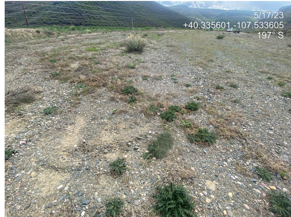
Photo 9. Photo shows the pad surface, fill slopes and berms are colonized by noxious weeds (bull, musk thistle, houndstongue and cheatgrass) and undesirable plant species/weeds (Russian thistle).