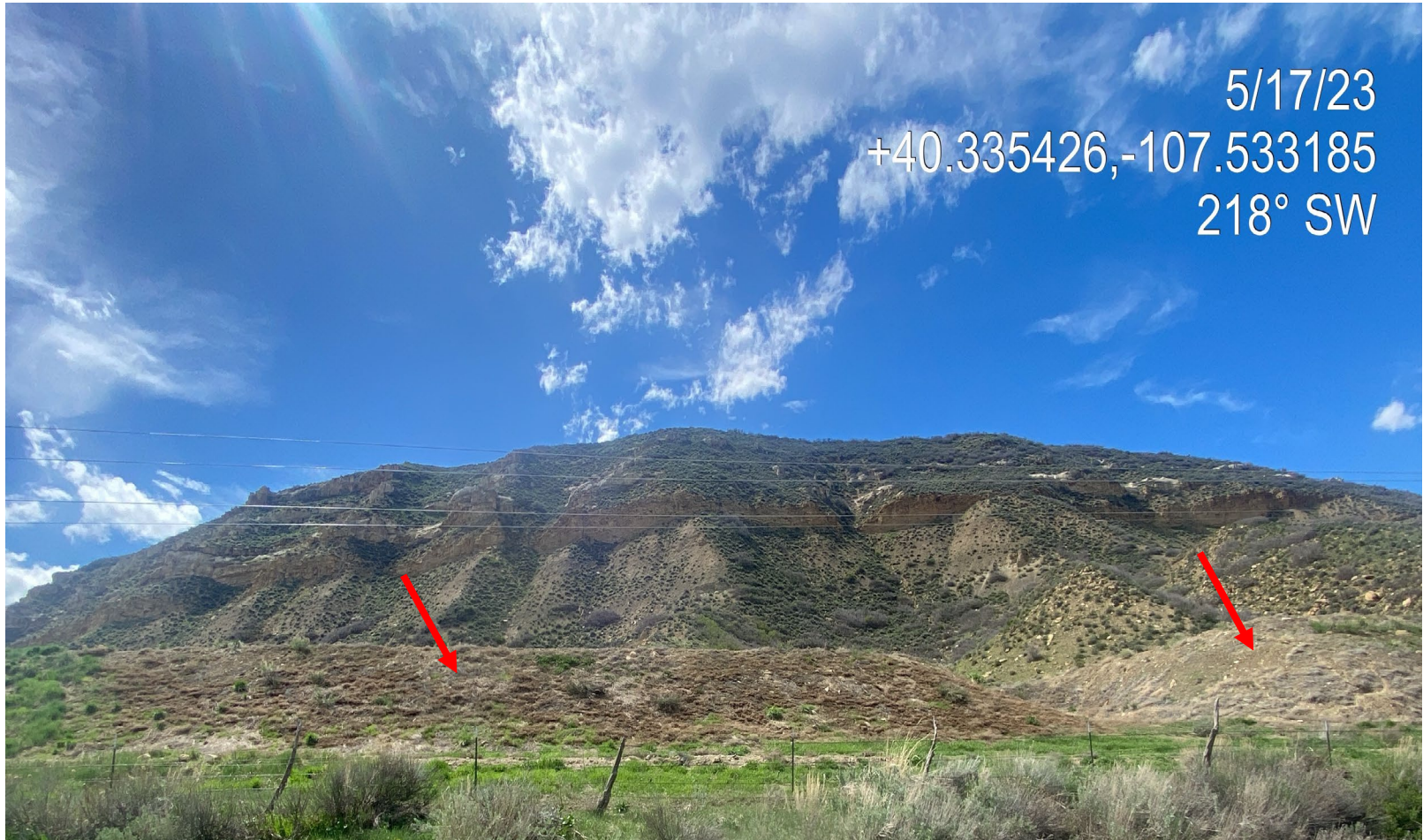
Photo 8. Photo taken from the county road to the south shows an overview of the fill slopes. The location has not been recontoured, slopes are bare, unstabilized and unvegetated or colonized by undesirable plant species/weeds.