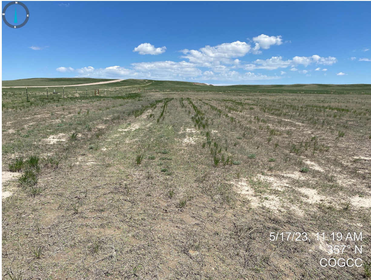
Photo 1. Some desirable vegetation establishment observed throughout the interim areas, however, the reclaimed portions are predominantly undesirable vegetation (e.g. kochia) that will need to be managed. This location does not appear to be progressing towards Rule 1003 Standards.