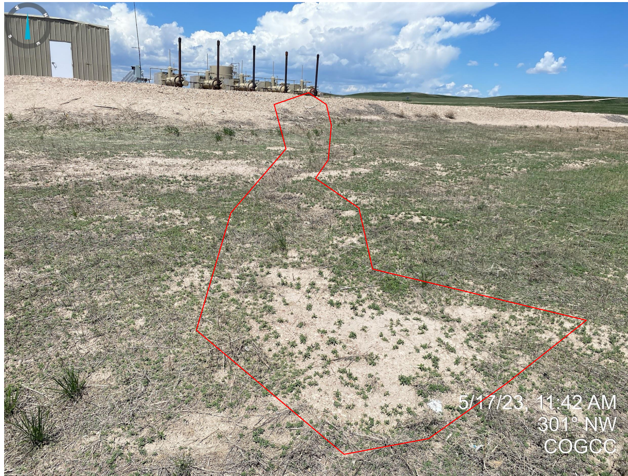
Photo 8. Several areas of the production pad/stormwater berm have been compromised with evidence of sediment transport into the interim areas. Gully and rill erosion are evident in several locations and will need to be repaired to prevent further degradation to adjacent interim areas.