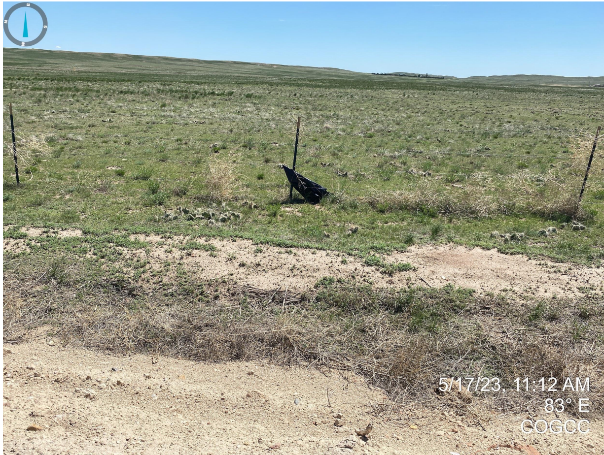
Photo 9. Debris/trash observed on location will need to be picked up and disposed of.