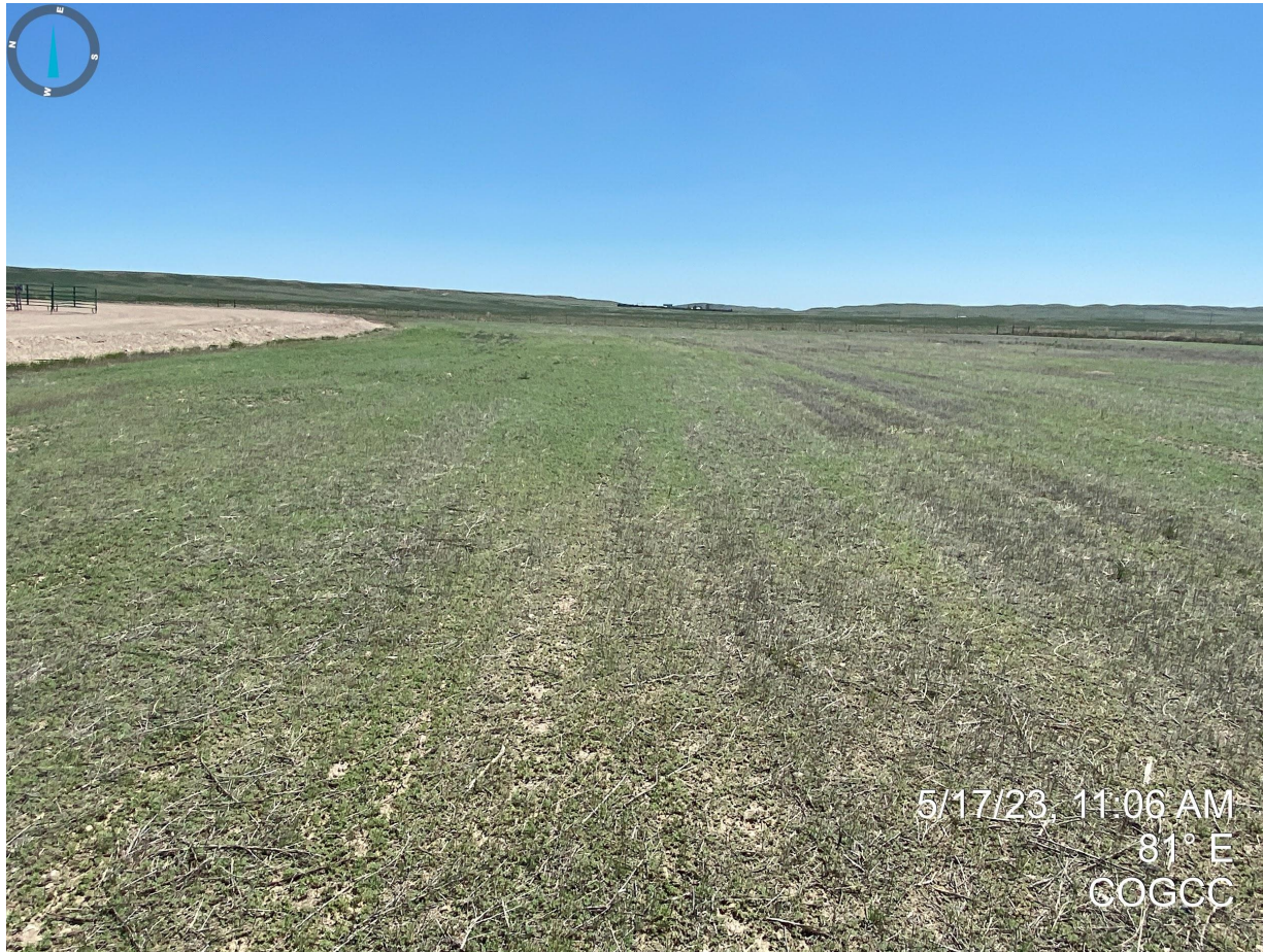
Photo 13. Interim reclamation areas are predominantly undesirable vegetation (e.g. kochia).