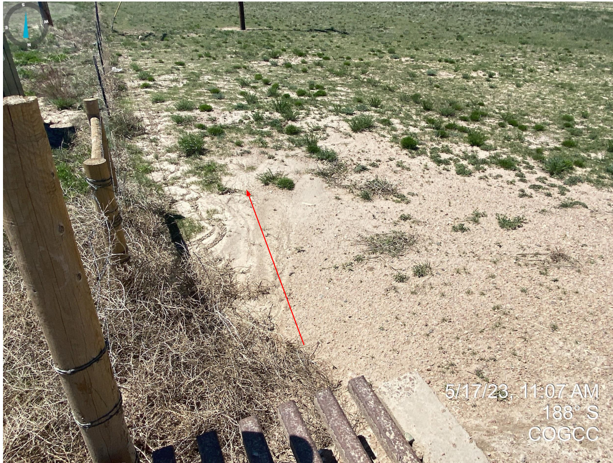
Photo 3. Evidence of sediment deposition from around the cattle guard area