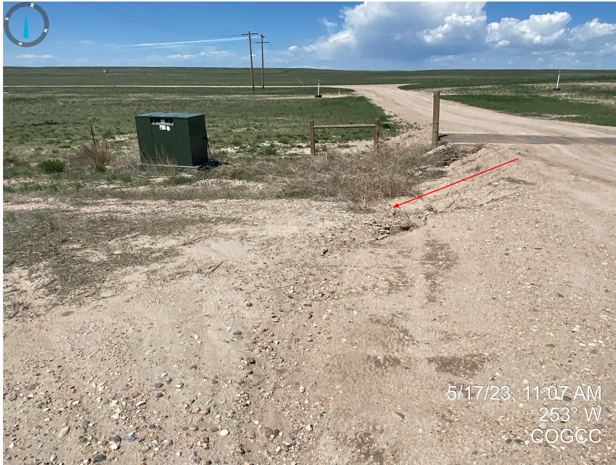
Photo 1. Taken near the entrance. Photo illustrates that the production areas don't appear to be stabilized with evidence of rill erosion occurring.