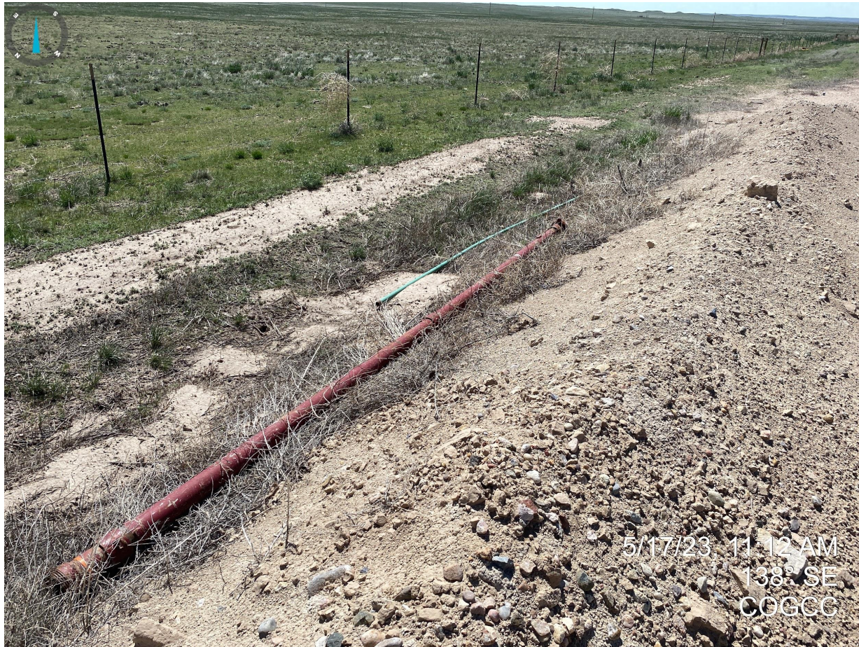
Photo 12. Unused equipment observed in the stormwater ditch.