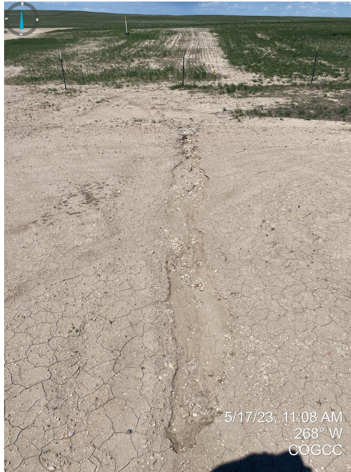
Photo 6. Rill erosion occurring on banks; no BMPs identified in this area to prevent sediment laden stormwater from exiting off location.