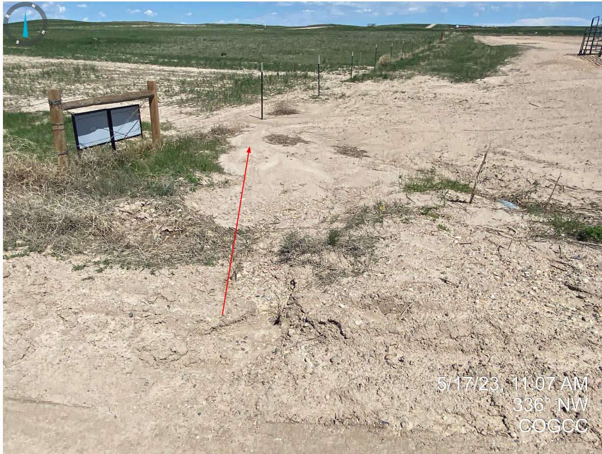
Photo 5. Rill erosion and sediment deposition.