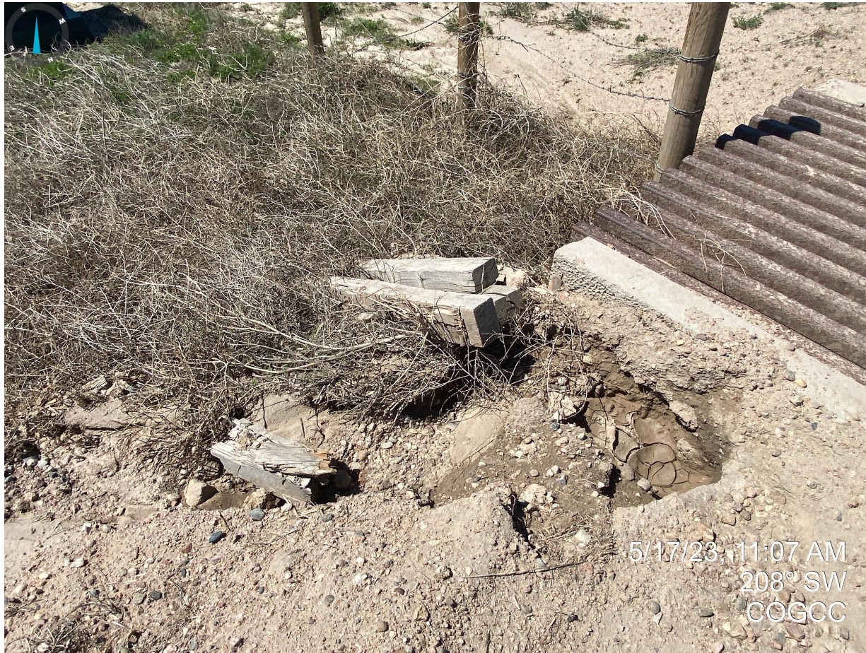
Photo 2. Area around cattle guard has gully erosion and appeared to be under cutting the concrete stem walls.