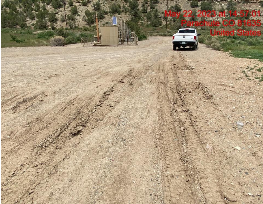
Location Lacks Stabilization – Photo #03679