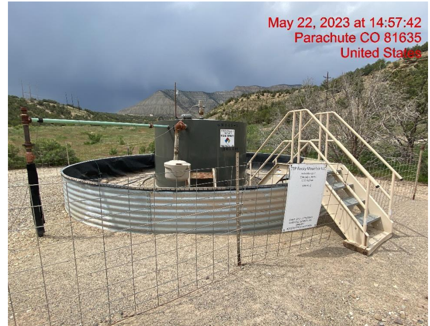
Tank Battery – Photo #03681