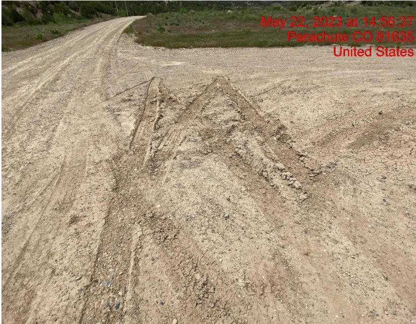
Location Lacks Stabilization – Photo #03677