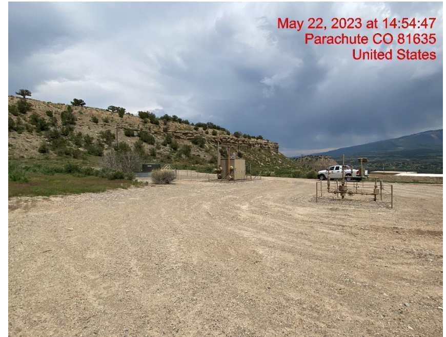
NW Corner of Location – Photo #03673