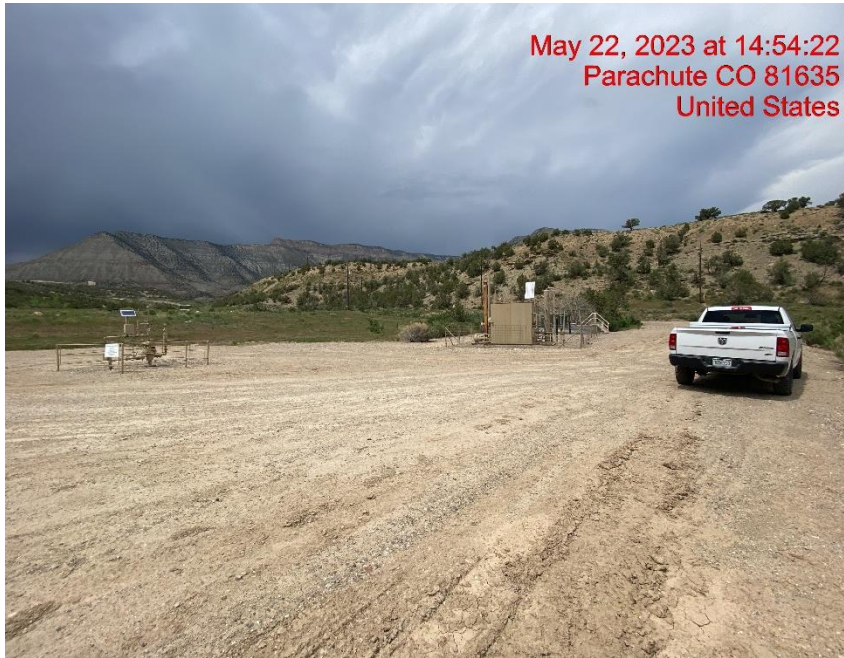
SW Corner of Location – Photo #03672