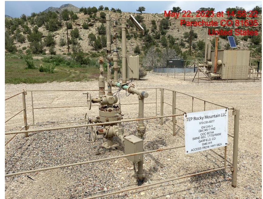
Wellhead – Photo #03675