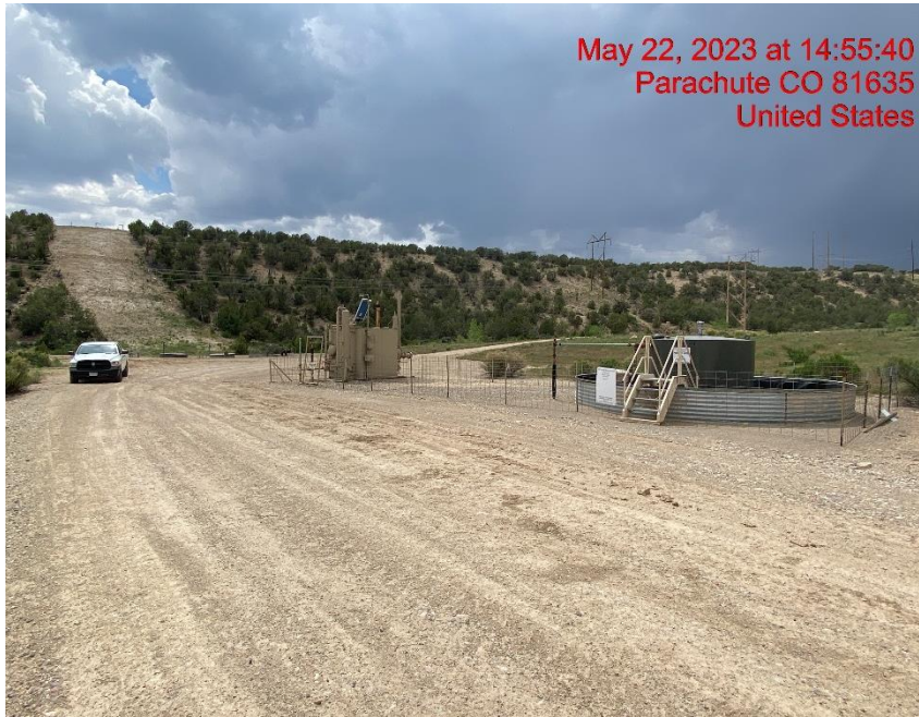
SE Corner of Location – Photo #03674