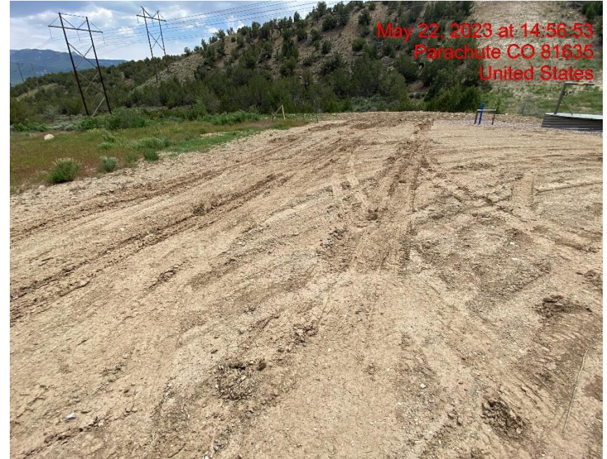
Location Lacks Stabilization – Photo #03678