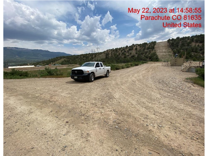
Insufficient Vehicle Tracking BMPs at Location Entrance/Exit – Photo #03685