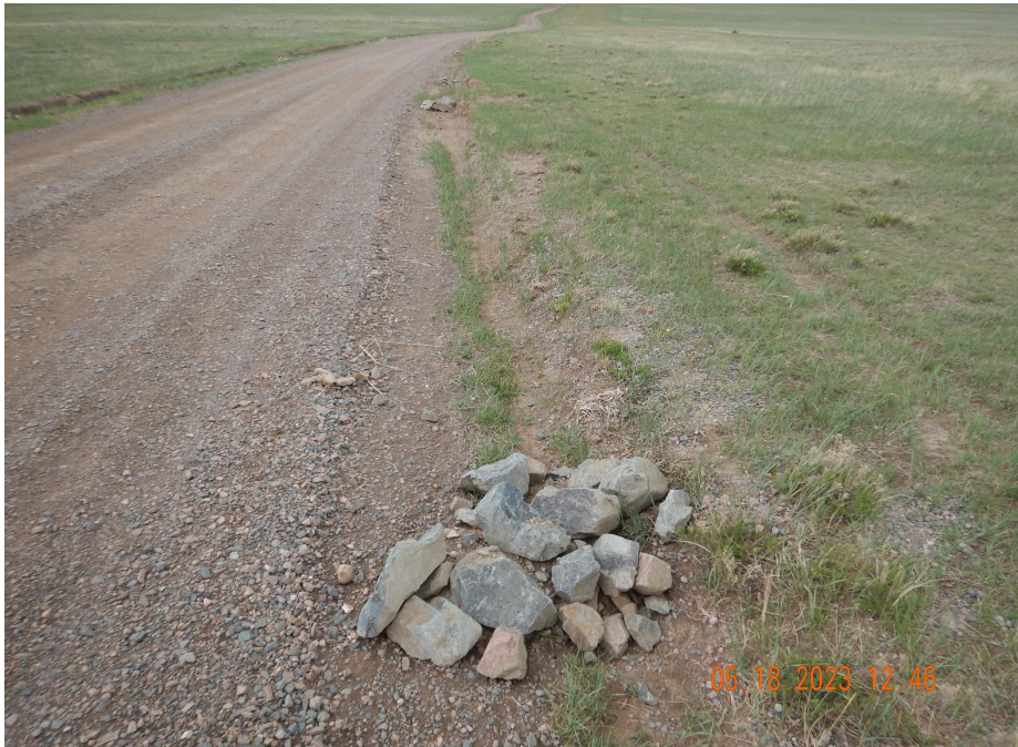
Photo 4. Photo taken from a portion of the access road, facing East. Photo illustrates check dams have been installed since the May 11th inspection. However, not all the check dams have been installed and reclamation repairs along the access road are in-process.