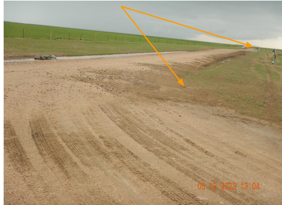
Photo 5. Photo taken from a portion of the access road near the entrance of location, facing East. Photo illustrates crews have initiated rock removal from pasture areas.