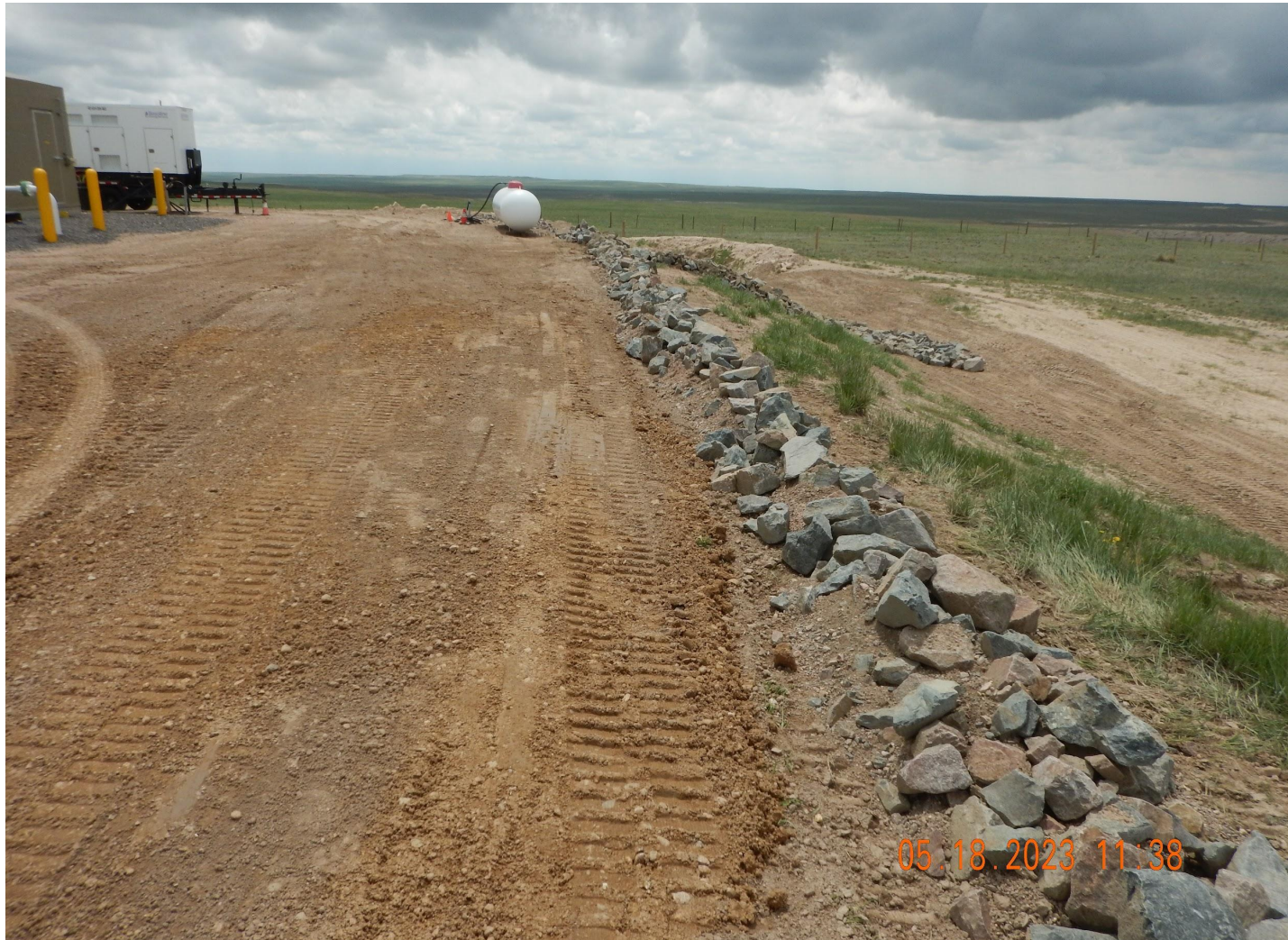
Photo 3. Photo taken from the southwestern fill slope, facing South. Photo illustrates a rocked BMP along the top of the fill slope to act as a check dam to slow stormwater runoff before it reaches the down gradient fill slope.