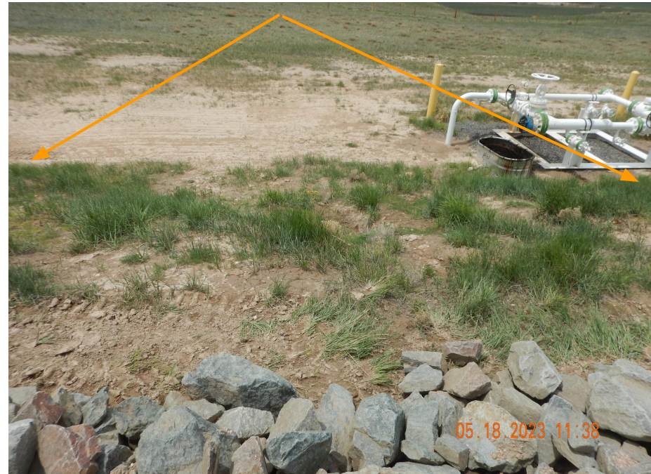
Photo 2. Photo taken from the southwestern fill slope, facing West. Photo illustrates a lack of any perimeter BMP. There is evidence of rill erosion along the fill slope within the orange arrows.